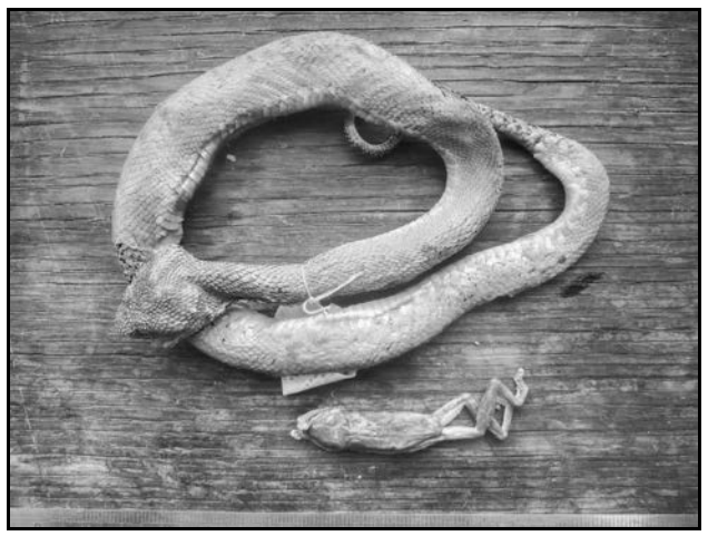
Figure 6. Preserved adult Atheris chlorechis from Ouetoua and its prey, a Hyperolius sp.

head first: one partly digested Arthroleptis sp. (Arthroleptidae) with a SVL of ca. 11 mm, and another larger frog, ingested earlier, of which only the legs are still undigested, and which cannot be properly identified.