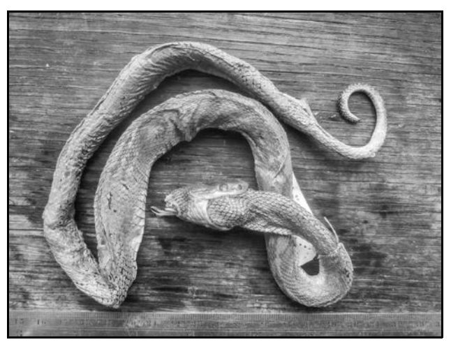
Figure 5 . Preserved adult Atheris chlorechis being predated by a Limaformosa guirali , from Balagbeni, southeastern Guinea.

Natriciteres variegata (Peters, 1861) The juvenile RBINS 20324 from Damaro had ingested two frogs