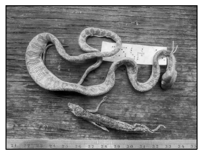
Figure 2 . Preserved juvenile Toxicodryas pulverulenta and its prey, an Agama cf. sankaranica , from Gpaolé, southeastern Guinea.

Elapsoidea semiannulata moebiusi (Werner, 1897) The subadult individual RBINS 20273 from Bankoro Fassirou has ingested, head first, an adult female Hemisus cf. guineensis