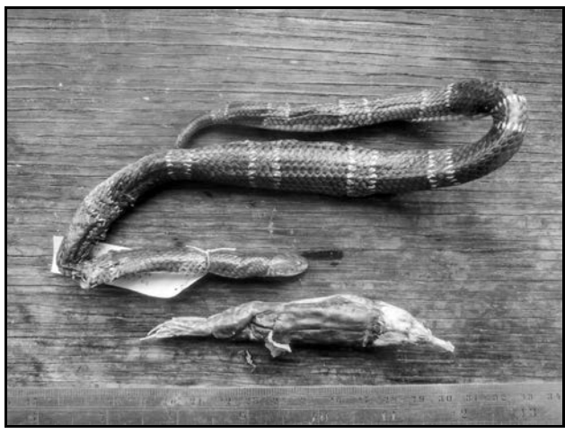
Figure 3. Preserved subadult Elapsoidea semiannulata moebiusi from Bankoro Fassirou, southeastern Guinea, and the adult female Hemisus cf. guineensis removed from its stomach.

Cope, 1865 (Anura; Hemisotidae: removed and numbered RBINS 18417) with SVL about 55 mm. While the skin of the head of the piglet frog has been digested, the body is still in good condition, and shows a black dorsum dotted with small, irregular yellow spots (Figure 3).