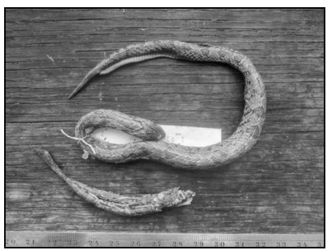
Figure 7 . Preserved juvenile Causus maculatus from Saniamoridou, southeastern Guinea, along with its prey, a Ptychadena sp.

The female RBINS 20279 from Ouetoua had ingested an adult Hyperolius sp. (Anura; Hyperoliidae: removed and numbered RBINS 18410) (Figure 6). The reed frog, ingested legs first, is nearly intact, and shows a SVL of 32 mm, a horizontal pupil, a snout longer than the eye, a uniformly brown dorsum, a dark brown, irregular stripe on the flanks, extending from the snout to the groin; yellow irregular spots on the lower flanks under the dark brown stripe; and belly and lower surfaces of head and limbs uniformly beige. The viper shows 20/18 circumoculars, and a paraventral row much broader than the other dorsal rows (this latter character in contradiction with the identification key and account provided by Chippaux and Jackson [2019]).