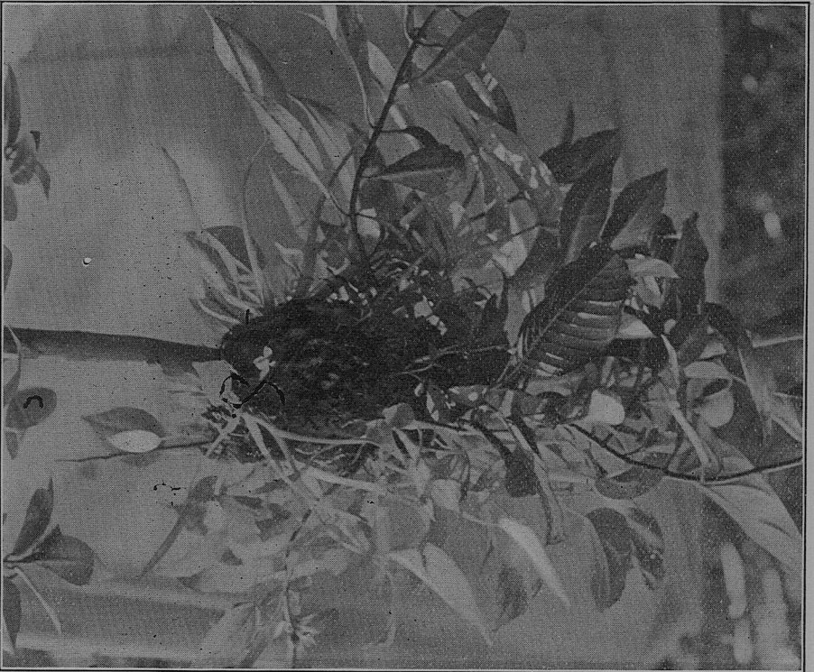
FIG. 2. Closer view of one of the ant-gardens of Fig. 1, showing the earthen portion bearing the plants more distinctly.

In British Guiana, at least, four different ants form flourishing colonies in the gardens, namely, Camponotus ( Myrmothrix ) femoratus , Cremato-