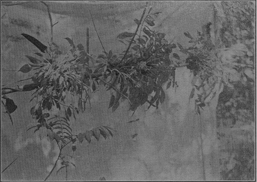
FIG. 1. Three small ant-gardens on a sapling. The earthen portion of each was about the size of a large orange.