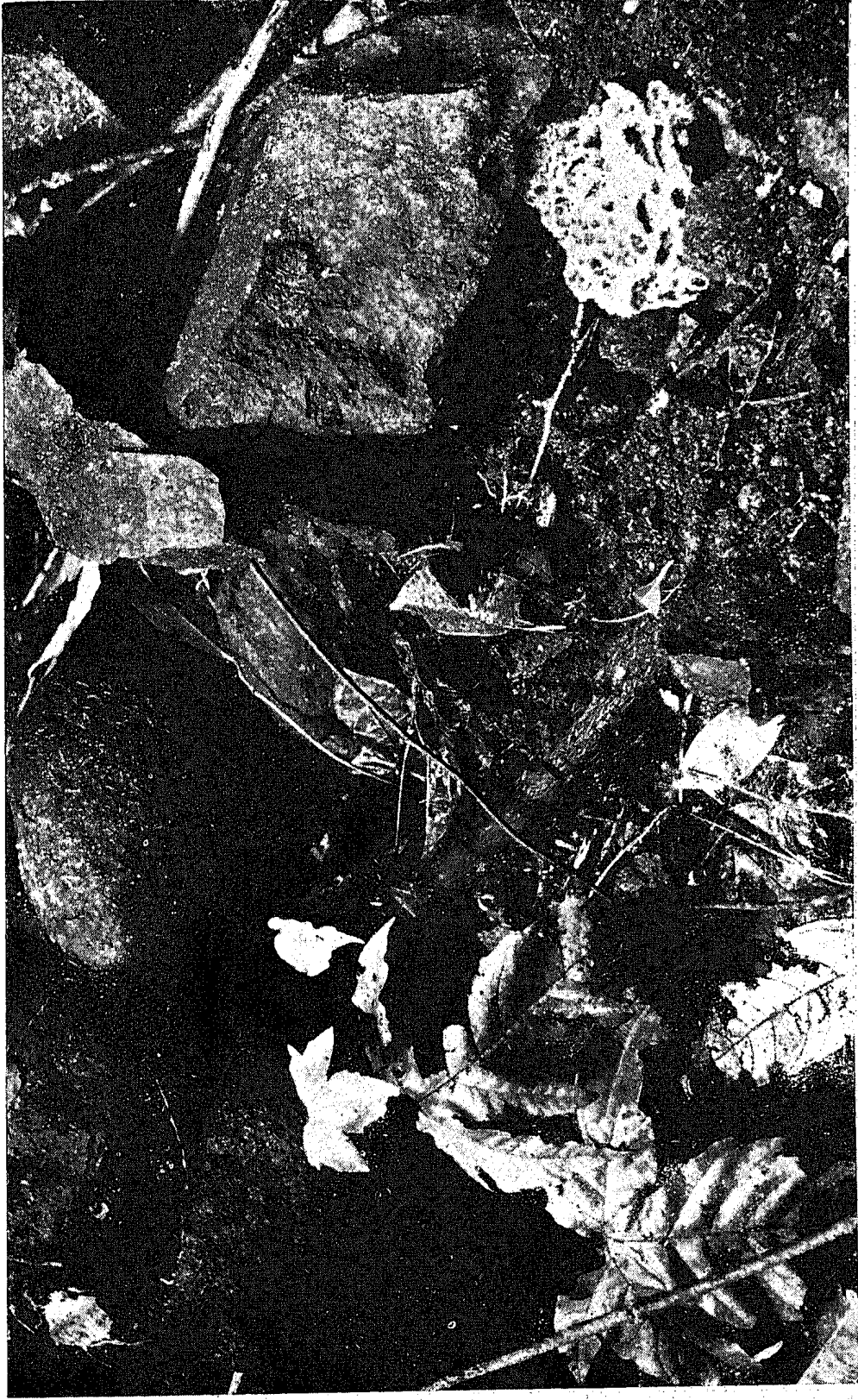
Nest of Aeromyrmex octospinosus echinator Forel (lower right), containing a single fungus garden as it appeared when the overlying rock was removed. The rock also covered the small nest of Apterostigma angulatum Weber (upper left). (Barro Colorado Island)