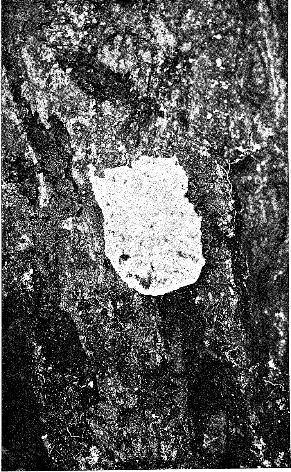
Close-up view of the garden of Apterostigma angulatum on Plate 7, as it appeared when the ventral part of the envelope was removed. Loosely cellular fungus garden contained the brood and adult ants. (Barro Colorado Island, N. A. Weber photo)