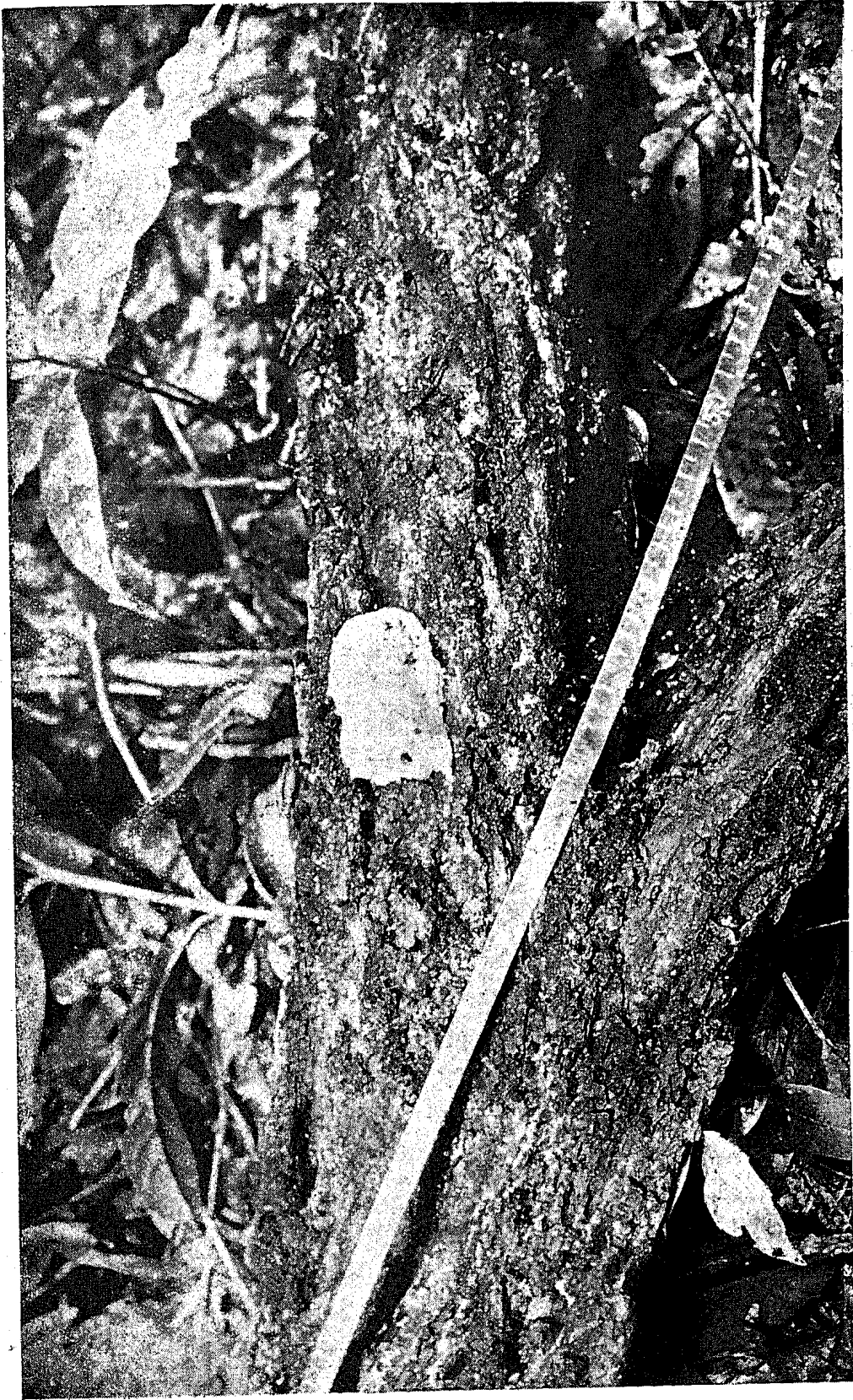
Fungus garden of Apterostigma angulatum Weber clinging to the under surface of a log as it appeared when the log was overturned. The garden fitted into a symmetrical cell in the soil. Steel tape ruled in half-centimeters. (Barro Colorado Island)