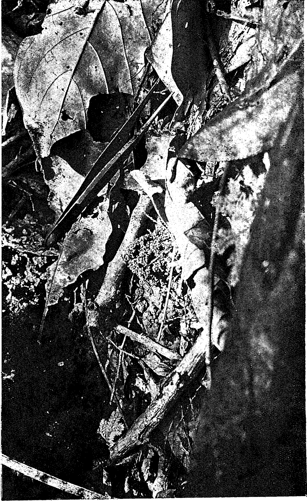
Crater entrance to nest of Mycocepurus tardus Weber to left of 113 mm. forceps. Several openings lead to the single tunnel which in turn leads to the fungus garden in the soil several centimeters below the surface. (Barro Colorado Island)