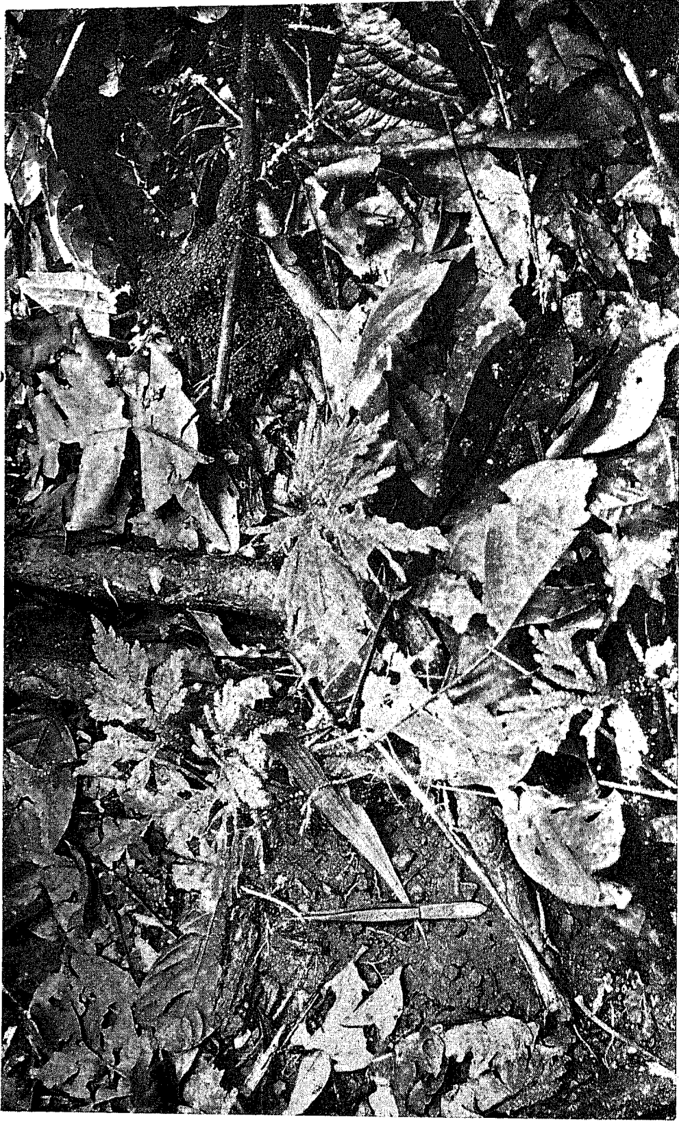
Site of the nest-moving of a colony of Trachymyrmex isthmicus Santschi. Entrance of the old nest at the tip of the forceps (which are 113 mm. long). Crater entrance to the new nest in upp right. Path taken by the ants in carrying fungus garden and brood to new site 52 cm. long. (Barro Colorado Island, N. A. Weber photo)