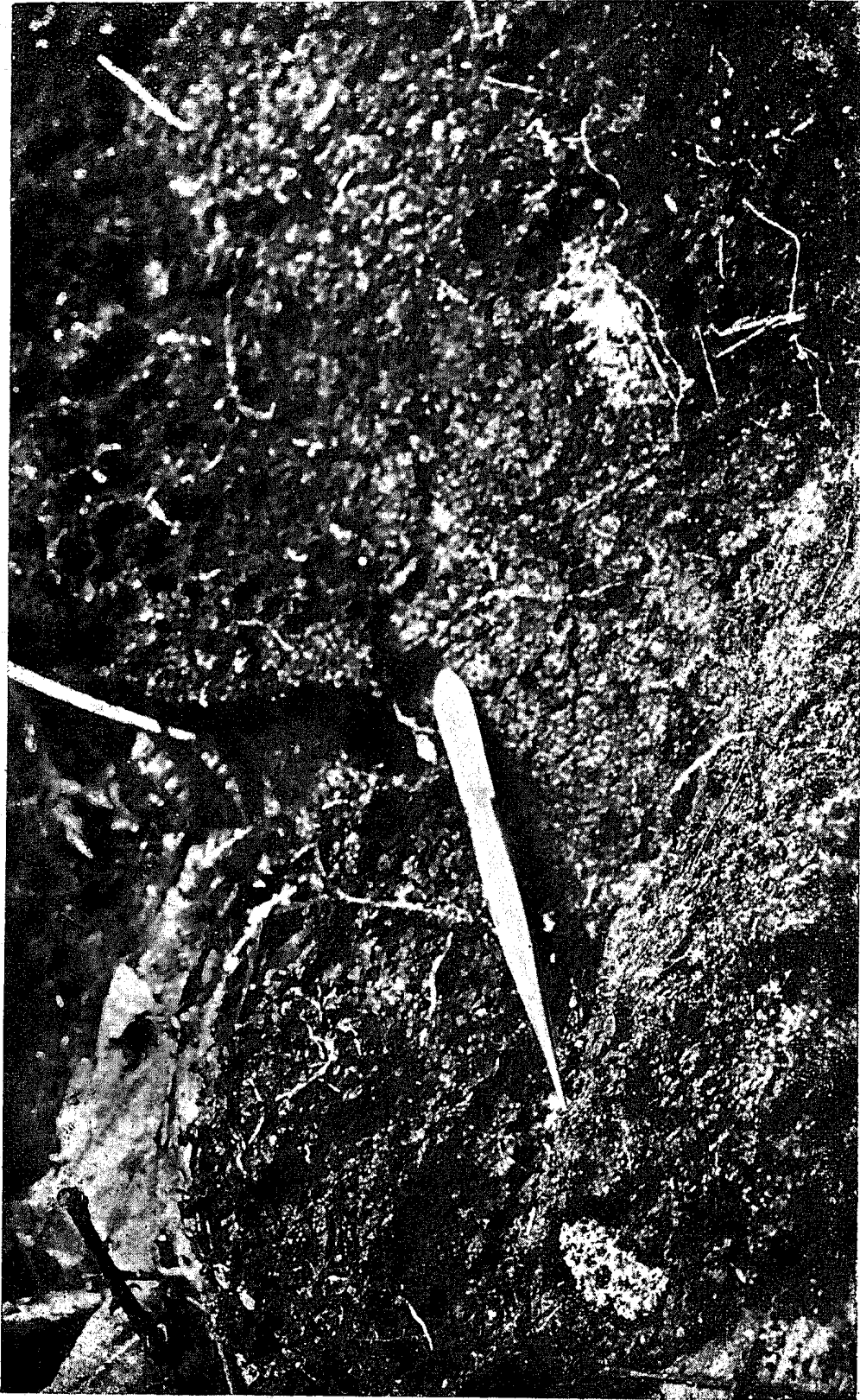
Cyphomyrmex costatus Mann nest on left which contained a colony of the new-guest ant, Megalomyrmex wheeleri Weber. The latter colony was in an earth cell which opened only to the single fungus garden of the host. Gray patch on right the young fungus garden of Apterostigma mayri Forel. Forceps 113 mm. long. (Barro Colorado Island, N. A. Weber photo)