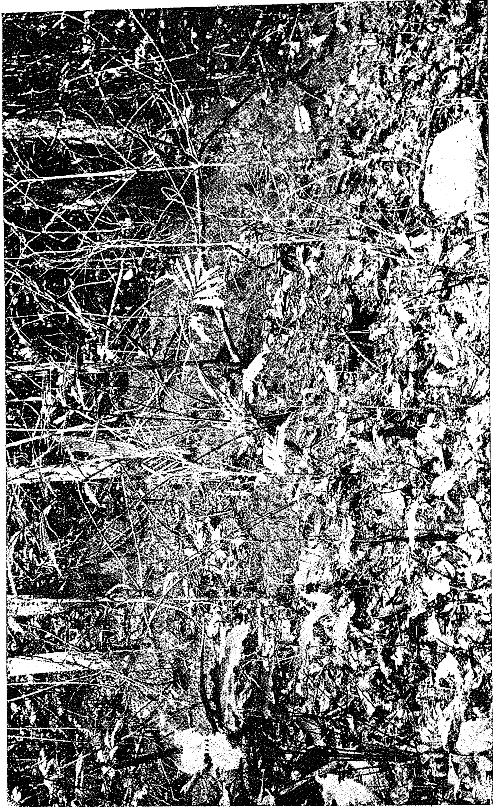
Large multiple-crater nest of Atta cephalotes subsp. isthmicola Weber on a moderate slope. By persistent defoliation the ants had formed a clearing about the nest. Partly defoliated small palms and saplings in foreground. (Barro Colorado Island)