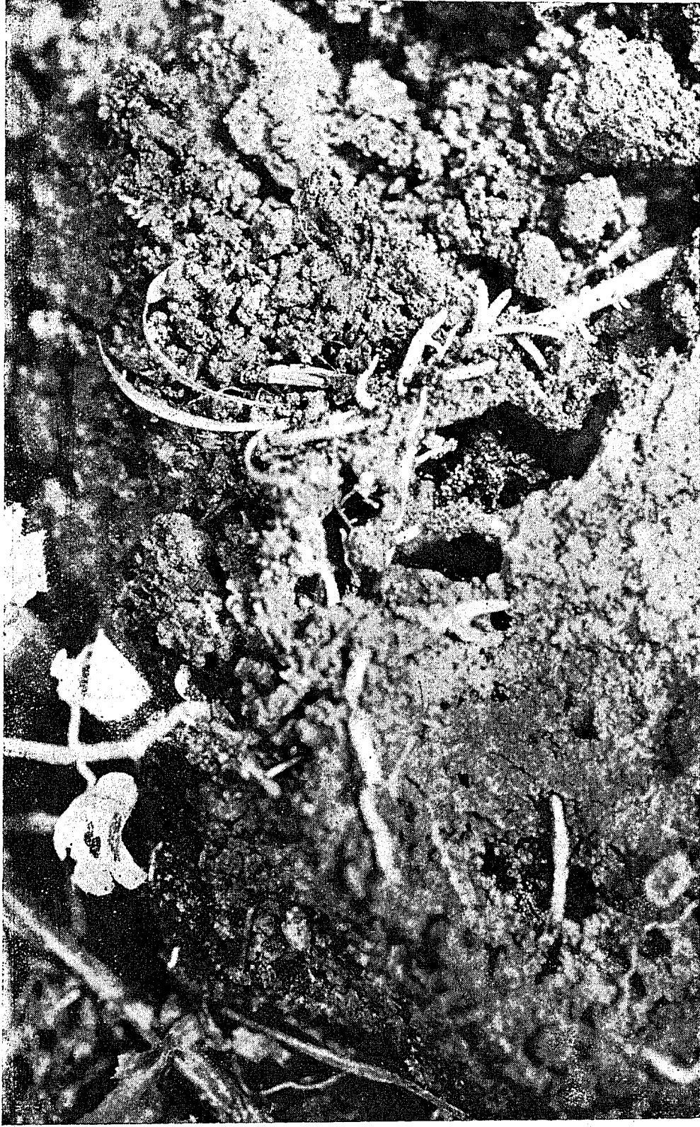
Nest of Cyphomyrma rimosus Spinola as it appeared when the overlying log was removed. In the irregular chambers (center) appears the fungus garden of insect feces with cheese-like tiny masses of bromatia peculiar to this widespread species. (Barro Colorado Island)