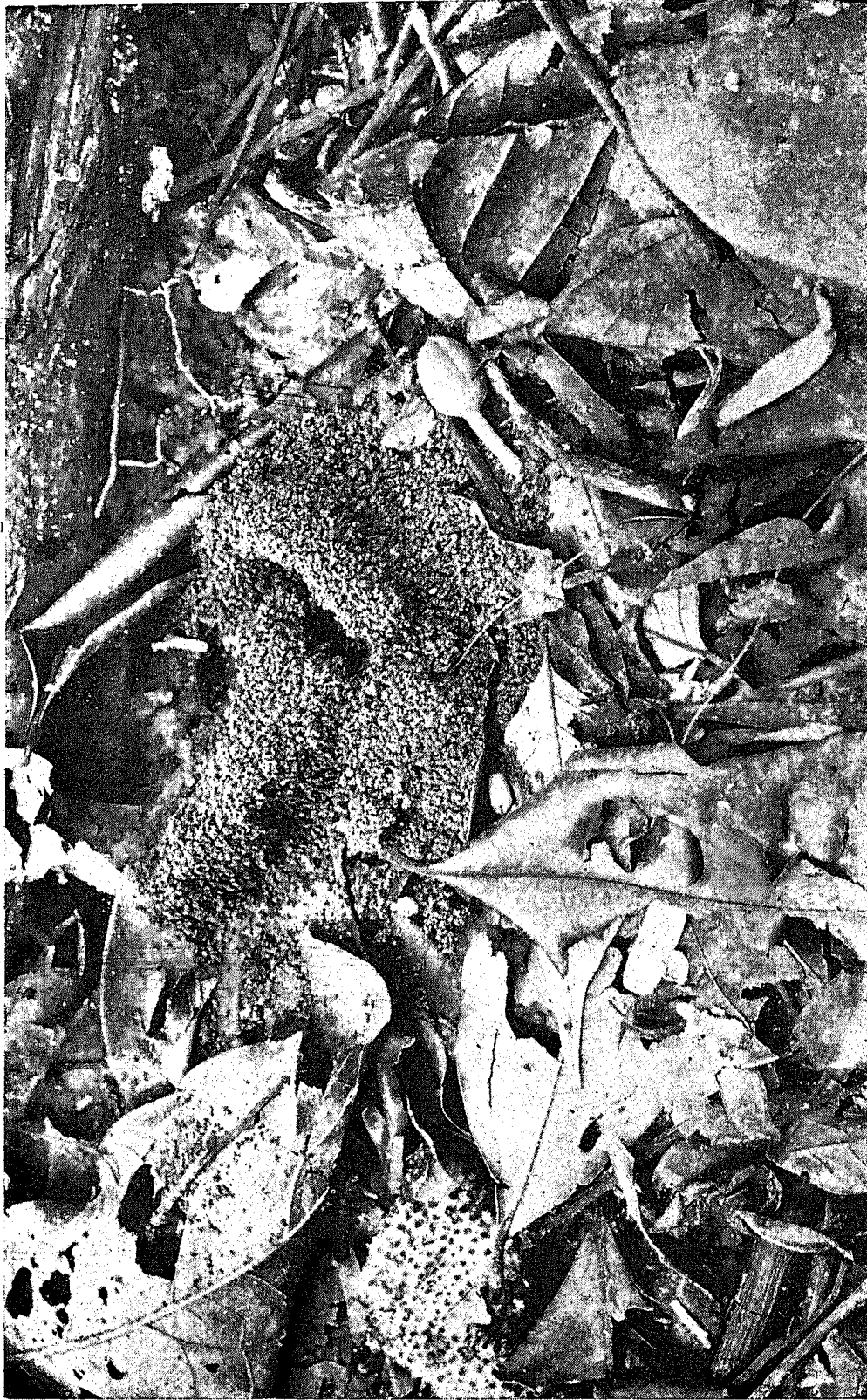
Irregular crater entrance to nest of Myrmecocrypta ednaella Mann. Several centimeters below the surface was the single large fungus garden. (Barro Colorado Island, N. A. Weber photo)