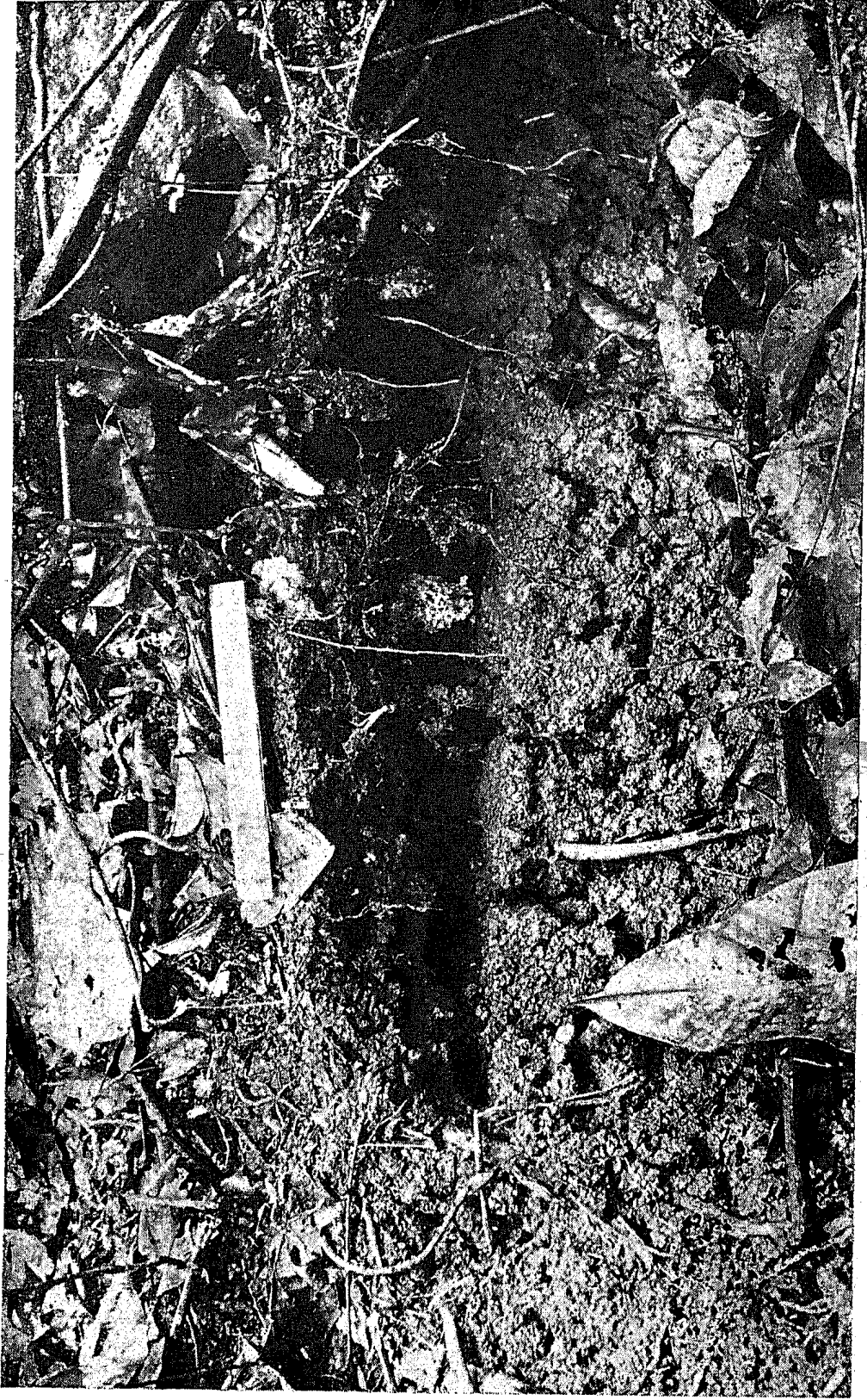
Polydomous nest of Apterostigma angulatum Weber in a crevice in the soil. The crevice had been against a boulder which had rolled down a steep slope. Beneath the 15 cm. ruler appear two fungus gardens and there was another on each side (Barro Colorado Island)