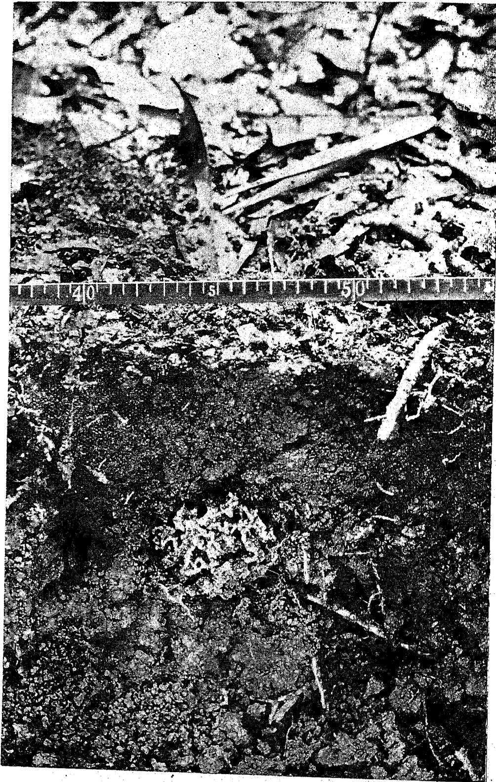
Nest of Sericomyrmex amabilis Wheeler which contained a colony of the guest ant, Megalomyrmex symmetochus Wheeler. The latter colony occupied the lower part of the fungus garden of the host. Steel tape ruled in half-centimeters. (Barro Colorado Island, N. A. Weber photo)