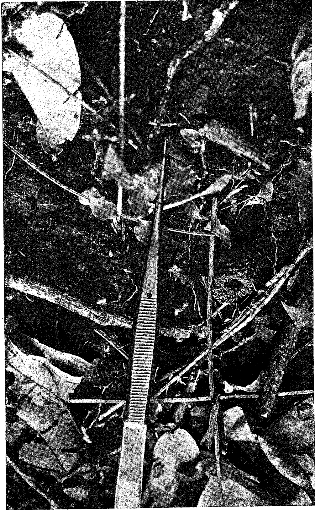
Crater entrance to nest of Trachymyrmex morgani Weber, one of the smallest species of the genus. Forceps 113 mm. long. (Barro Colorado Island, N. A. Weber photo)