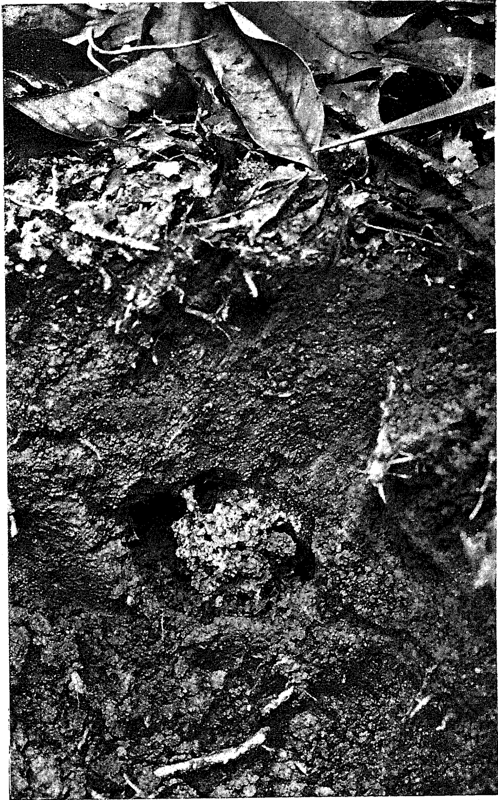
Nest of Myrmicocrypta ednaella Mann. Forceps (113 mm. long) point to nest entrance beneath which is the single fungus garden. (Barro Colorado Island, N. A. Weber photo)