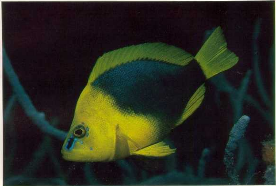
Figure 1.--Adult Hypoplectrus guttavarius (the shy hamlet) approximately 11 cm in length.

the Buck Island Channel outside Teague Bay Reef on the northeast coast of St. Croix. Observations were made from February 20 to March 3, 1980. Further site descriptions are given by Neudecker and Lobel, 1982.