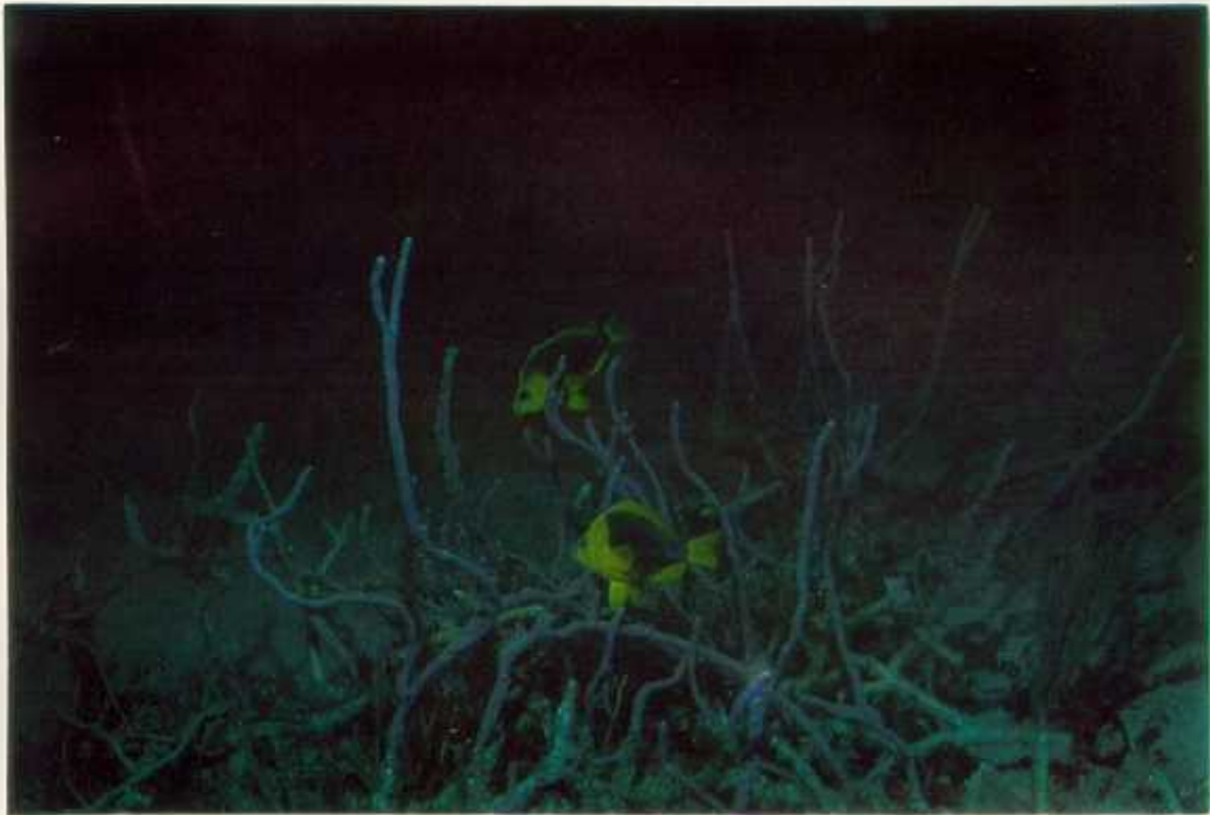
Figure 2.--A pair of Hypoplectrus guttavarius engaged in courtship at a typical spawning site (Deep Reef at East Wall of Salt River Canyon, HYDROLAB site).

The disturbance manipulations were conducted the day after baseline spawning behavior was determined. The manipulation was to disrupt the spawning act each time the fish attempted it. As the pair began to enter the spawning clasp, the observer swam rapidly toward the pair (in an attempt to mimic a predator's behavior). The pair was harassed repeatedly this way for as long as spawning was attempted. When mates parted, close watch was maintained until it was certain that spawning had ceased for the night. Occasionally, a pair would separate, swim several meters apart, return several minutes later, rejoin and attempt to spawn again. Follow-up observations were made on the same pair the day after the manipulation. Data analysis of treatments used the nonparametric Mann-Whitney U test statistic.