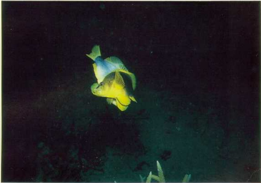
Figure 4.-- Hypoplectrus guttavarius embraced in the spawning clasp. The individual folded around the other one facing head-down opens its mouth while quivering and spawning.

as both fish quiver. Quivering lasts for 2-3 sec. The individual folded around the other often opens its mouth while quivering (fig. 4). Following consummation, the fish cease embracing and quickly descend to the bottom. The embracing behavior of hamlets when spawning has been termed the spawning clasp (Fischer, 1980a) and occurs many times throughout an evening. Infrequently, fish would embrace but not quiver, and the release of gametes was not evident. Fischer (1980a) has described the similar spawning behavior and sexual role of H. nigricans .