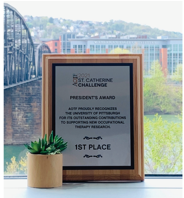
Top 2021 Fundraising School: University of Pittsburgh

AOTF is so appreciative of the work and dedication of students and faculty and the support of everyone who made gifts. We know that as schools moved to remote education, students and faculty juggled virtual learning, fieldwork and health concerns yet remained dedicated to this philanthropic initiative. This year's success is a true testament to the commitment, innovation and perseverance of our young occupational therapists.