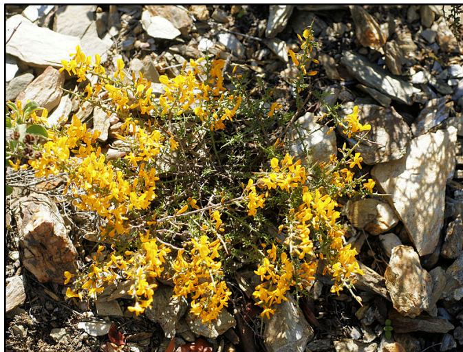
Calicotome spinosa in Sardinia (Hillewaert, 2008)