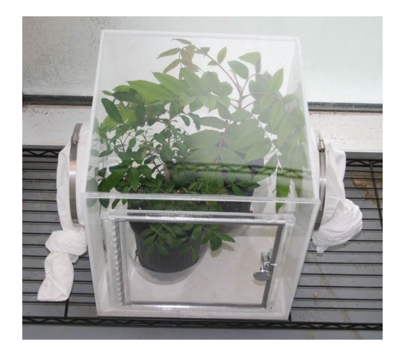
Figure C. Plexiglas® cages (50 cm x 50 cm x 50 cm) used to conduct choice tests for P . ichini . This replicate contains one plant of the target, Brazilian peppertree and one plant of Rhus sandwicensis . When second instars were observed, the adults were removed and the plants were separated into individual cylindrical cages for emergence of F_1 adults.

and each plant was placed separately into the standard vented cage (Fig. B). The exposed plants were left undisturbed for at least 27 days then the number of F_1 adults produced in each cage was counted and the experiment was terminated. This way preference of P. ichini could be determined and again (as in the no-choice tests) whether the test plant was a developmental host.