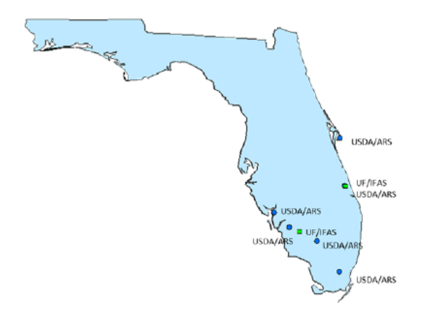
Figure A. Sites selected for initial releases of C. latiforceps in Florida (Overholt et al., 2015).

Once enough data is gathered on establishment rates and plant impact in Florida, the researchers will work with authorities in Texas to determine their interest in releases.