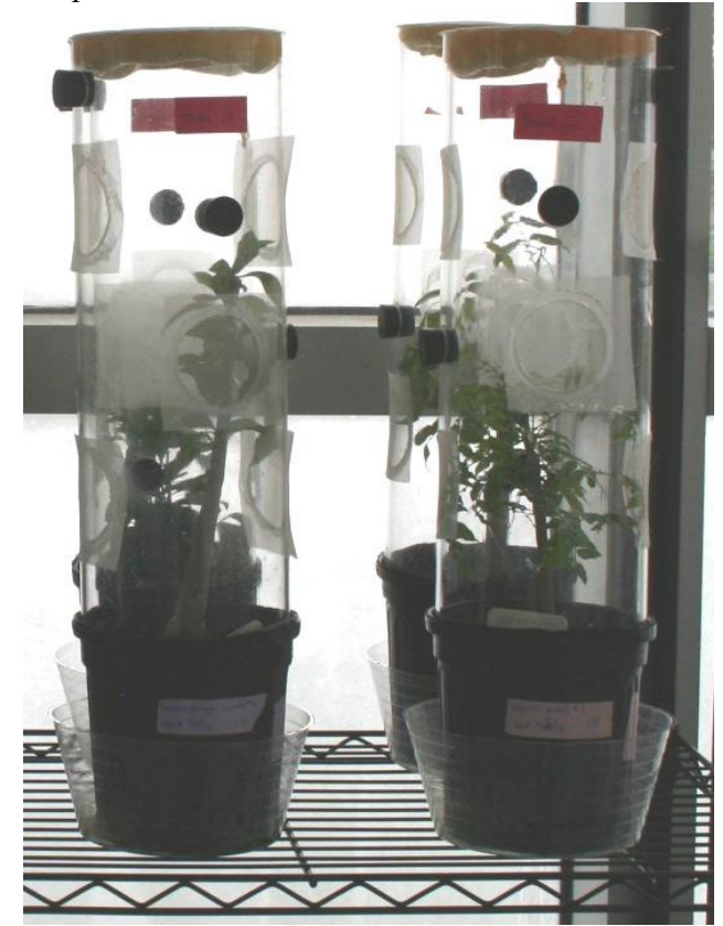
Figure B. Plexiglas cylinders (45 cm x 15 cm diameter) used to conduct no-choice tests for the thrips Pseudophilothrips ichini .