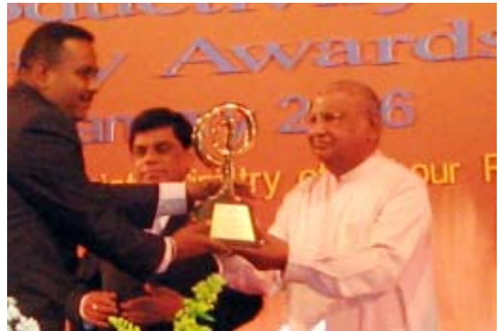
Prime Minister Wickramanayake (R) presenting a trophy to an awardee