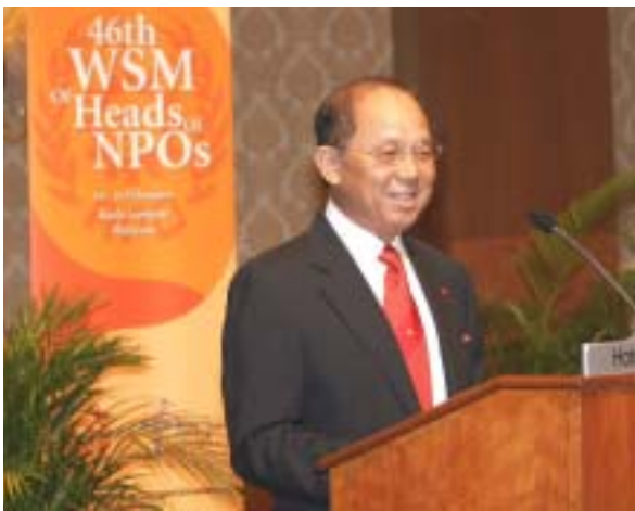
Tan Sri Dato' Azman Hashim delivering the welcome address

The heads of the national productivity organizations (NPOs) of 19 APO member countries, together with their agriculture delegates and advisers numbering 52, met in the beautiful tropical city of Kuala Lumpur, Malaysia, 14–16 February, to participate in the annual program and strategic planning meeting of the APO at the 46th Workshop Meeting of Heads of NPOs (WSM). In addition to the delegates and advisers, there were six observers from Botswana, Brunei, South Africa, Colombo Plan Secretariat, and Confederation of Asia-Pacific Employers. The mild temperature with occasional tropical showers during the gathering not only helped the delegates to enjoy their stay in Kuala Lumpur but also reminded them that they were there at one of the best times of year in Southeast Asia. The WSM was initially scheduled to be held in Pakistan. However, due to a devastating earthquake that struck the north of the country and parts of neighboring India in October last year, resulting in untold loss of lives and destruction of homes and property, the meeting was relocated to Kuala Lumpur.