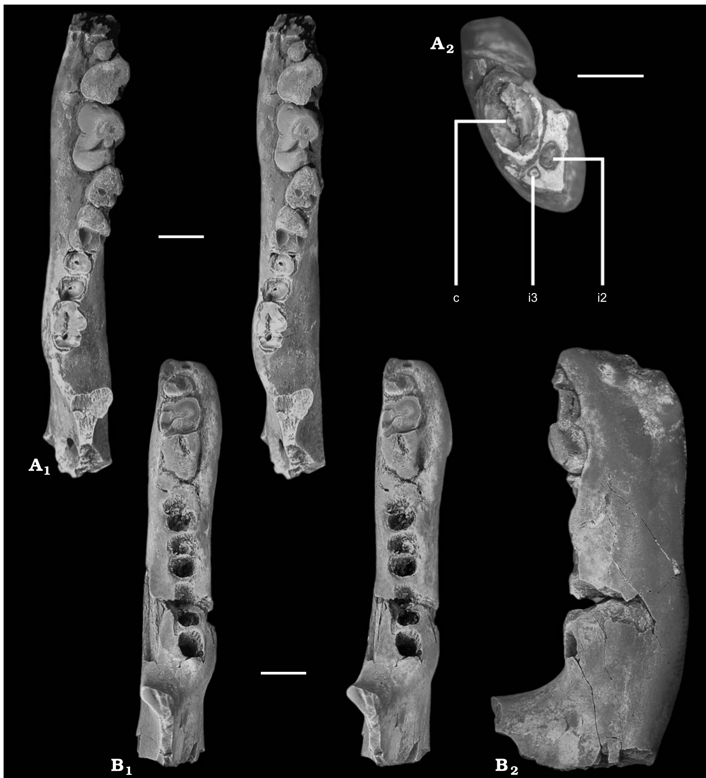
Fig. 2. Didelphodon coyi Fox and Naylor, 1986 from the Horseshoe Canyon Formation, Edmontonian Land Mammal Age (early Maastrichtian). A. TMP 91.161.1, Paintearth Creek, Alberta, incomplete right dentary, containing 12-3 (broken), c (broken), p1-3, m1-2, m3-4 (broken) in occlusal (A 1 ) and anterior (A 2 ) views. B. TMP 90.12.29, Michichi Creek (type locality), Alberta, incomplete left dentary, containing p3 (broken) in occlusal (B 1 ) and labial (B 2 ) views. A 1 and B 1 stereophoto pairs. Scale bars 5 mm.

delphis brevicaudata (Erxleben, 1777) (Wible 2003). At the anteriormost extent of this margin, the shelf turns abruptly medially a short distance before reaching a now-broken