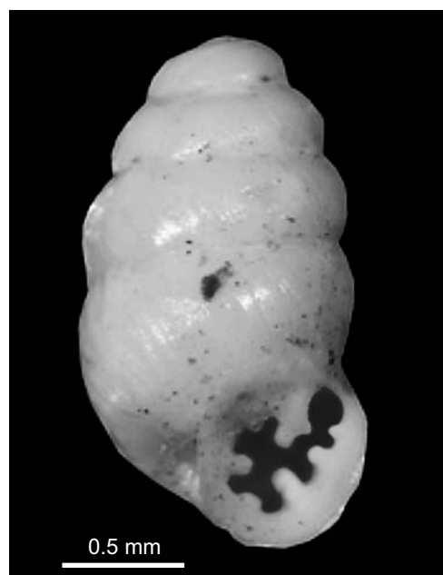
Fig. 1. Pupa suevica sensu Sandberger (= Gastrocopta sandbergeri sp. nov.) from the Sandberger's collection (MWNH-22-2), Miocene (Astaracian, MN7), Steinheim.

2000 Gastrocopta sp.; Manganelli and Giusti 2000: pl. 6: 17.