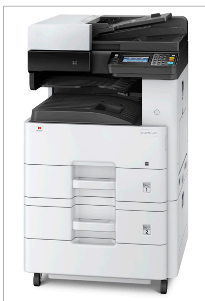
d-Copia 255MF with optional PF-470 drawer