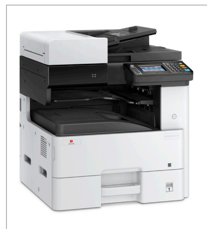
d-Copia 255MF in standard configuration