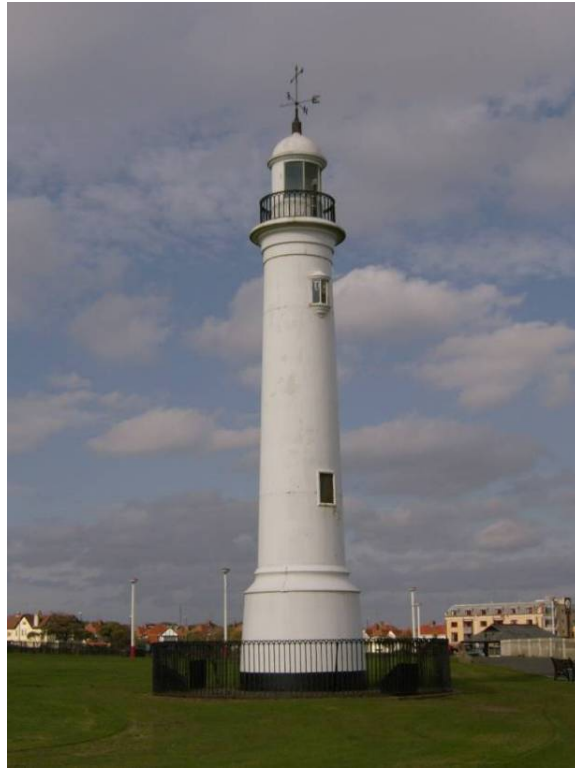
Figure 7.10 The Grade II* South Pier Lighthouse, Sunderland re-sited at Roker (author)