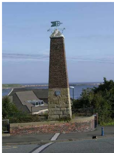
Figure 7.15 The East Lawe Beacon, South Shields

A similar, though less complex arrangement was provided on the South Shields side where the West and East Lawe Beacons (NZ36546806, T&W 2347 and NZ36596808, T&W 2346) provided a leading line on the south side of the river mouth. These structures are both brick built obelisks on stone bases with stone caps. They date from 1832 and are Grade II Listed Buildings.