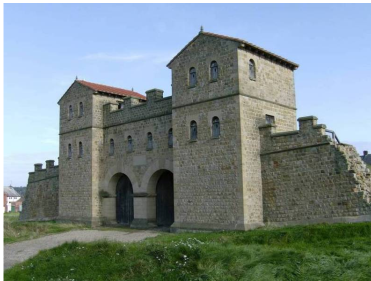
Figure 7.5 The reconstructed gate at South Shields Roman Fort

The original earth and timber fort was replaced in stone circa AD160 but a more major reorganisation occurred in the first decade of the C3 when the fort was turned into a supply base both for the garrison of Hadrian's Wall and for military operations north of the frontier. This involved subdividing the fort into northern and southern portions and extending the southern portion by 45m. The barracks in the northern portion were demolished and replaced by 18 granaries. The garrison at this time consisted of units of infantry. Further reorganisation occurred circa AD230 when more granaries were added. The fort appears to have been abandoned at the end of the C3 but was reoccupied at the end of the C4 with activity in the post-Roman and Early Medieval periods being recorded.