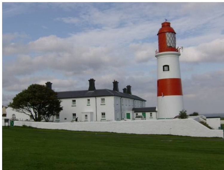
Figure 7.11 The Grade II* Lighthouse at Souter Point

The earliest record of a lighthouse on this section of the coast is the provision by the monks at Tynemouth of a light to be shown in on one of the two turrets at the east end of the priory church, to act as a guide to mariners entering the Tyne. This monastic ‘lighthouse’