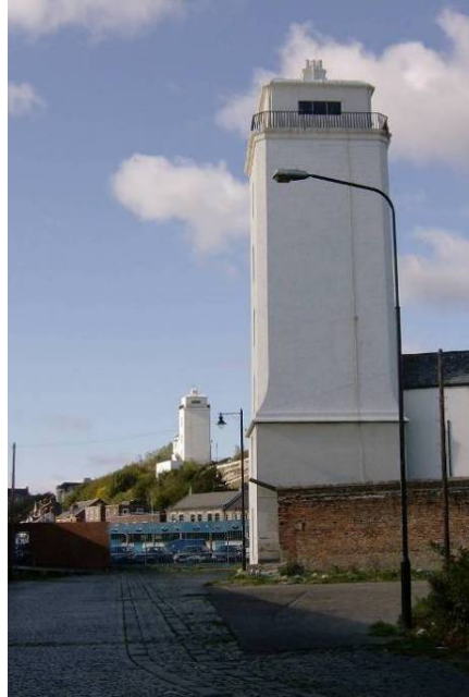
Figure 7.14 The ‘New’ High and Low Lights at North Shields (author)

necessitated the provision of two new towers, a New Low Light (NZ36296844) and a New High Light (NZ36056838, T&W 2129). Both the New Lights are Grade II Listed Buildings.