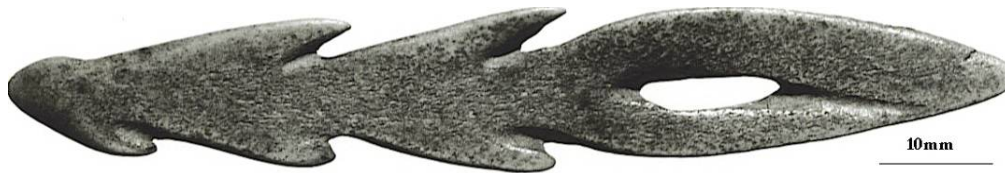
Figure 7.4 The Whitburn barbed point, ventral view (Museum of Antiquities)

The only unequivocal indication of coastal/maritime exploitation strategies during the Mesolithic period in Block 3 is provided by the barbed point picked up on the foreshore at Whitburn in 1852. This item, which appears to be made out of a segment of red deer antler, has been fully described by Mellars (1970). It measures 87mm long and varies in width from 14mm to 4mm. It has three barbs on each side, although the distal pair are very worn and almost vestigial. There is an oval hole for the attachment of a line at the broad, proximal end which suggests that this item should be classified as a harpoon. Flat, barbed points, either