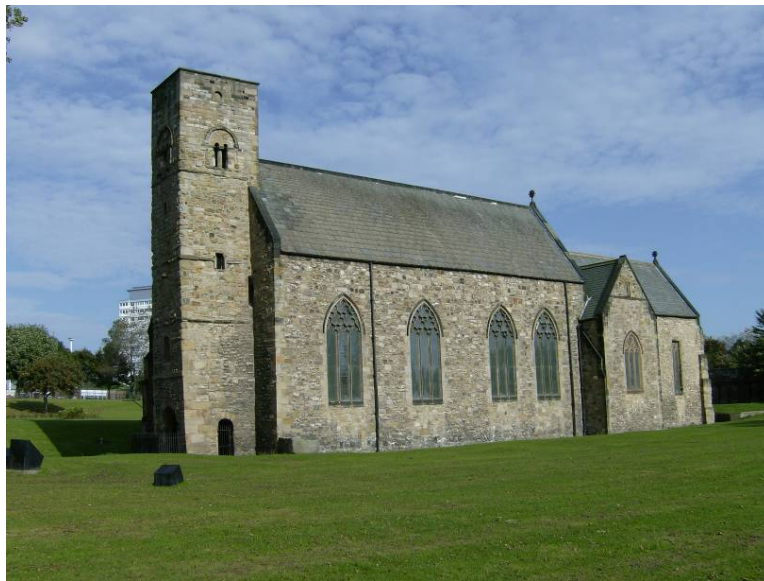
Figure 7.3 St Peter's Church, Monkwearmouth

Of the surviving fabric, it has been suggested that the west wall of the nave and the lowest stage of the tower represent the earliest remains and date from the late C7, with further stages being added to the tower circa 700 and at the end of the C10. The rest of the church represents a C13 rebuilding. The pre-Conquest monastic buildings were replaced by a standard conventual layout in the late C11 but excavations have shown that the earlier arrangements were more haphazard and similar to those identified at Hartlepool (Pevsner 1983, 465-467). Monkwearmouth monastic settlement is a Scheduled Ancient Monument.