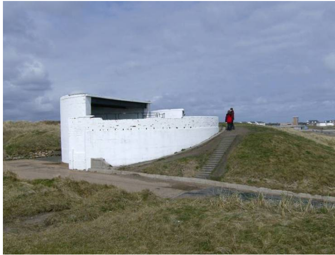
Figure 7.19 Coulson Battery, Blyth; the southern gun emplacement

southern limits. Further accommodation lay outside the perimeter in the area between the battery and the searchlight emplacements (see below). In 1925 the battery became incorporated within the development of the South Beach, only to be brought back into service in WWII (see below). Coulson Battery is a Scheduled Ancient Monument.