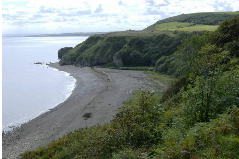
Figure 7.2 Eroding colliery waste at Hawthorn Hive, County Durham

may well be of archaeological significance. Secondly, the removal of the colliery waste is likely to have a bearing on the rate of erosion at the foot of the cliffs. Coupled with rising sea level the rate of 0.3m per year may well be a significant under-estimate.