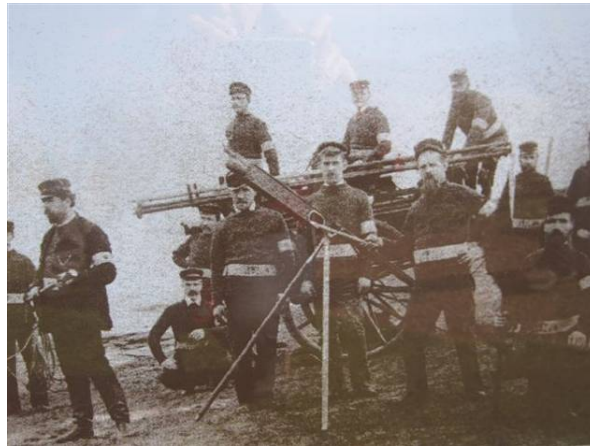
Figure 7.16 The Seaton Sluice Brigade mustering with their rocket apparatus

The facilities usually consisted of a lookout, accommodation for members of the brigade when on duty and the mountings for, and storage of, the rocket apparatus, though these latter are rare survivals. Several of these brigades are still in existence, and their premises often incorporate small museums documenting their history.