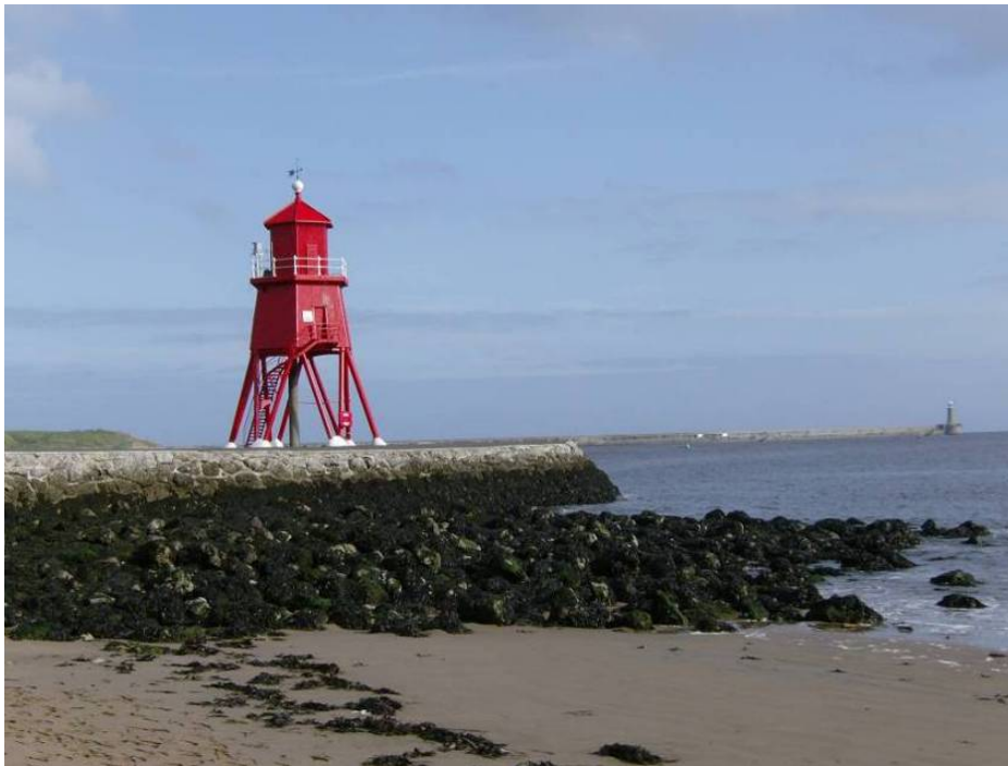
Figure 7.12 The South Groyne Lighthouse, Tynemouth with the North Pier and Lighthouse in the distance

collapsed in 1659 and was replaced in 1664 by a purpose built structure at the NE corner of the headland, which employed a coal fired brazier to provide a light. This lighthouse was rebuilt in 1775 and the earlier coal brazier was replaced by an oil lamp in 1802. It was finally demolished in 1898 (Saunders 1993, 39) when it was made obsolete by the construction of the lighthouses at the end of the North Pier and on St Mary's Island, to the north (Hague and Christie 1977, 76-78). The North Pier lighthouse (NZ38286904, T&W 7347) was built as part of the construction of the North Pier, which was completed in 1895. It is a Grade II Listed Building. While the South Pier was not provided with a lighthouse, one had already been erected on the South Groyne at the mouth of the river in the 1860s (NZ36926831, T&W 2431). This is an unusual structure consisting of a hexagonal iron and wood cabin raised on six struts. The cabin is approached by a flight of stairs and surmounted by a lantern chamber.