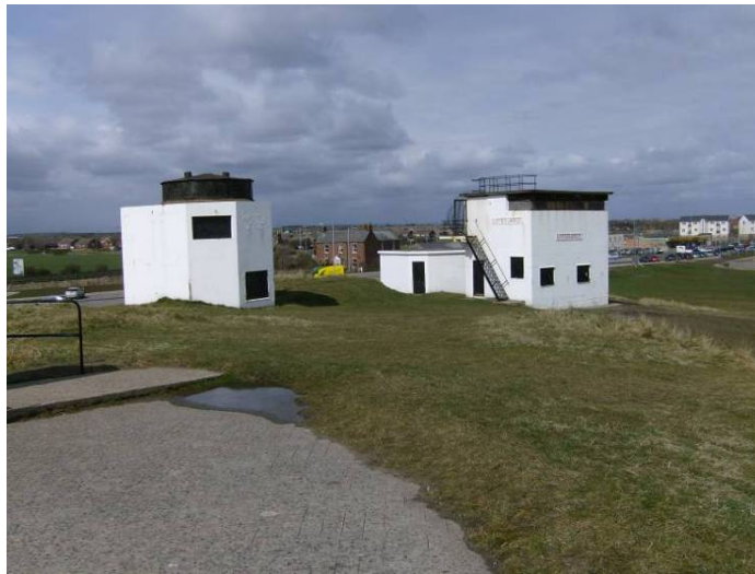
Figure 7.20 Coulson Battery, Blyth; WWI and WWI command posts

A further WWI feature on this section of the coast is the pair of searchlights, formally Defence Electric Light (D.E.L.) emplacements, and their associated engine house at Blyth Links (NZ32057968, NH 11977). The emplacements are well preserved and are constructed of concrete, steel and brick. They are semi-octagonal in plan and have a curving projection on the seaward side provided with shutters which were drawn back when the light was exposed. The searchlight emplacements are Scheduled Ancient Monuments while the engine