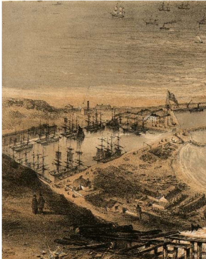
Figure 7.7 Thomas Meik's 1849 illustration of North Dock, Sunderland

The harbour works at the mouth of the River Wear date from the C18 and C19. The South Pier (NZ410582,T&W 2867) was built between 1726 and 1759 and the North Pier (NZ410583,T&W 2715) added between 1788 and 1802, though both were modified and extended between 1804 and 1842 and the South Pier was demolished in 1982. The North Dock (NZ406584, T&W 2717) was built between 1834 and 1837 to a design by Isambard Kingdom Brunel. It had an area of 2.5ha (6 acres) and a 0.6ha (1.5 acres) tidal basin. It is regarded a significant structure by one of the greatest engineers of the C19 (C orfe 1983, 18) and its remains are a Grade II Listed Building. An illustration of 1849 by Thomas Meik shows the North Dock full of ships.