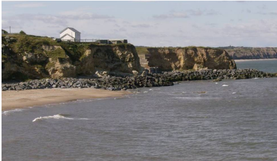
Figure 7.1 Rock armour at the base of cliffs north of Seaham