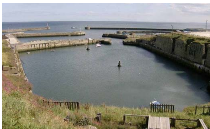
Figure 7.6 Seaham Harbour, County Durham

Seaham Harbour was founded by the Marquess of Londonderry in 1828 as an outlet for coal from his collieries. The harbour was planned by William Chapman and at first consisted of what survives today as the Inner Harbour (NZ43504947, Durham 12602) and is a Grade II Listed Building. The exploitation of coastal coal reserves from the mid C19 led to the major expansion of Seaham Harbour between 1898 and 1905.