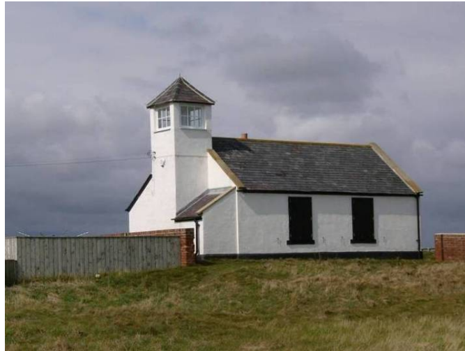
Figure 7.17 The Seaton Sluice Volunteer Life Brigade Watch House

The Watch House at Seaton Sluice (NZ38366862, NH 13976) is situated on the headland known as Rocky Island. It is a brick built structure dating from 1880. Like the others mentioned above, it is a Grade II Listed Building. The Watch House is supplemented by a timber lookout built on the cliff edge in 1925.