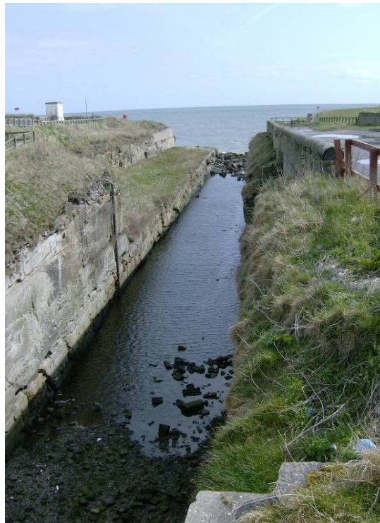
Figure 7.9 The rock-cut, artificial harbour at Seaton Sluice