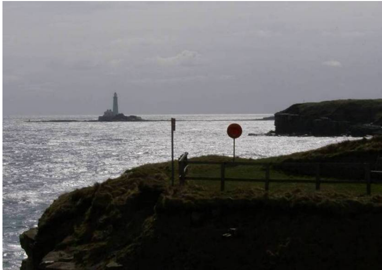
Figure 7.13 St Mary's Island and Lighthouse (author)