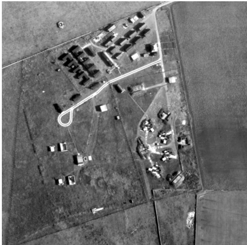
Figure 7.21a Lizard Farm Heavy Anti-Aircraft Battery (NMR 1403288) (RAF 540/1381 F21 0213 07-AUG-1954)

The Lizard Farm heavy anti-aircraft battery (NZ40066368, T&W 1795) is a complex site similar to the one at Ryhope and has also been transcribed by the APTE (NMR 1403288). It is of the standard, 'clover-leaf' pattern with four octagonal emplacements for 4.5 inch guns arranged in an arc to the east of the command post. However, unlike Ryhope, Lizard Farm also has two rectangular emplacements for 3.7 inch guns similar to those noted at Southwick and implying the modification of the battery during the course of the war. Other facilities noted include ammunition stores and accommodation for the gun crews.