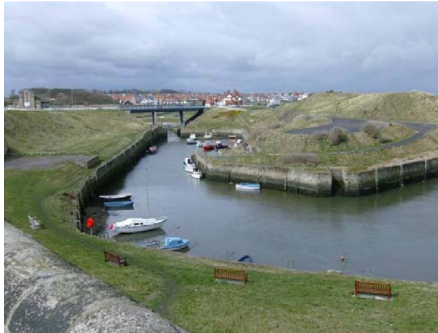
Figure 7.8 Seaton Sluice harbour; the sluice is below the road bridge (author)