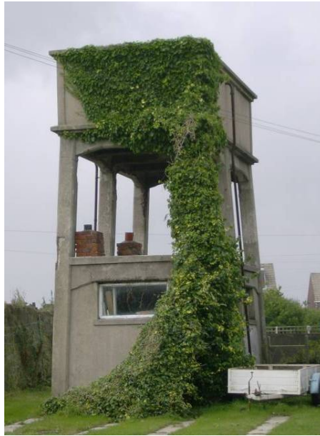
Figure 7.18 The water tower at Robert's Battery, a Grade II* Listed Building (author)

aerial photographs as a circular feature about 17m in diameter. The site has been cleared but it is reported that access to some of the underground facilities can be gained from the cliff face, 70m to the east. Some of the ancillary structures survive and include the command post and officers accommodation, now Fort House, a water tower and a combined latrine and pillbox inserted in the perimeter wall. The remains of Roberts Battery are a Grade II* Listed Building.