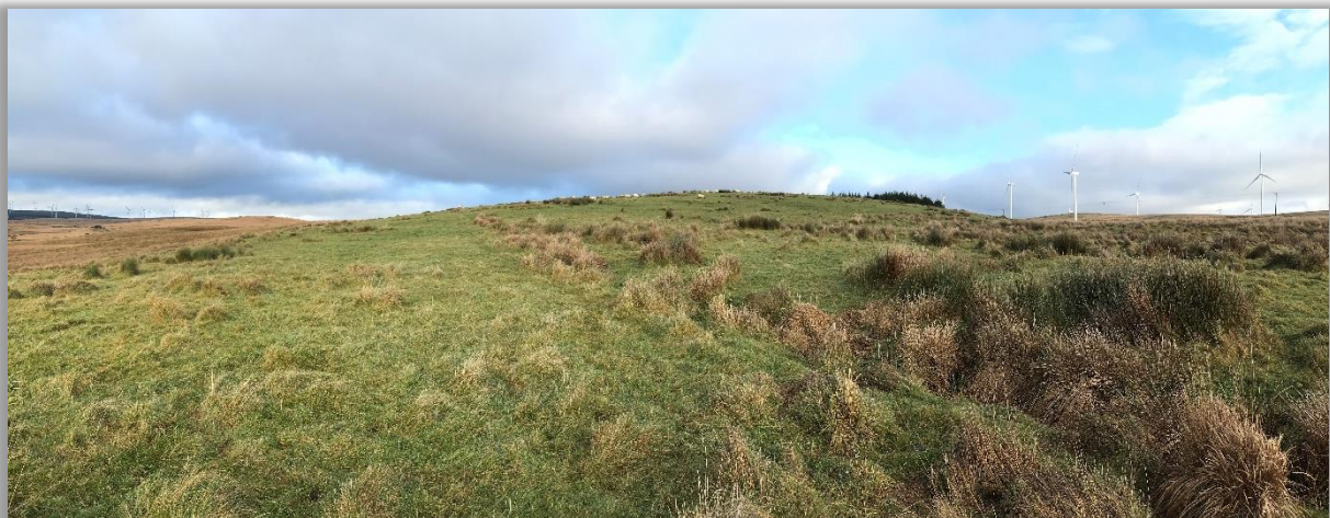
The 'Drumdown' hillock encompassing the Miltonise Cairnfield, looking north.

In December 2020, a colleague and I undertook an archaeological walkover survey on a site at Drumdown, south of Barrhill in South Ayrshire, Scotland. The survey was required ahead of the installation of a temporary access road, to enable scour protection operations to be undertaken on a railway bridge which runs to the west of the site. Following consultation between Network Rail and the Planning Archaeologist for Dumfries and Galloway County Council, Andrew Nicholson, it became apparent that the proposed route lay within the regionally significant East Rhins Archaeological Sensitive Area and passed through the Prehistoric 'Miltonise' Cairnfield (HER ref. MDG1886).