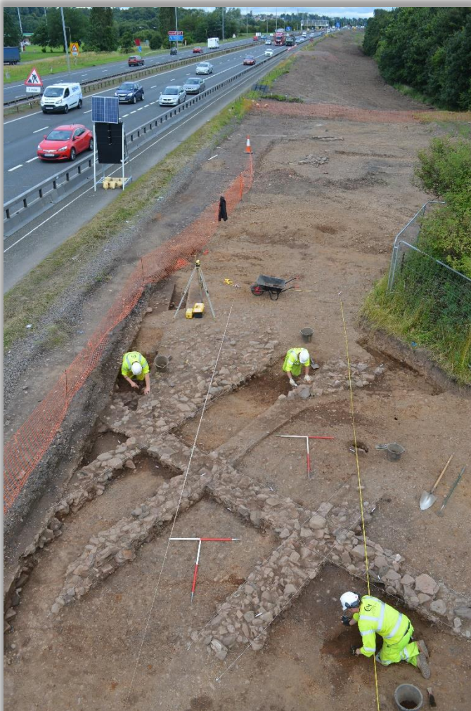
Overhead view of one of the Netherton structures during excavation

Scotland over this period but one of the buildings contained an unusual deposit of artefacts within a foundation level. Amongst the more recognisable occupation debris of green glaze pottery sherds was a collection of objects not found elsewhere across the site. This included a whetstone of fine-grained sandstone, a spindle whorl made of cannel coal, a possible gaming piece or counter crafted from a sherd of green glaze pottery, and two 17 th century coins. The final artefact was an iron dagger, possibly prehistoric in origin. The practice of depositing 'special' objects in medieval and post-medieval buildings is well documented and was intended to protect the building and its inhabitants. Alas, it did not seem to work. The village of Netherton was swept away in the 18 th century by improvements to the estate by the Dukes of Hamilton, transforming the site into well-ordered and symmetrical parkland. And then later came the motorway, which subsumed most of the village; the four structures encountered during GUARD Archaeology's excavation