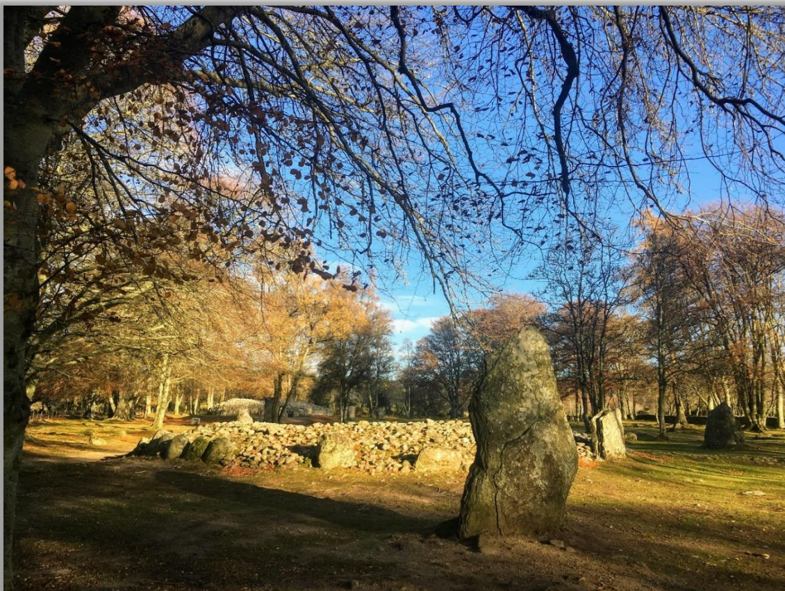
The Clava Cairns at Balnuaran of Clava, near Inverness form part of a distinct regional burial tradition – discussed in a new HighARF case study!

The Highland Archaeological Research Framework ( HighARF ) has entered its final phase and is on-track to be completed and made available on the ScARF website this summer! Do you have an interest in the archaeology of the Highlands? Do not miss out on your last chance to comment on these draft chapters – are there key examples missing? Can you spot research gaps? You are invited to read and comment on the following chapters: Palaeolithic and Mesolithic, Neolithic,