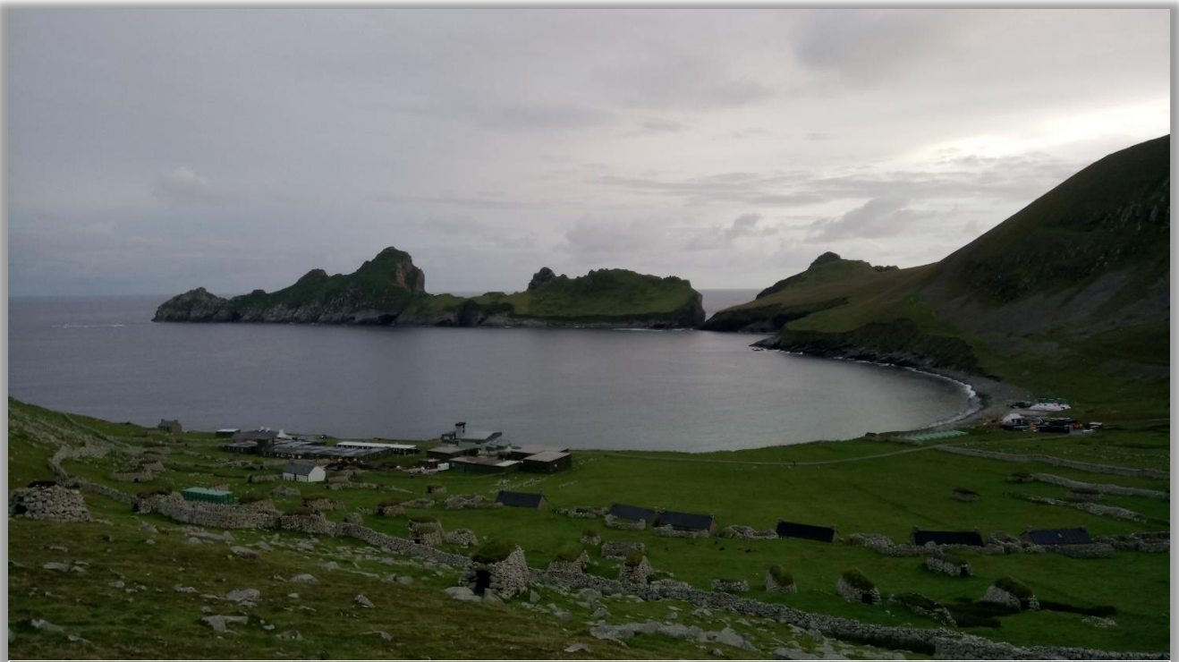
General view of the St Kilda site

Moving to the opposite end of Scotland, excavation and analyses by Murray Archaeological Services Ltd revealed a site in Aberdeenshire intermittently visited during the Mesolithic. In the early Neolithic the site was revisited, and post-pits are interpreted as an ephemeral structure, with hearths and a knapping area suggesting sporadic Neolithic use of the site over several hundred years. Bayesian analysis suggests that while the activity around one hearth may date to around the time of the building of the nearby timber halls at Warren Field and Balbridie, the post-