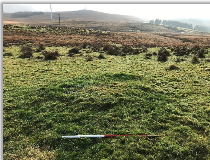
A cairn presenting as a mound containing buried stones in the Miltonise Cairnfield, looking east

The project began with a walkover survey in late December 2020 to record and photograph archaeological assets within the cairnfield which could be potentially affected by the temporary access route. The proposed route was systematically walked in a grid-like fashion to identify any exposed, partially exposed and/or buried heritage assets. The survey revealed 23 visible and buried heritage assets comprising of cairn stones and mounds within the proposed route, as well as outside of the route, particularly to the south and east.