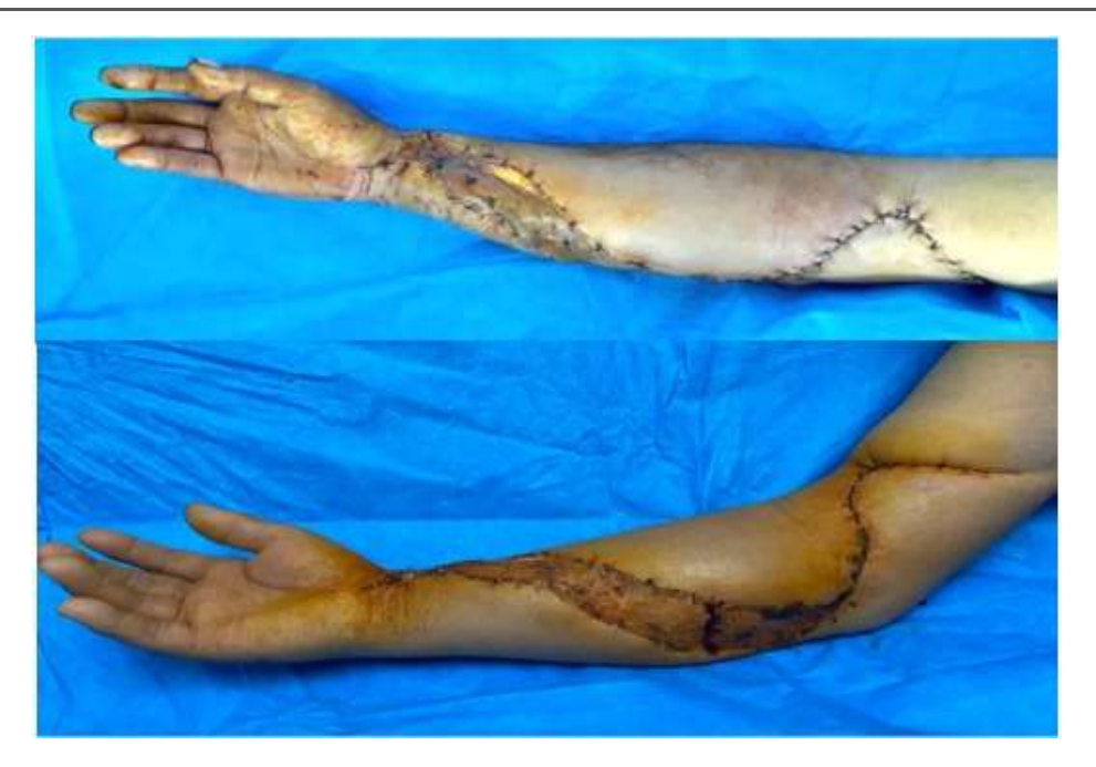
Figure 4. Postoperative photograph at 7 days, with adequate integration of the grafts, with proximal primary closure