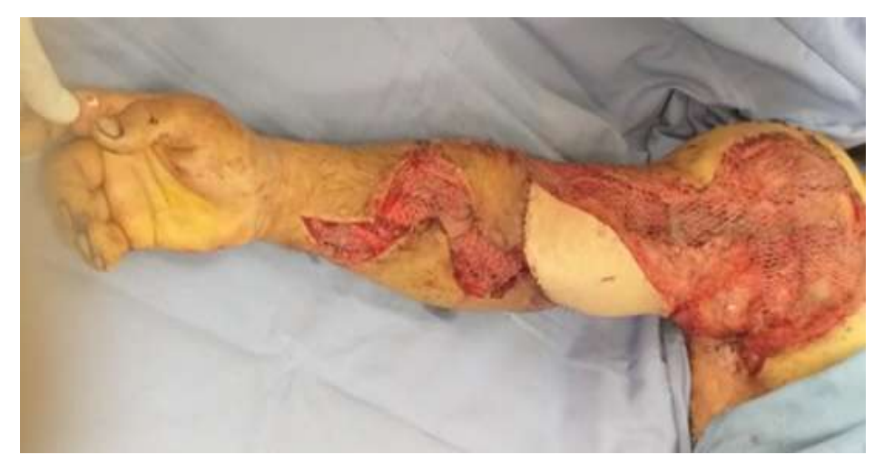
Figure9. Result. Latissimus dorsi musculocutaneous flap with cutaneous cover for anastomosis, collection, and application of intermediate partial thickness skin graft to cover the fasciotomy and bloody area