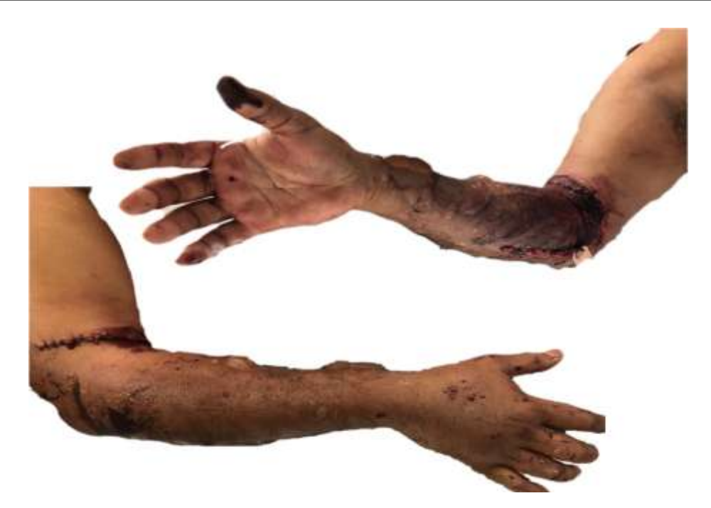
Figure6. Ampoules are observed at the level of the arm and forearm, fasciotomies were not performed in this case