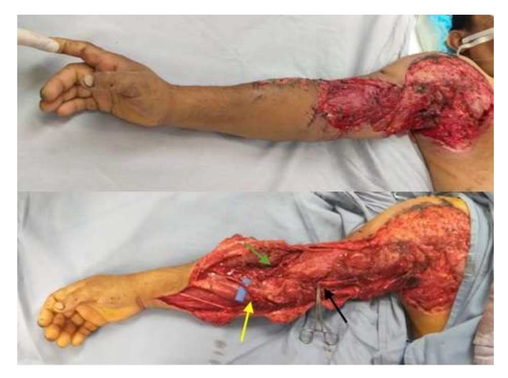
Figure 8. a) Upper: saphenous vein graft; lower: sural nerve graft. b ) Anastomosis of the saphenous vein with the brachial artery at its distal and proximal end. c ) Adequate venous graft perfusion. d ) Sural nerve graft for the posterior interosseous nerve (green arrow). Vein graft coverage (black arrow) is observed by the latissimus dorsi muscle flap (blue arrow).

absence of a 15 cm segment of the brachial artery is observed, taking a saphenous vein graft from the left leg, taking a sural nerve graft for the posterior interosseous nerve (Figure 8); latissimus dorsi muscle flap (figure 9) to cover the bloody area, a prophylactic fasciotomy was performed on the forearm with application of a skin graft.