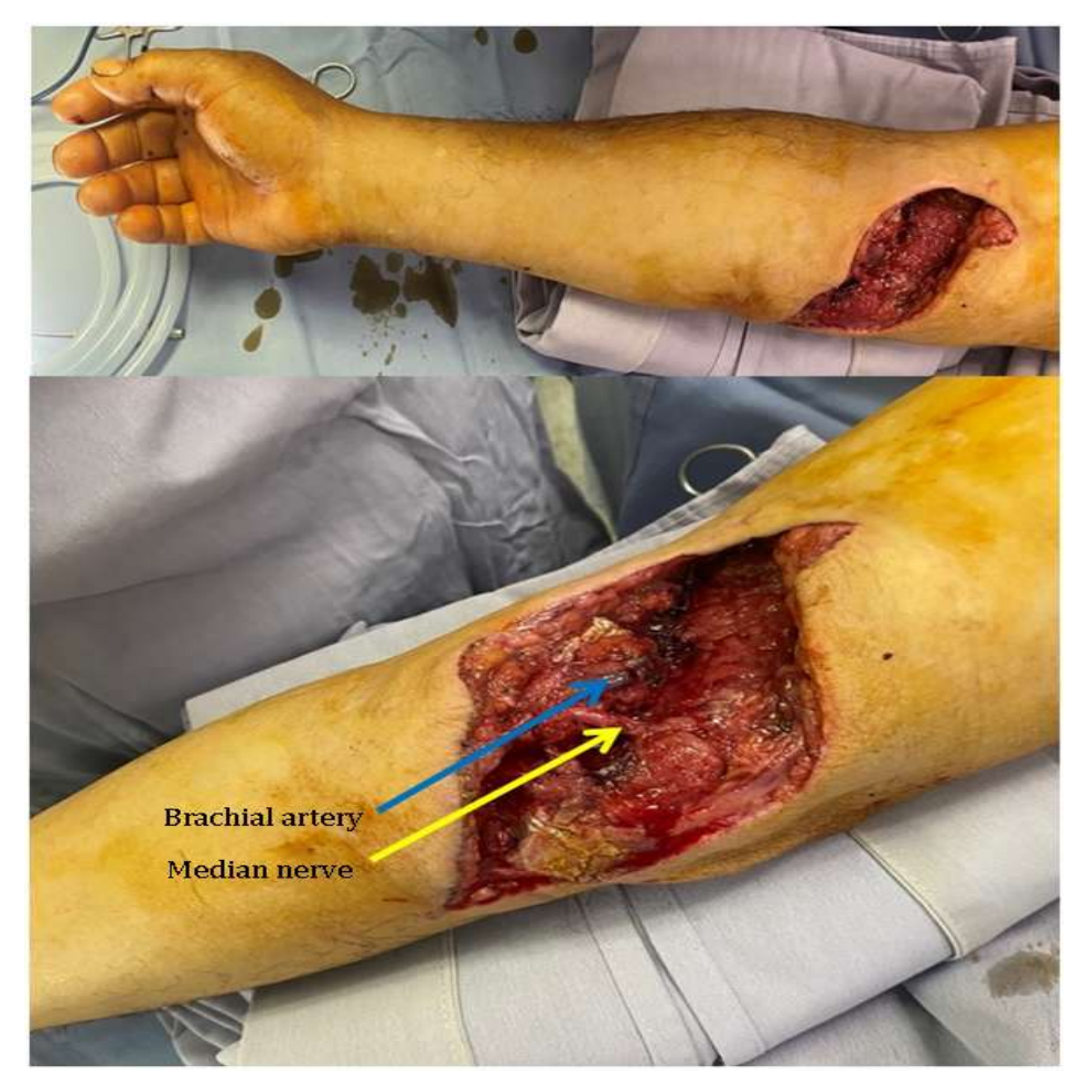
Figure2. Injury at the level of the elbow fold with section of the brachial biceps, brachial artery (blue arrow) and median nerve (yellow arrow)