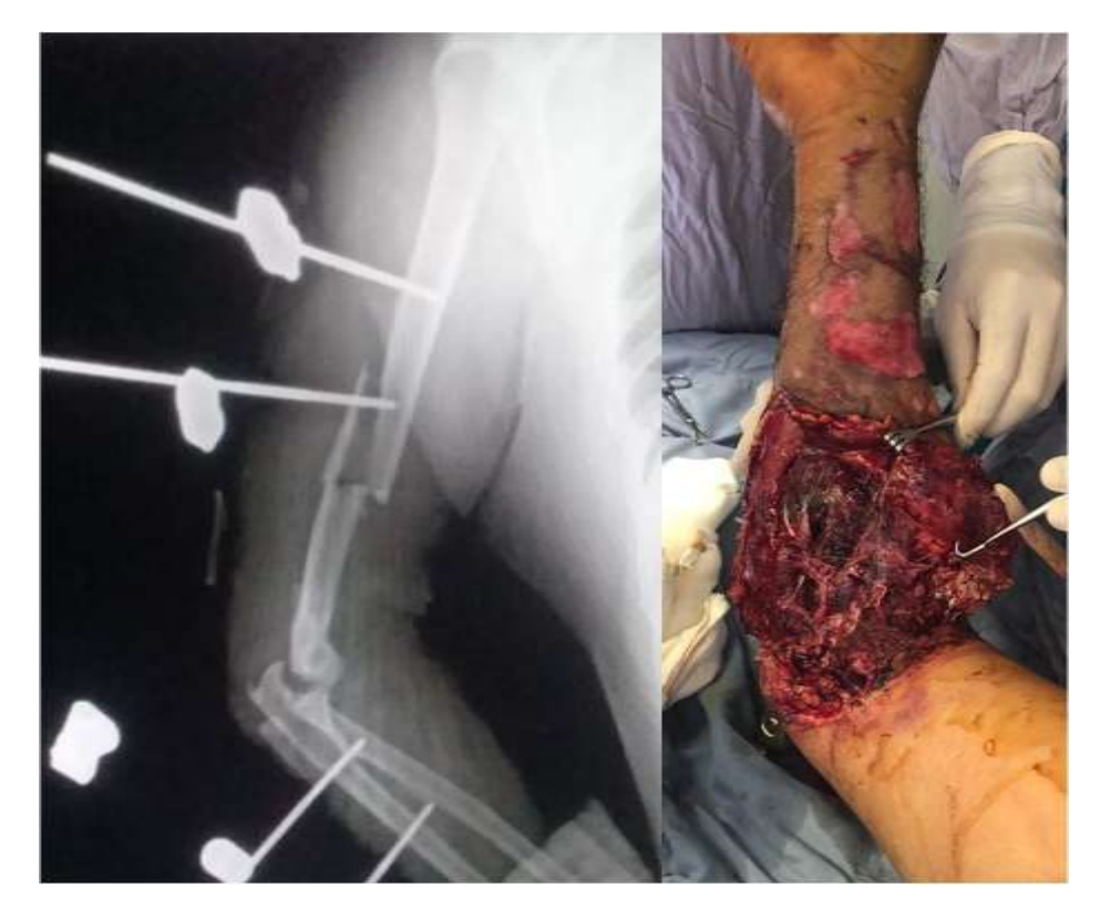
Figure 5. Injury on the anteromedial surface of the arm and forearm with humerus fracture

secondary to the patency of the recurrent and collateral arteries, for which an anastomosis of the brachial artery with a cephalic vein graft was performed. However, he presented bullae on the back of the arm (Figure 6). Because of elevation of creatinine phosphokinase (CPK) up to 22,000 and lack of muscle contraction under direct stimulation in all compartments it was decided to limb amputation.