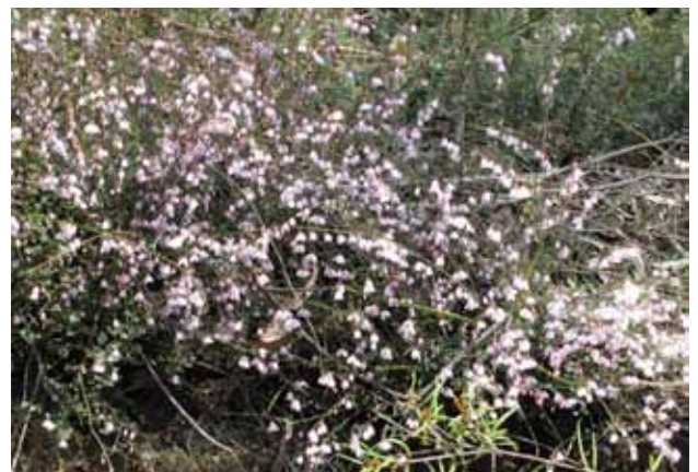
Figure 36. Tetratheca stenocarpa in flower, Bunyip fire area, 15/9/2011.