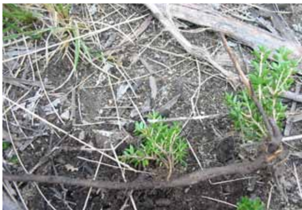
Figure 39. Trochocarpa clarkei resprouting, Mt Bullfight, 25/2/2011.