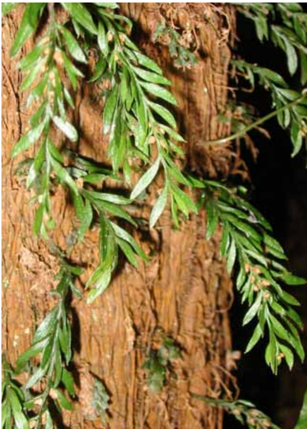
Figure 38. Tmesipteris parva , Chinamans Creek, Wilsons Promontory, 22/2/2011.

A second epiphytic population of 10 plants was found nearby on Cyathea australis . Vegetation here included Syzygium smithii and Acacia melanoxydon over Dicksonia antarctica , Cyathea australis , Fieldia australis , Blechnum wattsi , Microsorium sp, Olearia argophylla and Bedfordia arborescens .