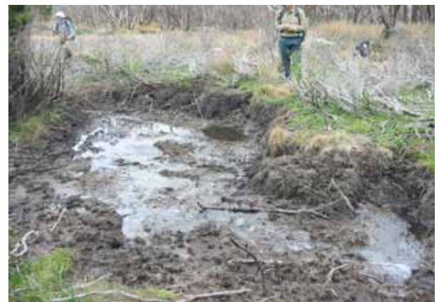
Figure 43. Sambar wallow in burnt sub-alpine bog at Mt Bullfight.

The effects of browsing, presumably by Sambar but possibly also by rabbits and hares, were observed at several locations. Carex blakei and Oreobolus oxycarpus subsp. oxycarpus were being browsed at Mt Bullfight; Pultenaea weindorferi , Persoonia arborea and Leionema bilobum subsp. serrulatum were being browsed in the Bunyip fire area; and some Acacia leprosa var. graveolens showed signs of stem damage in Kinglake National Park Muddy wallows from deer activity were found at Mt Bullfight (Figure 43), and these were somewhat larger than generally encountered by the authors in high-altitude wetlands. Water bodies are important to Sambar (Flynn et al. 1990), and the concentrated deer activity observed at Mt Bullfight is probably due to a combination of high deer numbers and the low number of wetlands there.