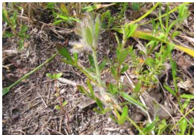
Figure 41. Xanthosia tasmanica at Wilsons Promontory, 26/10/2010.