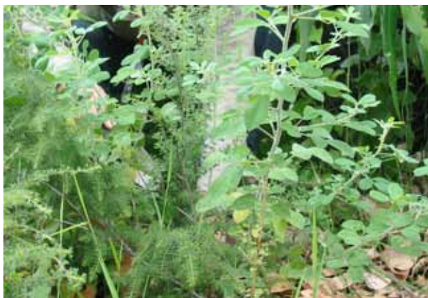
Figure 19. Goodia pubescens , Kinglake National Park, 10/10/2011