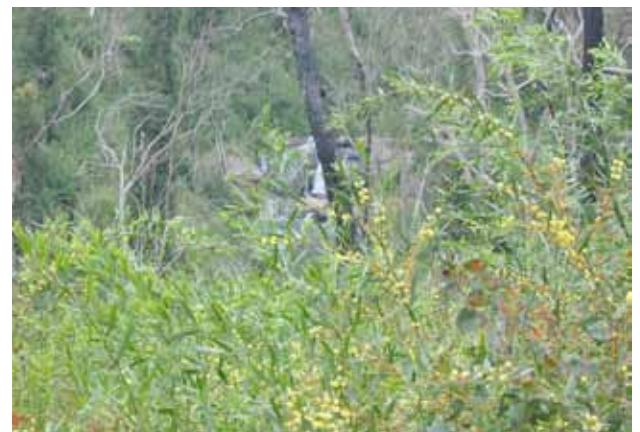
Figure 4. Acacia leprosa var. uninervia , Masons Falls, Kinglake National Park, 12/9/2011.

This species was also found in large numbers along other tracks in the park with drier vegetation, including Eucalyptus macrorhyncha over Gonocarpus tetragynus , Opercularia varia , Rhytidosporum procumbens , Lomandra filiformis , Dillwynia phylloides , Correa reflexa , Lomatia ilicifolia , Dianella revoluta and Spyridium parvifolium .