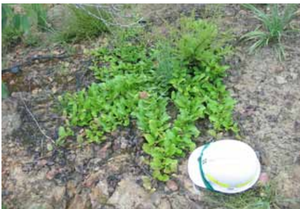
Figure 23. Grevillea repens , Kinglake National Park, 11/1/2011

Resprout and seed. Some larger plants (Figure 23) appear to have resprouted from below ground at the base of the stem, while some smaller plants appeared to be seedlings. No plants were observed flowering within two years of the fire, but they were in bud by September 2011.