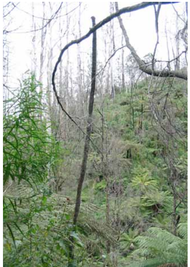
Figure 9. Dead Cyathea cunninghamii trunk, Traralgon Creek Flora Reserve, 27/9/2011.