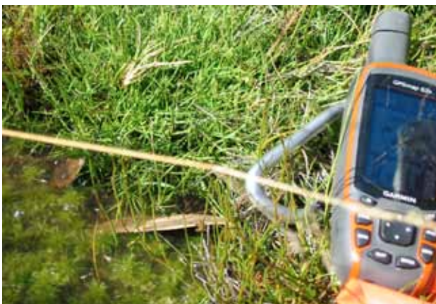
Figure 29. Oreobolus oxycarpus subsp. oxycarpus , Mount Bullfight, 25/2/2011.