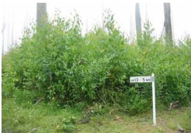
Figure 37. Thismia rodwayi location, Wallaby Creek Catchment, Kinglake, 10/1/2011.