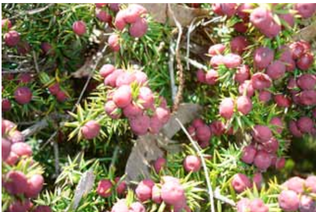
Figure 28. Leptecophylla juniperina subsp. oxycedrus at Wilsons Promontory. Photo by Liz Zetzmann, 21/11/2008.