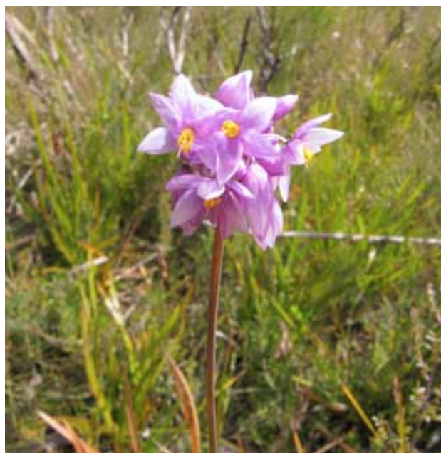
Figure 35. Sowerbaea juncea at Wilsons Promontory, 27/10/2010.

Other species present depending on location included Helichrysum baxteri , Tetratheca pilosa , Laxmannia sp., Lindsaea linearis , Empodisma minus , Selaginella uliginosa , Acrotiche serrulata , Lepidosperma laterale , Gonocarpus tetragynus , Leucopogon virgatus , Xanthosia tridentata and Comesperma ericinum .