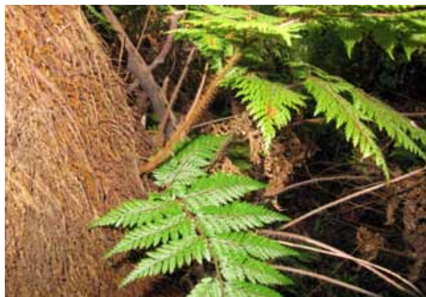
Figure 26. Lastreopsis hispida on tree fern, Bunyip State Park, 19/10/2010.