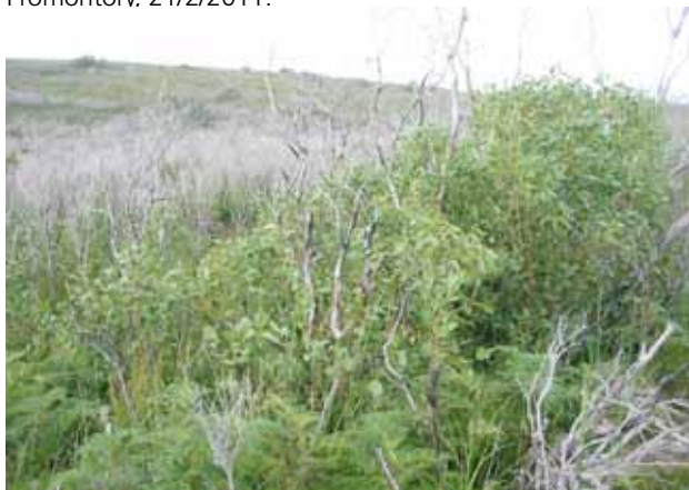
Figure 15. Eucalyptus kitsoniana resprouting at Wilsons Promontory, 21/2/2011.