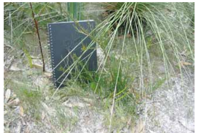
Figure 6. Allocasuarina media , Wilsons Promontory, 26/10/2010.