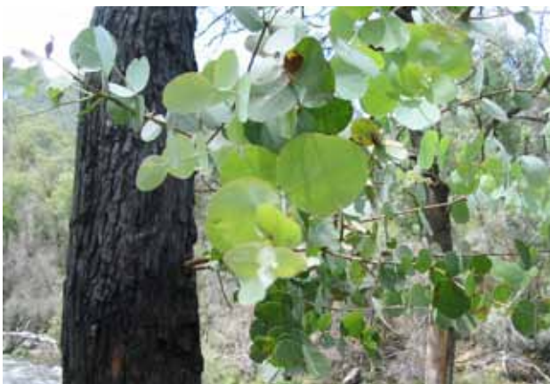
Figure 13. Coppice on trunk of Eucalyptus alligatrix subsp. alligatrix beside Big River, 21/1/2011.

This species appeared to be resilient to fire, as it was regenerating both from seed and vegetatively (Figure 13). Seedlings were observed to 2.5 m high, although they were not abundant, probably reflecting the sparse number of adults. Mature plants survived the fire and were coppicing along the trunk and lower branches to a height of around 15 m, depending on scorch height. One burnt juvenile with a DBH of ~2.5 cm was observed to be resprouting from near the base.