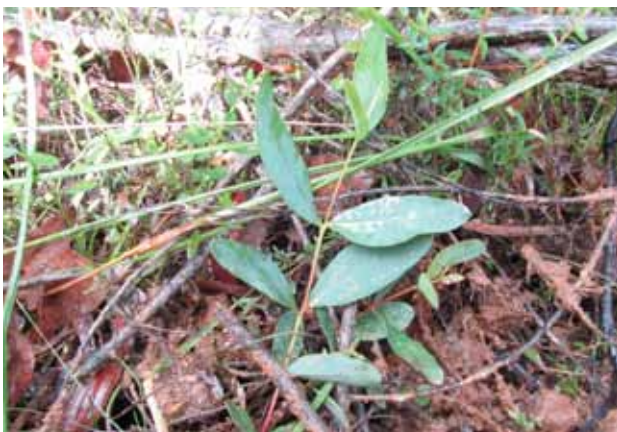
Figure 14. Eucalyptus fulgens seedling at Kinglake, 24/5/2011.

Regenerating by seed (Figure 14) and vegetatively. Adults survived the fire and displayed epicormic resprouting from trunks and larger branches depending on flame height. No fruit or buds were observed on epicormic growth. Some saplings also appeared to have survived, with one appearing to be recoppicing after being knocked over by roadside mowing. A small number of seedlings was found, most in open areas away from canopy shade, and these were up to 30 cm high two years post-fire.