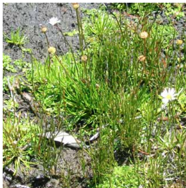
Figure 8. Brachyscome obovata , Lake Mountain, 19/1/2011.