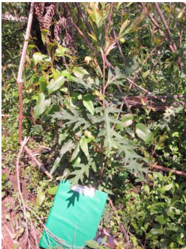
Figure 20. Grevillea barklyana , Bunyip State Park, 19/10/2010.

Surrounding vegetation generally consisted of Eucalyptus sieberi and Eucalyptus obliqua (sometimes Eucalyptus regnans ) over Goodenia ovata , Scaevola aemula , Pultenaea forsythiana , Lepidosperma laterale , Dampiera stricta , Acacia falciformis and Pteridium esculentum . Gahnia radula , Tetrarrhena juncea , Correa reflexa and Spyridium parvifolium were also common at some sites. Dense Eucalyptus sieberi regeneration to ~2.5 m high was present at some sites.