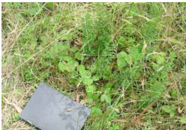
Figure 32. Pomaderris helianthemifolia subsp. minor , Still Creek, potentially threatened by Blackberry, 21/1/2011.