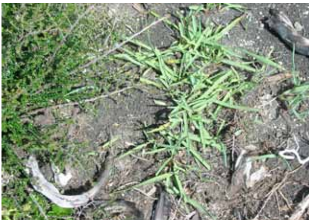
Figure 24. Herpolirion novae-zelandiae , Mount Bullfight, 25/2/2011.