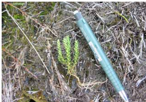
Figure 11. Epacris microphylla var. rhombofolia seedling at Mt Bullfight, 25/2/2011.

Regenerating by seed (Figure 11), and usually in low numbers. Seedlings remained small two years post-fire at only 3–7 cm high, and are likely to remain reproductively immature for some years.