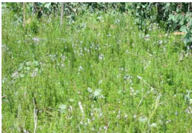
Figure 10. Derwentia nivea , Lake Mountain, 19/1/2011.