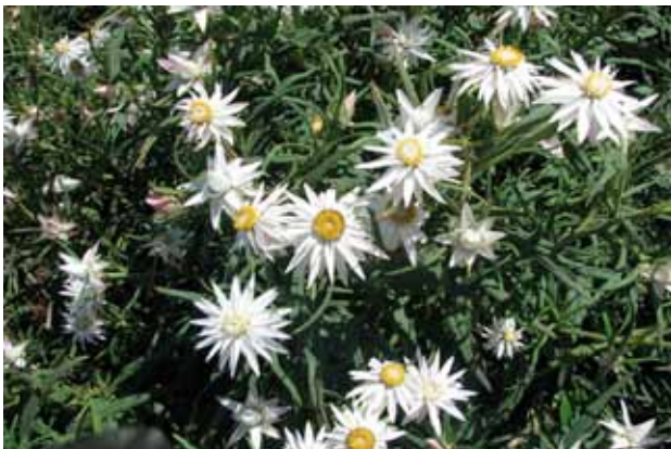
Figure 42. Photograph of Xerochrysum papillosum at Flinders Island – not this study (photo: David Cheal, 24/10/2007)

None at this stage. The presence of this species at Wilsons Promontory is doubtful.