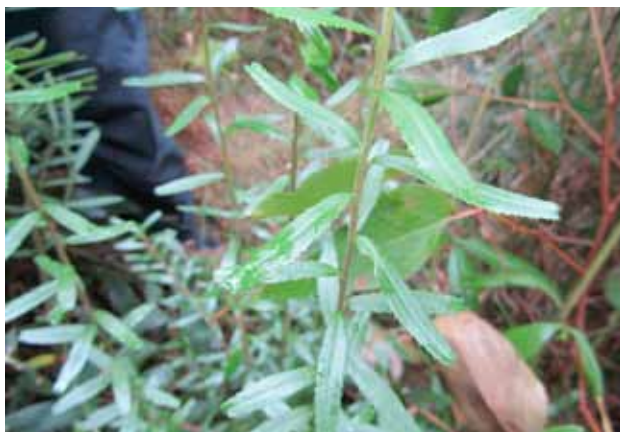
Figure 27. Leionema bilobum subsp. serrulatum , Bunyip State Park, 10/3/2011.

In the O'Shannassy Catchment to the north of the study area, smaller numbers of plants were found, scattered within dense post-fire regrowth. Species differed substantially in the O'Shannassy Catchment, with the overstorey including Eucalyptus nitens , Eucalyptus obliqua or Eucalyptus regnans , with the understorey commonly including Acacia frutescens and Polyscias sambucifolia .