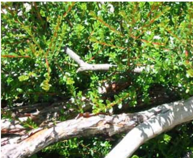
Figure 7. Baeckea latifolia resprouting at Lake Mountain, 19/1/2011.