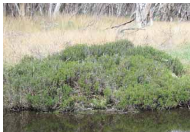
Figure 12. Unburnt Epacris petrophila at Mt Bullfight, 25/2/2011.