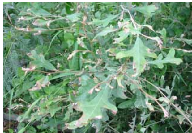
Figure 21. Grevillea barklyana seedlings under stress, Bunyip State Park, 8/3/2011.

By March 2011, many seedlings were showing signs of stress, with discolouration and drying of leaves, particularly at the tips (Figure 21). The reasons for this are unclear, but could include leaf skeletonising caterpillars or a lack of suitable site conditions (for example, poor drainage) (pers. comm., Peter Olde, Grevillea Study Group, Australian Plants Society, Victoria). In any event, given such dense, post-fire regeneration, a large number of seedlings that germinate are not expected to survive to maturity. Phytophthora infection was not tested for but remains a possibility, as some Grevillea species are susceptible to this disease (Peters 1994).