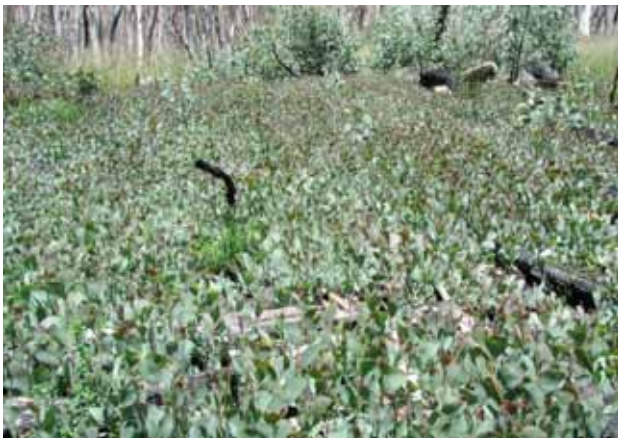
Figure 2. Acacia alpina seedlings at Lake Mountain, 20/1/2011.