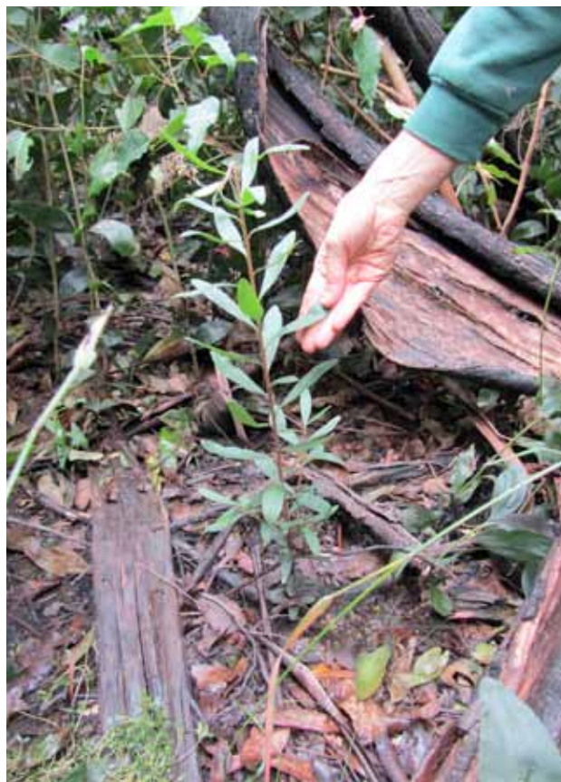
Figure 30. Persoonia arborea seedling in Bunyip fire area, 10/3/2011.

Associated vegetation generally comprised Eucalyptus regnans and/or Eucalyptus obliqua or Eucalyptus sieberi over Acacia obliquinervia , Tetrarrhena juncea and Polyscias sambucifolia . Other locally common species, depending on location, included Pteridium esculentum , Zieria arborescens , Pomaderris aspera , Correa reflexa , Prostanthera lasianthos , Spyridium parvifolium , Lepidosperma elatius , Platylobium formosum and Gahnia sieberiana .