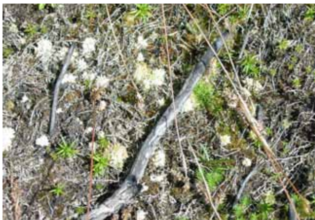
Figure 34. Richea victoriana seedlings, Tom Burns Creek, 21/1/2011.