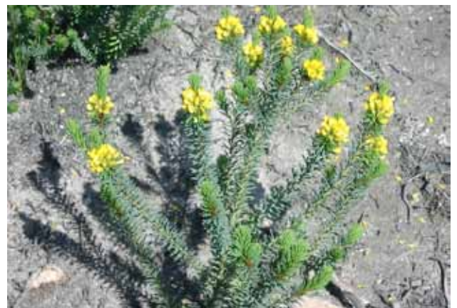
Figure 33. Pultenaea weindorferi , Bunyip State Park, 20/10/2010.

Depending on location, other species that were locally common included Lepidosperma filiforme , Hypolaena fastigiata , Xanthosia dissecta , Baumea sp., Acacia genistifolia , Acacia oxycedrus , Melaleuca squarrosa , Pultenaea gunnii , Leptospermum continentale , Schoenus apogon , Allocasuarina sp., Drosera binata and Lindsaea linearis .