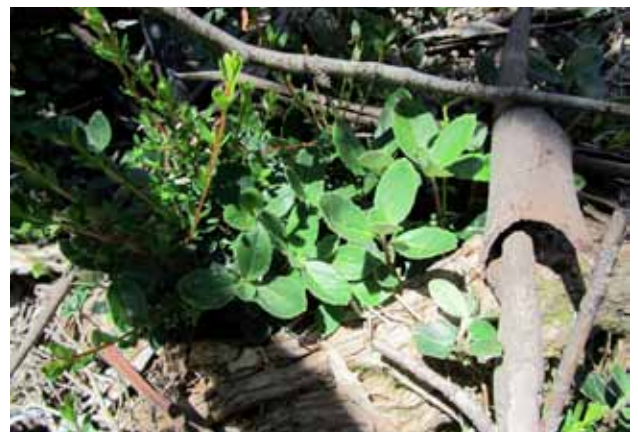
Figure 40. Wittsteinia vacciniacea sprouting at Lake Mountain, 19/1/2011.

Individuals examined were resprouting from rhizomes (Figure 40). Two years post-fire, resprouts were no higher than 15 cm, and showed no sign of flowering.