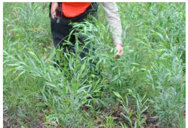
Figure 3. Acacia leprosa var. graveolens , Kinglake National Park, 12/1/2011.

Large new populations of this species were also recorded in the Traralgon South Flora and Fauna Reserve on sandy soils. Associated species included Eucalyptus polyanthemus over Cassinia longifolia , Hydrocotyle laxiflora , Geranium potentilloides , Cymbonotus preissianus , Poa labillardierei , Euchiton collinus , Desmodium spp. and Glycine clandestina .