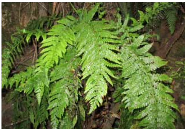
Figure 31. Pneumatopteris pennigera , Moleside Creek, Lower Glenelg National Park, 29/9/2011