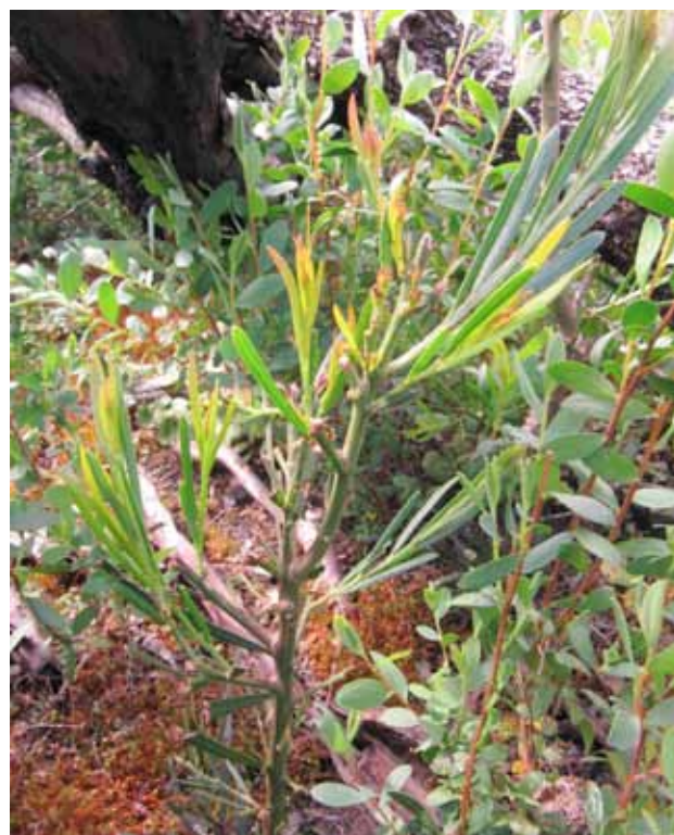
Figure 5. Acacia uncifolia with signs of browsing, Wilsons Promontory National Park, 25/10/2010.

Specimens examined during this survey were regenerating by seed. The seeds germinate in response to moderate to hot temperatures, but the species is also known to resprout from rhizomes (DPIW 2008). Some seedlings were up to 1.2 m high within two years of the fire, but average height was around 50 cm. No flowering material was observed at the time.