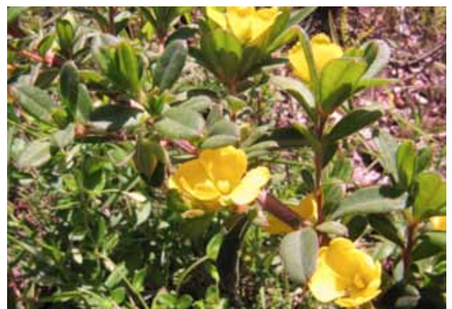
Figure 25. Hibbertia hirticalyx , Wilsons Promontory, 28/10/2010.

Regenerating by resprout and seed. Clearly identified basal resprouts, resprouting from just below the surface, were up to ~ 120 cm high within two years of fire. Larger individuals were flowering (Figure 25). There was also a mix of smaller seedlings and root resprouts (the majority appeared to be resprouts, but it was difficult to confirm ratios without undue destruction), to 50 cm high, typically 10–20 cm. Some of these were also flowering.