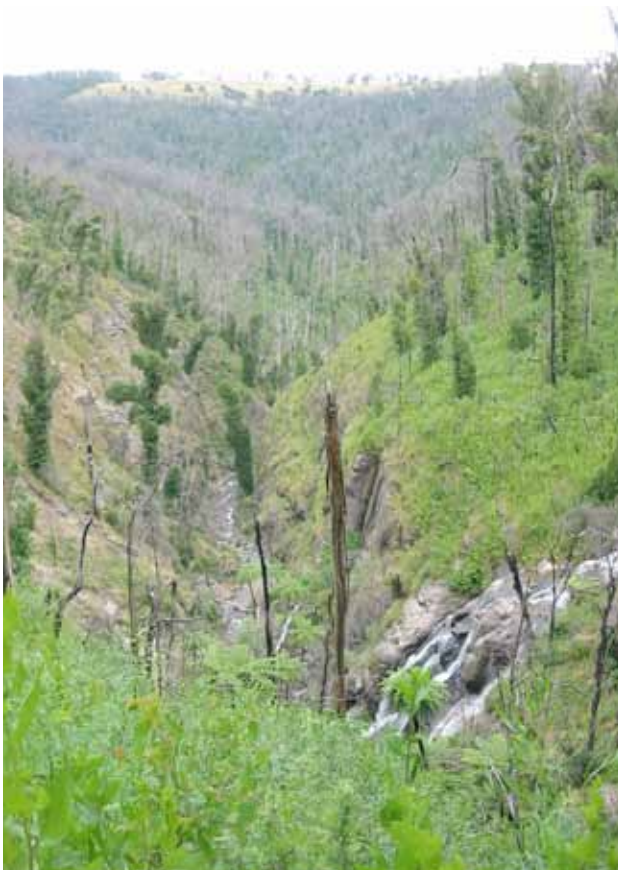
Figure 17. Recorded habitat of Euchiton umbricola , Kinglake National Park, 17/1/2011