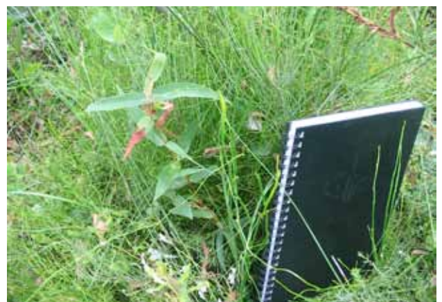
Figure 16. Eucalyptus willisii supsp. willisii seedling at Wilsons Promontory, 21/2/2011.