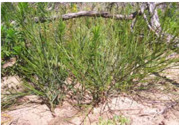
Figure 18. Resprouting Exocarpos syrticola , Wilsons Promontory, 28/10/2010.