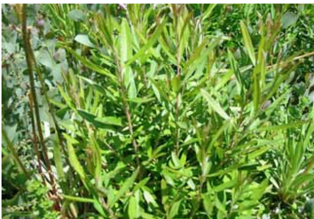
Figure 22. Grevillea monslacana seedlings, Lake Mountain, 20/1/2011.