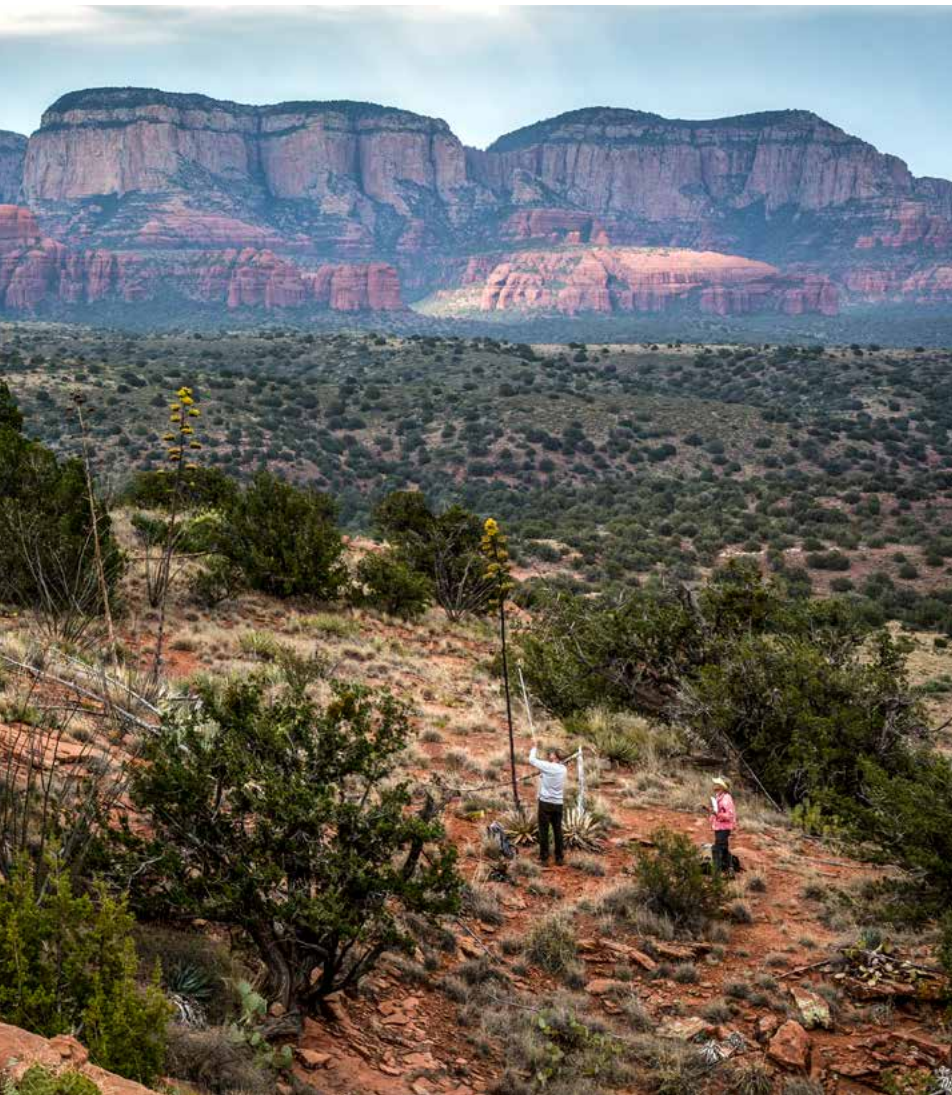
Andrew Salywon and Wendy Hodgson collect specimens from the stalk of a mystery hybrid agave species near an archaeological site south of Sedona.