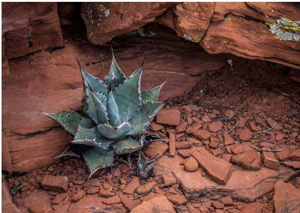
LEFT: Parry's agaves ( Agave parryi ) thrive near an archaeological site. While not a domesticated species, Parry's agaves were among the native agaves cultivated by Arizona's early inhabitants.