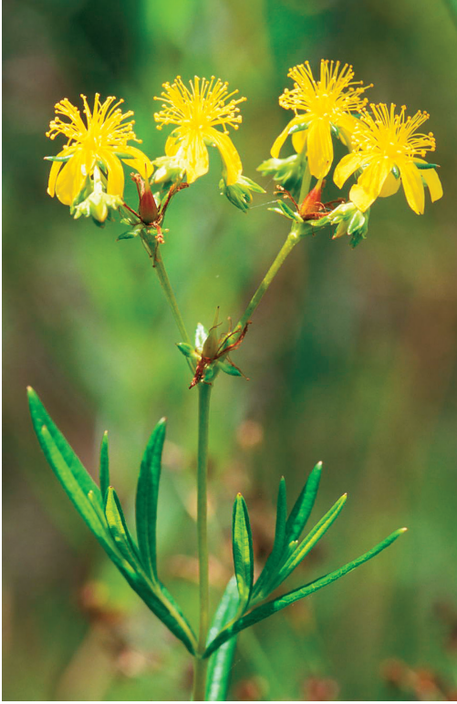
FIG. 1. Hypericum adpressum . Saline County, Arkansas. Note revolute leaf margins. 20 June 2006.