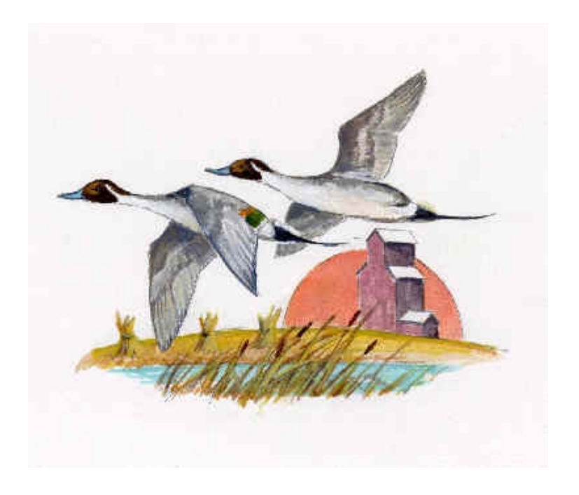
Elegant male northern pintails fly over a backdrop of cattails, wetland, wheat field, grain elevator and rising sun, all hallmarks of the Canadian prairies...