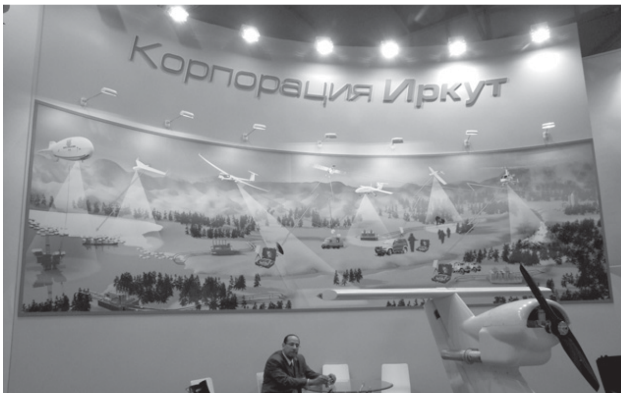
The backdrop of Irkut Corporation's booth, which was on display during the International Defense Exhibition of Land Forces this year, depicts Irkut aerial reconnaissance systems, including the Irkut-850 (the third aircraft pictured from left) linked to various ground control stations.

In a book titled At the Abyss: An Insider's History of the Cold War , author Thomas C. Reed explained that the United States was intent on preventing Western Europe from importing Soviet natural gas. In addition, the Soviet Union was thought to be trying to steal a wide variety of Western technology. In his memoirs, Reed, a former Air Force secretary who served in the National Security Council during the Reagan administration, admitted that the president had approved a CIA plan to covertly transfer technology containing hidden malfunctions that triggered a huge explosion in a Siberian natural gas pipeline. The explosion, which occurred during the summer of 1982, was an effort to sabotage the Soviet Union's economy. According to Reed, the explosion was picked up on U.S. satellites and "was the most monumental non-nuclear explosion and fire ever seen from space." 42 Some experts believe that the explosion did indeed lead to the ultimate collapse of the Soviet Union.