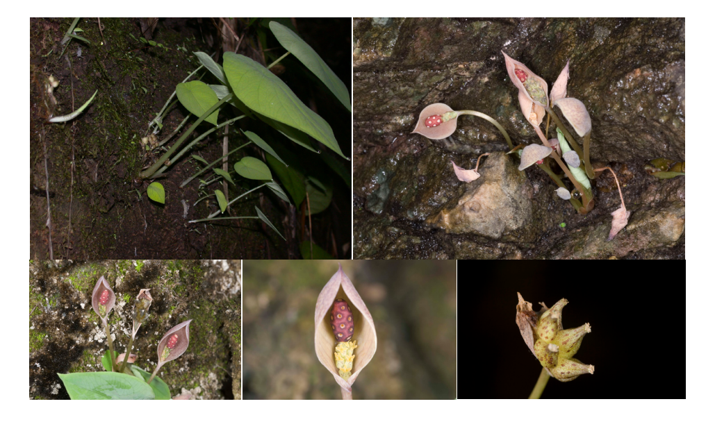
Figure 2. Ariopsis protanthera: Plants in habitat in Nong Khai.

ARIOPSIS (ARACEAE: COLOCASIEAE) A NEW GENERIC RECORD FOR THAILAND & PRELIMINARY OBSERVATIONS 13 ON TRANS-HIMALAYAN BIOGEOGRAPHY IN ARACEAE (P.C. BOYCE)