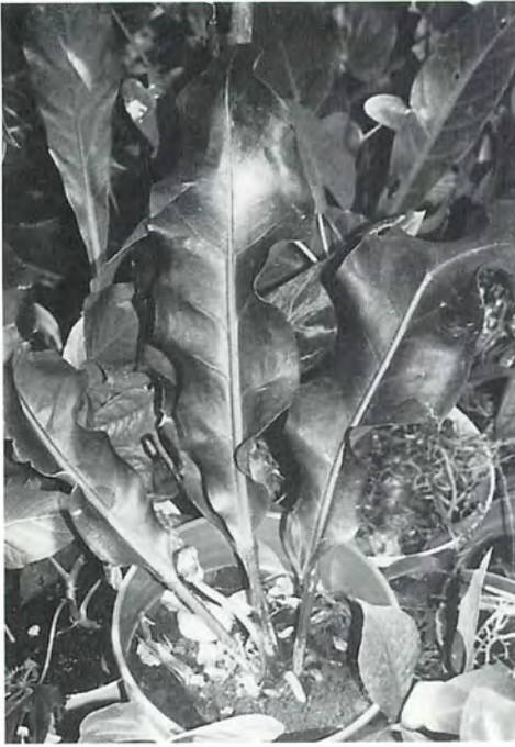
Fig. 2. Whole plant showing growth habit.