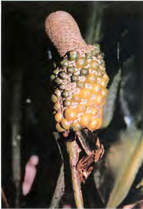
Fig. 5. Inflorescence with yellowish orange berries.

mm from the margin. Inflorescence shorter than the leaves; peduncle 14–15 cm long, 4–6 mm diam., terete to weakly sulcate; spathe reddish to purple with yellowish punctations, 3–3.5 cm long, 1.5–3 cm wide, rounded to retuse at apex, inserted at a 70° angle on peduncle; spadix clavate, brownish, 3–7.5 cm long, 5–7 mm diam. at base, 8 mm diam at apex; flowers square, 1–1.5 mm diam. in both directions, the sides straight to weakly curved. Inflorescence arcuate with spathe green, persistent, to 8 cm long, 3.5 cm diam.; berries yellowish orange, globose to elliptic, 8–11 mm long, pericarp thin, mesocarp pulpy, yellowish; seeds 2–3, pale yellow, 6–7 mm long, 4–4.5 mm wide, elliptic to lanceolate.