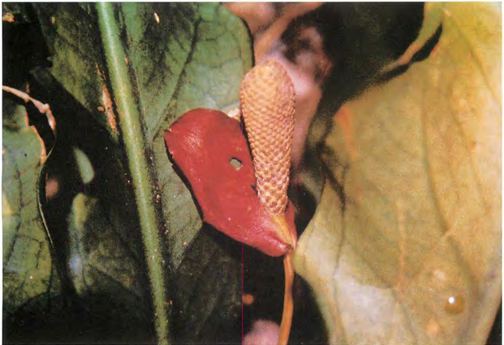
Fig. 4. Inflorescence showing clavate spadix and reddish spathe.