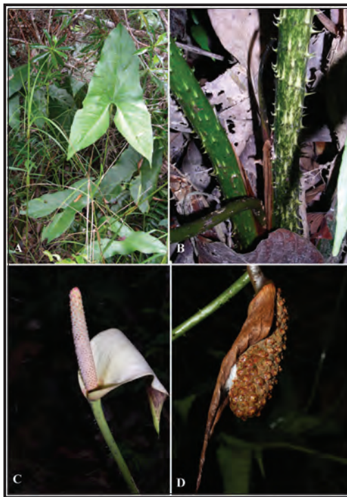
Figure 7: Cyrtosperma ferox N.E.Br. A. Young plant showing the distinctive leaves. B. Detail of the petiole bases with their distinctive ascending prickles. C. Inflorescence at pistillate anthesis. Note the conspicuous stigma droplets. D. Mature infructescence. The nodding posture, marcescent-persistent spathe, and fruits barely emerging from the surrounding tepals are diagnostic in Borneo.

Occasionally, much more heavily armed smaller plants with spreading leaves are encountered in wet areas in forest, often along water courses, and these equate to C. ferox N.E.Br. The most recent revision (Hay, 1988) merges C. ferox and C. merkusii , although in Sarawak at least they are consistently distinct in terms of morphology and ecology (Boyce et al. , 2010).