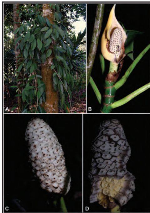
Figure 13: Rhaphidophora lobbii Schott. A. Adult plant. B. Solitary inflorescence, subtended by a fully developed foliage leaf, spathe ovate-elliptic, stoutly long-beaked, and thickly fleshy. C. Cylindrical spadix. D. Infructescence ripening dirty white, stylar plates sloughing away to reveal amber coloured pulp and pale grey seeds.

Notes. — A distinctive climber by the combination of the slender, asperous stems and softly leathery leaves, and minutely pubescent spathe exterior. Dry material is remarkable by the strongly discoloured leaves, and primary veins prominently darker than the abaxial leaf surface.