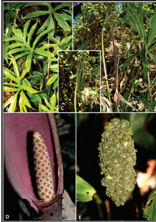
Figure 10: Lasia spinosa (L.) Thwaites. A. Flowering plant. B. The greatly attenuated spathe limb opening only at the base. C. Young emerging leaf lamina. D. Inflorescence. E. Ripe infructescence. Note the spinulose berries.

14. Podolasia stipitata N.E.Br., Gard. Chron., ser.2, 18: 70. 1882; Hay, Blumea 33: 463–465, Fig.17(1988).