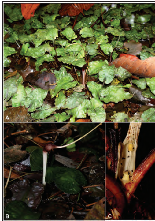
Figure 6: Cryptocoryne longicauda Becc. ex Engl. A. In its natural habitat at Mulu National Park. B. Spathe long pedicellate C. Spathe artificially removed to reveal the spadix.

Ecology. — Forming large stands in more or less slow running rivers, or in lowland forest pools, mostly in deep mud. In small forest streams, the plants can form luxurious growths that cover the whole bottom and sides while, in forest pools, the specimens are smaller and more scattered (Jacobsen, 1985).