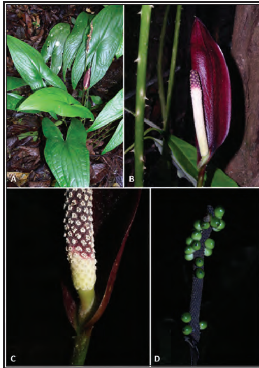
Figure 11: Podolasia stipitata N.E.Br. A. Flowering and fruiting plant in habitat. B. Inflorescence at staminate anthesis. Note the terminal portion of the spadix is differently coloured, this zone comprises flowers that are post anthesis and will proceed down the spadix until post anthesis the entire spadix is purple. C. Detail of the spadix base near to completion of anthesis. Note that only a small area of white spadix remains. D. Infructescence nearing maturity. Note that the fruits are almost wholly exerted from between the tepals. When ripe the berries are scarlet.