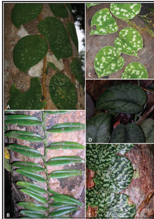
Figure 14: A. Scindapsus treubii Engl. Note the subsucculent, strongly oblique leaf blade, and smooth stem. B-E. Scindapsus pictus Hassk. B. Primary axis showing the diagnostic and older portions with conspicuous orange, brittle scabrid epidermis. C-E. A selection of leaf markings typical of S. pictus . Notes the somewhat scintillating quality particularly in C & E.

Ecology. — In a variety of habitats in the lowlands to mid-elevation. Not rare, but almost always encountered as a juvenile shingling climber. The rarely encountered adult plants form extensive curtains of much-branched stems pendent from the tops of tall forest trees, with the inflorescences born on the tips of the stems.