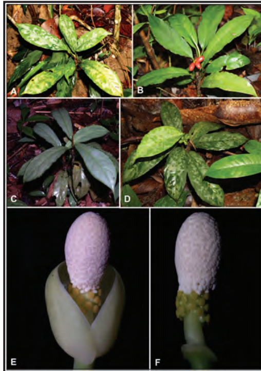
Figure 1: Aglaonema nebulosum N.E.Br. A-D In various leaf forms, either plain or variegated in ashy or silvery irregular blotches, rarely nearly entirely ashy grey with a narrow green margin. E. At female anthesis. F. Spathe artificially removed to reveal the spadix.

2. Aglaonema nitidum (Jack) Kunth, Enum. Pl. 3: 56. 1841; Nicolson, Smithsonian Contr. Bot. 1: 33–37, Fig.7 & 13. 1969. — Calla nitida Jack, Malayan Misc. 1(1): 24. 1820. — Arum integrifolium Link, Enum. Pl. 2: 394. 1822. — Aglaonema oblongifolium Schott, Wiener Z. Kunst 1829: 829. 1829. — A. integrifolium (Link) Schott in Schott & Endl., Melet.