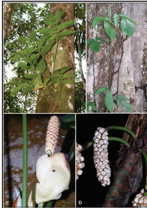
Figure 5: Amydrium medium (Zoll. & Moritzj) Nicolson. Amydrium medium is unusual among hemi epiphytic monsteroids in remaining small, usually climbing less than 4 m, and thus flowering low on the tree trunk. Adult plants have the leaves both perforated and pinnately divided (A). Juvenile plants have less elaborately divided leaves (B). As in most Monstereae the spathe is shed during anthesis (C), but unlike most the fruits are indehiscent berries (D).

Notes. — The ovate-cordate leaves with pandurate lobing and large perforations are immediately diagnostic. The pendent infructescences comprised of large discrete berries ripening white are unmistakable.