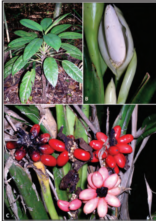
Figure 2: Aglaonema nitidum (Jack) Kunth. A. Evergreen forest population B. At female anthesis. C. The fruits mature from green through white to pink and finally scarlet.

3. Alocasia longiloba Miq., Fl. Ned. Ind. 3: 207. 1856; Hay, Gard. Bull. Singapore 50: 299. 1998. — Alocasia cuspidata Engl., Bot. Jahrb. Syst. 25: 25. 1898. — Alocasia amabilis W.Bull, Cat. 143: 9. 1878. — Alocasia cochinchensis Pierre ex Engl. & K.Krause in Engl., Pflanzenr. IV, 23E (Heft 71): 103. 1920. — Caladium veitchii Lindl., Gard. Chron. 1859: 740. 1859. — Alocasia veitchii (Lindl.) Schott, Ann. Mus. Bot. Lugduno-Batavi 1: 125. 1863. — Alocasia lowii var. veitchii (Lindl.) Engl. in A.DC.