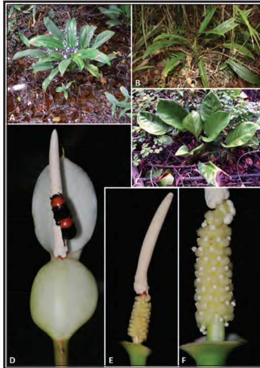
Figure 9: Homalomena rostrata Griff. A - C Plants in habitat showing variation in leaf lamina shape. D. Inflorescence at pistillate anthesis with the presence of two individuals of Parastasia sp. E. Mature inflorescence with spathe artificially removed. F. Pistillate zone.

13. Lasia spinosa (L.) Thwaites, Enum. Pl. Zeyl.: 336. 1864; Hay, Blumea 33: 458–462, Fig.15 & 16 (1988). — Dracontium spinosum L., Sp. Pl.: 967. 1753. — Lasia aculeata Lour., Fl. Cochinch.: 81. 1790. — Pothos heterophyllus Roxb., Fl. Ind. 1: 457. 1820. — Pothos lasia Roxb., Fl. Ind. 1: 458. 1820. — Pothos spinosus (L.) Buch.–Ham. ex Wall., Numer.