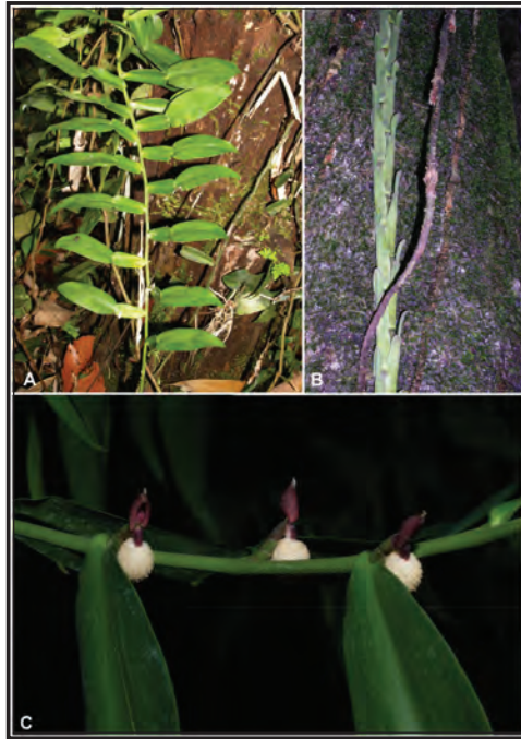
Figure 12: Pothos scandens L. A. Root-climbing plant with its leathery leaf blades. B. Petiole broadly winged. C. Several small inflorescences.

16. Rhaphidophora lobbii Schott, Bonplandia (Hannover) 5(3):45. 1857; Boyce, Gard. Bull. Singapore 51: 223–226, Fig.10. 1999. — Scindapsus lobbii (Schott) Ender, Index Aroid. 74. 1864.