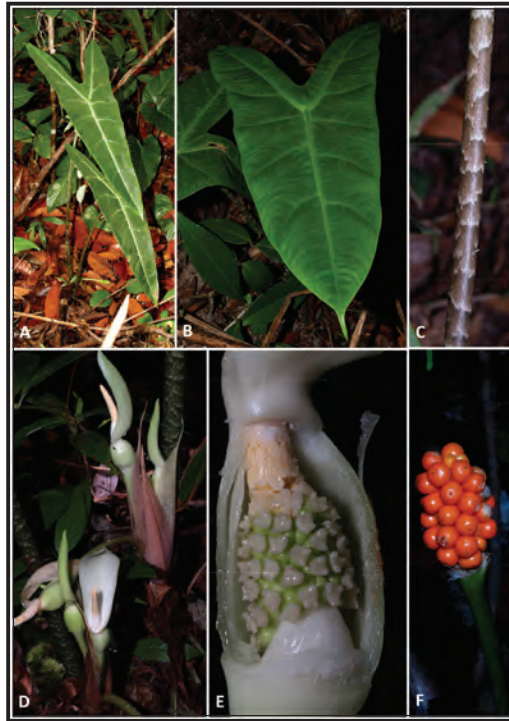
Figure 3: Alocasia longiloba Miq. A & B. Leaf blade pendent, hastate-sagittate, rather narrowly triangular, dark green. C. Petiole snakeskin-like. D. Synflorescence. E. Inflorescence at female anthesis. F. Infructescence brightly orange, bird dispersed.