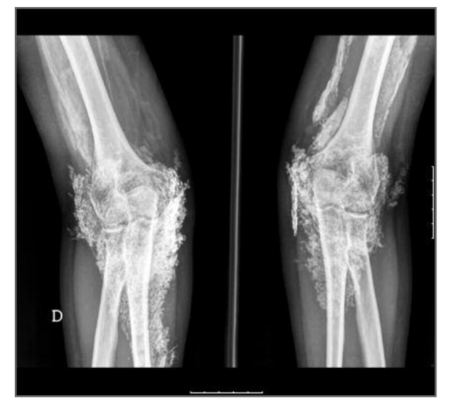
FIGURE 2. Extensive calcinosis lesions – elbows