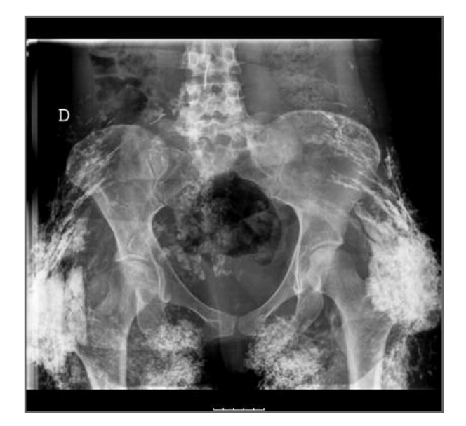
FIGURE 4. After 10 months of treament with pamidronate – hips

There was some improvement on elbow flexion but no significant change in the calcinosis lesions.