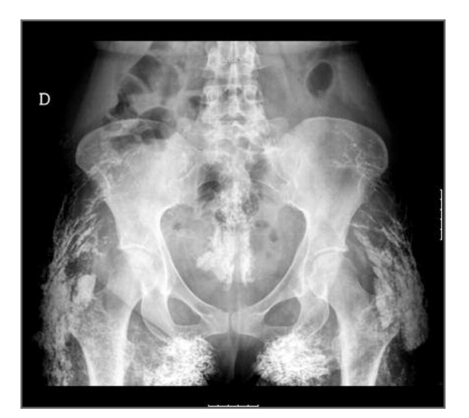
FIGURE 1. Extensive calcinosis lesions – hips

She was submitted to muscular and skin biopsy (left deltoid). The histology of the skin showed a discrete perivascular lymphoid infiltrate and slight hyperkera-