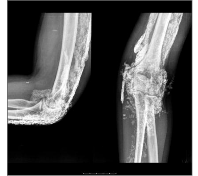
FIGURE 5. After 10 months of treament with pamidronate – elbow