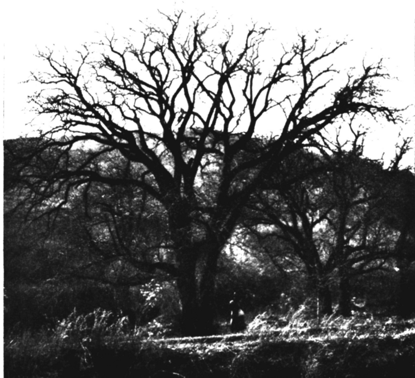
A HARDY WILD PEAR TREE IN KANSU, CHINA (PYRUS SP., S. P. I. No. 40019).

This remarkable wild pear, according to Rehder, stands close to if it is not identical with Pyrus ussuriensis , which has aroused so much interest because of its resistance to pear blight. It occurs in the mountains at altitudes of 8,000 feet in company with the Siberian crab, Populus tremula , and Picea obovata , all northern plants. Though the fruits from the wild tree are hard, acrid, and inedible, the species appears to have given rise to cultivated forms of this pear, which, unlike the true Chinese pear ( Pyrus sinensis ), are melting in character and not hard and gritty. As a stock or for breeding purposes such a vigorous wild pear can hardly fail to be of value. Photographed by Frank N. Meyer near Tchenyatau, Kansu, December 1, 1914 (P12129FS).