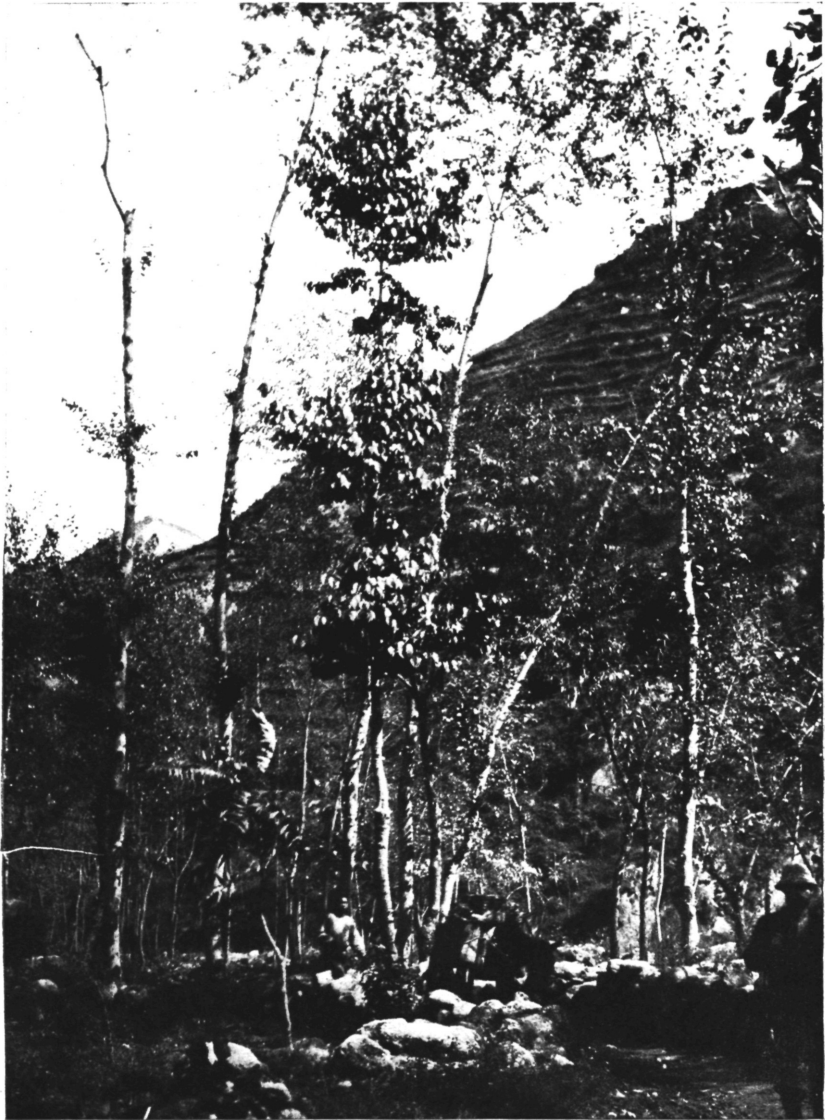
A HARDY GUM-PRODUCING TREE IN KANSU, CHINA ( EUCOMMIA ULMOIDES , S. P. I. No. 40028).

The Tu chung or Shih mien shu tree of Kansu is planted with poplars along roadsides, and its long slender stems are used for house building. It grows to 80 feet in height, preferring shelter from other trees. It has proved hardy at Washington. Its bark and leaves contain a peculiar gum, which as yet has been imperfectly investigated by chemists, but which among the Chinese is highly prized. The ground-up bark is given as a heart stimulant, and is said to especially benefit confirmed opium smokers. Photographed by Frank N. Meyer near Furryi, Kansu, October 7, 1914 (P12164FS).