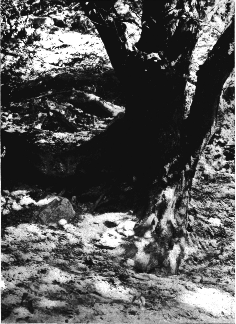
TRUNK OF POTANIN'S PEACH ( AMYGDALUS PERSICA POTANINI , S. P. I. No. 40007).

A wild peach of the type of A. davidiana , but seldom growing so large; maximum 30 feet. Occurs at altitudes of 4,000 to 7,000 feet in side valleys, especially in well-sheltered warm mountain pockets. Its fruits are not edible, but as a stock for stone fruits it may prove more drought resistant even than davidiana . Its behavior on a hillside location is shown in the illustration. October 29, 1914 (P12108FS).