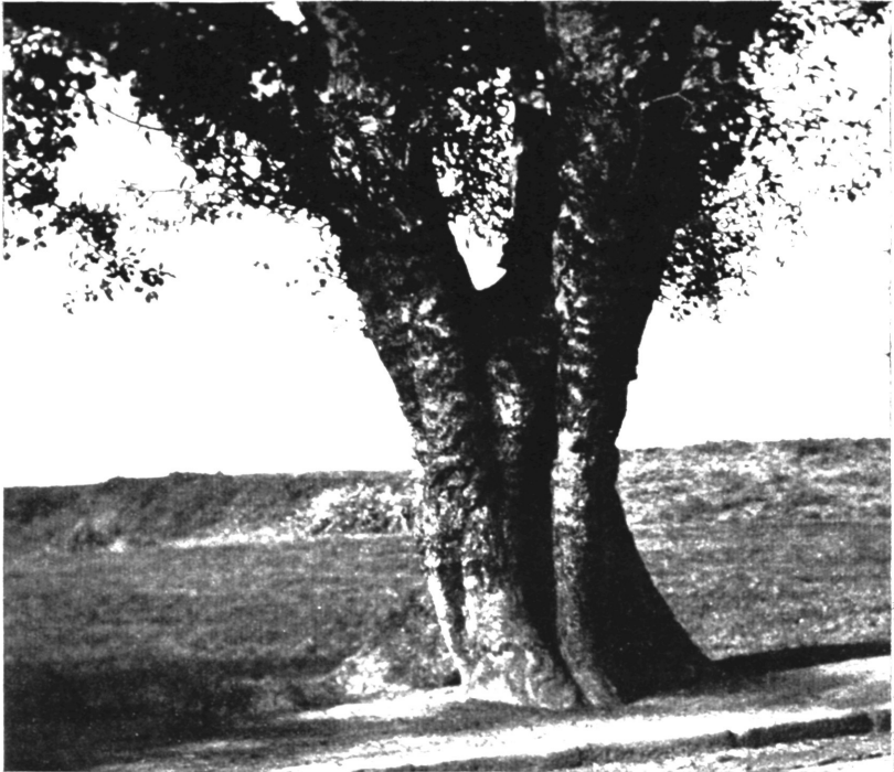
THE SYCAMORE FIG ( FICUS SYCOMORUS S. P. I. Nos. 39827, 39857, AND 39858).

From the wood of this "sycamore" of Scripture, the "Tree of Life" of the Egyptians, the ancient coffins were made. It is a true fig tree and was introduced into Egypt, probably from Yemen on the east coast of the Red Sea, in very early times. It bears figs of inferior quality which are inhabited by the fig insect ( Sycophaga crassipes ). These figs are not fit to eat unless their tips are cut off to let the fig insects escape. From the time of Pliny even the Egyptian boys have operated on these sycamore figs, using a kind of thimble made of iron plate ending in an iron "finger nail." The figs are borne on small leafless fleshy branches arising directly from the trunk, and it is the practice to beat the trunk of the tree with a hammer to increase its fruitfulness. The illustration shows the scars thus induced. (P20231CP).