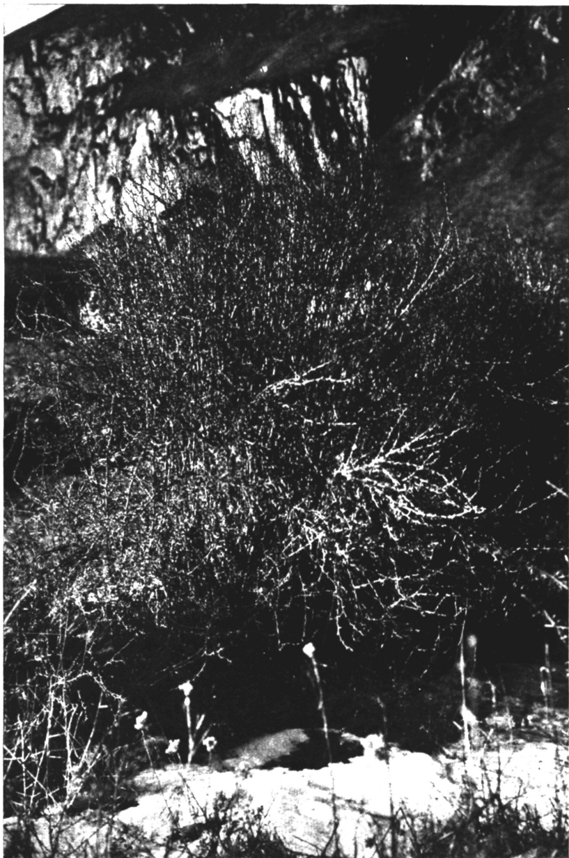
A TALL-GROWING GOOSEBERRY FROM KANSU, CHINA ( RIBES ALPESTRE GIGANTEUM , S. P. I. Nos. 39916 and 40022).

A remarkably spiny tall wild gooseberry, growing at altitudes of 7,000 to 9,000 feet in the Province of Kansu. Suitable as a hedge plant. The berries are elongated, of medium size, and hang on the bush throughout most of the winter. These fruits are preserved by American missionaries and make a delicious tart jam. Photographed by Frank N. Meyer, near Yangsa, Kansu, November 29, 1914 (P13149FS).