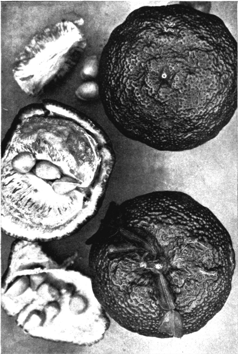
AN INTERESTING HARDY CITRUS FRUIT FROM KANSU, CHINA (CITRUS SP., S. P. I. Nos. 39897 AND 40039).

A peculiar loose-skinned fruit with light yellow rind, agreeable sharp-sour taste and lemon odor. The trees are thrifty and apparently prolific. This species is found at altitudes of 2,000 to 4,500 feet in a region where persimmons, figs, pomegranates, walnuts, and pears are cultivated. Photographed by Frank N. Meyer, October 20, 1914 (P13140FS).