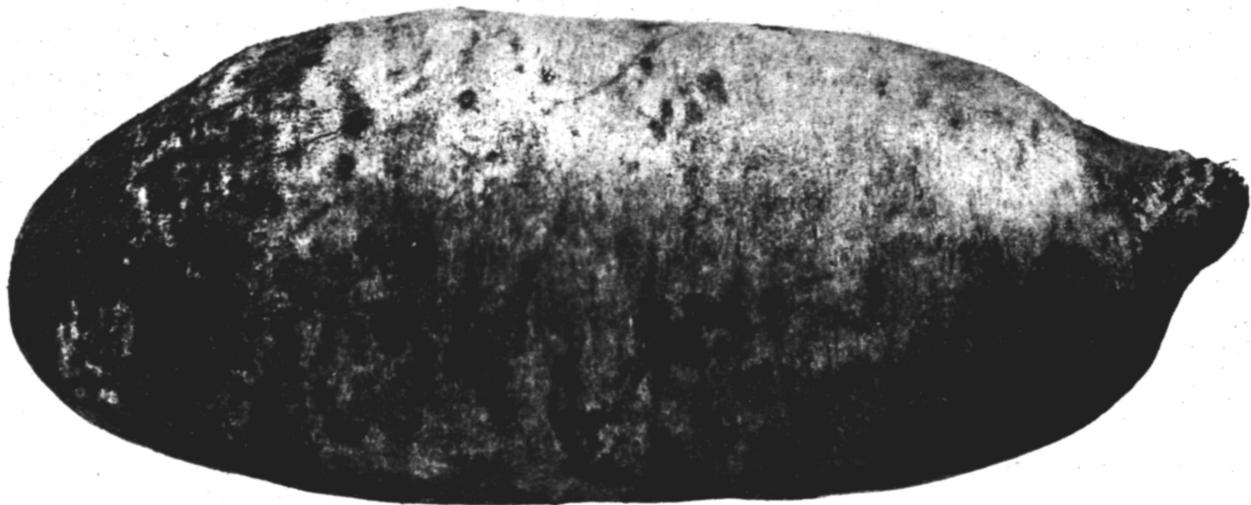
THE MANAWA YAM, FROM THE REPUBLIC OF PANAMA. (DIOSCOREA SP., S. P. I. No. 42052.)

The mealy whiteness of the flesh when cooked, the smoothness of the skin, and the shape and size of this yam make it an extremely desirable variety for table use. The first introduction did not succeed at the place where tested, but the unusually attractive appearance and excellent qualities of this variety make it worthy of the extensive trials in Florida which are now contemplated. (Photographed, natural size, by E. L. Crandall, January 17, 1916; P19425FS.)