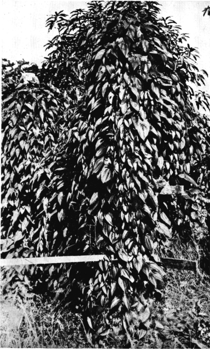
THE DAGO HAYA, THE BEST TROPICAL YAM, FROM THE ISLAND OF GUAM, GROWING AT MIAMI, FLA. ( DIOSCOREA ALATA L., S. P. I. No. 39705.)

The true yams constitute an important group of starchy tuberous-rooted food plants and should not be confused with certain varieties of sweet potatoes that are called yams in our Southern States. They should be grown and used largely in those warm regions of the world where they will thrive and into which people demanding white potatoes have to import them from cooler regions. In the island of Trinidad the production of the yam, cassava, taro, and other starchy root crops has been so increased during the war that the necessary demands on the wheat supply of the world and on transportation for carrying flour and potatoes to that island have been materially reduced. (October 20, 1916; P20115FS.)