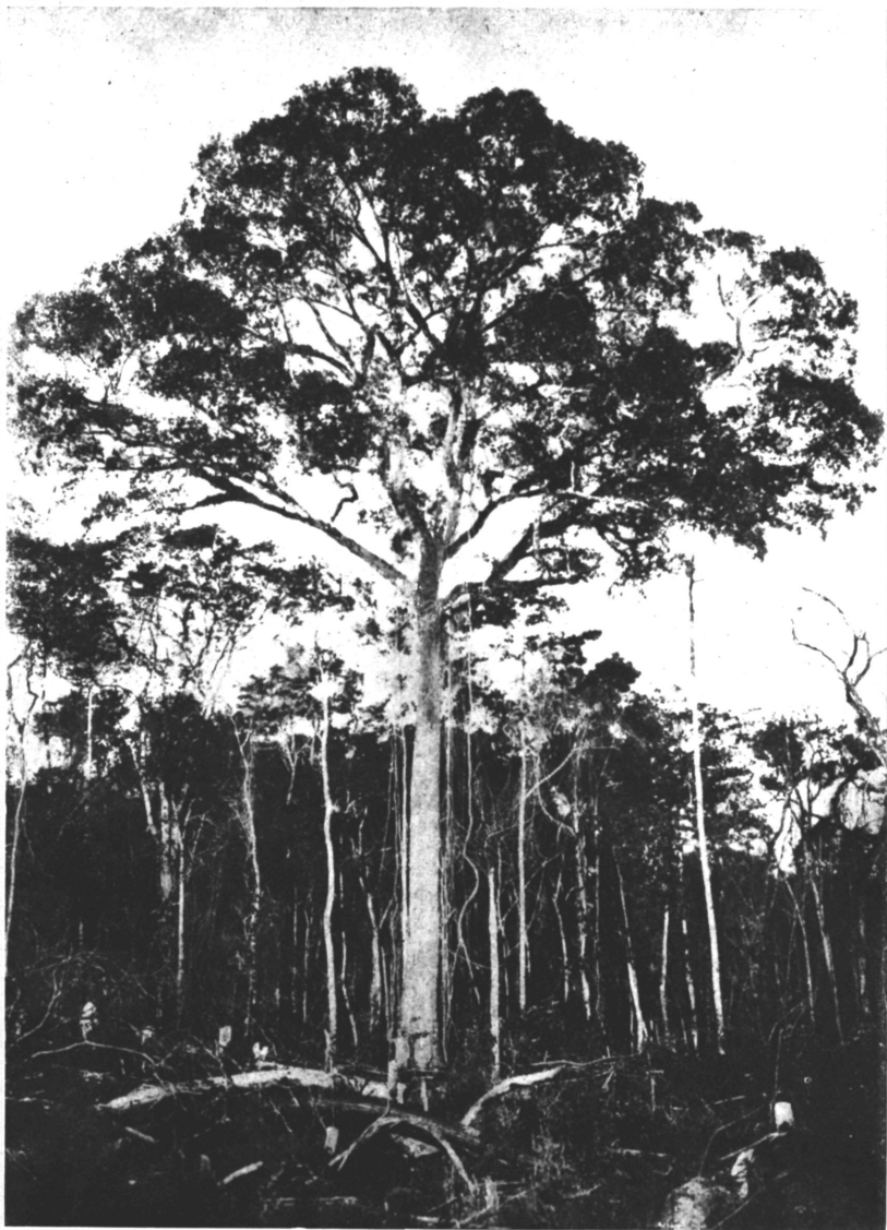
THE JEQUITIBA, A GIANT FOREST TREE OF BRAZIL. ( CARINIANA LEGALIS (MART.) KUNTZE., S. P. I. NO. 41933.)

Although smaller than the sequoia, the giant eucalyptus, or the California redwood, this superb tree deserves to rank with them in magnificent proportions, because of its perfect columnar trunk, which rises like a Corinthian column and supports a magnificent crown of immense branches, each one of which is large enough to make a good-sized tree. Such a wonderful species as this should not be allowed to perish from the face of the earth, and plantings of it deserve to be attempted in our own tropical possessions. There are records of trees of this species which measure 130 feet in height. The jequitiba is related to the tree which bears Brazil nuts, but its nuts are not edible. (Photographed by Señor E. N. de Andrade, Rio Claro, Brazil, whose collections of Brazilian trees, and especially his extensive plantations of eucalyptus, have become world known.)