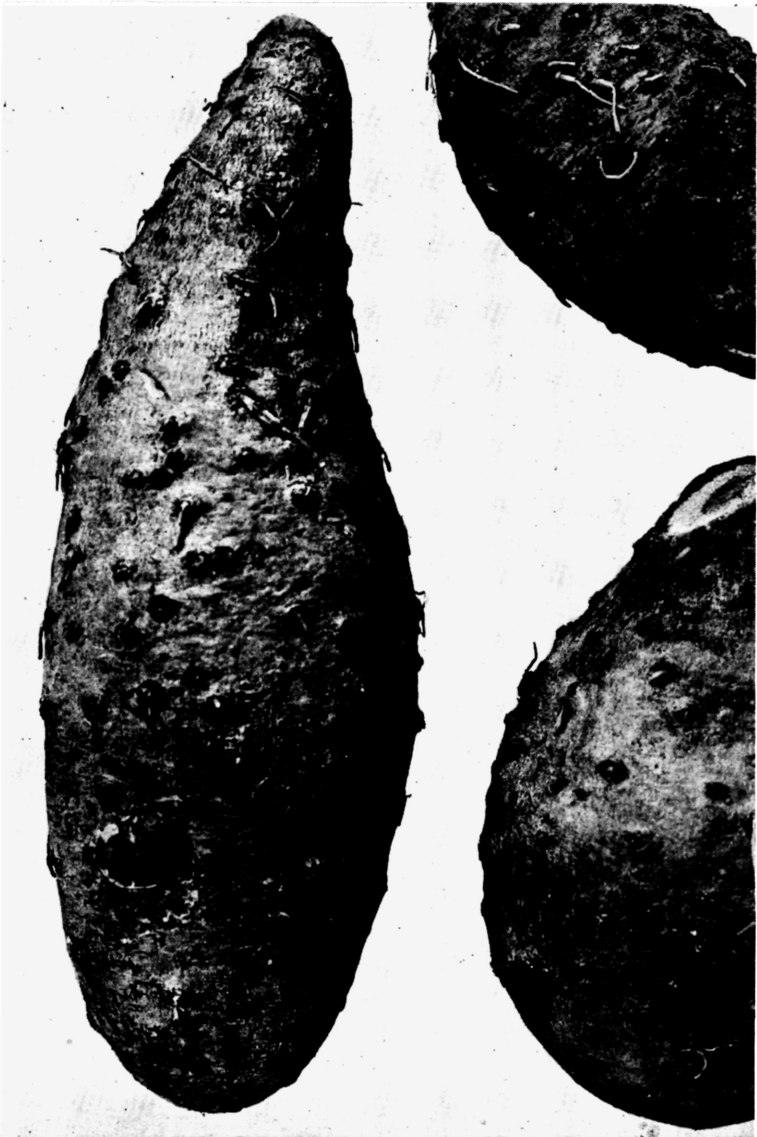
TUBERS OF THE WHITE YAMPEE, A VARIETY OF YAM GROWN IN THE CANAL ZONE. ( DIOSCOREA TRIFIDA L. F., S. P. I. NO. 42053.)

This yampee is of fine quality and will furnish the South with another food equal to the best potatoes if it can be grown there successfully. When baked or when peeled and boiled it resembles a mealy potato and approximates it in food value, though slightly lower in protein. (Photographed, natural size, by E. L. Crandall, March 2, 1916; P19482FS.)