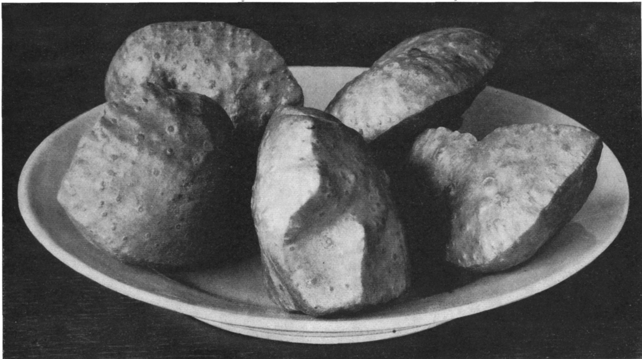
A DISH OF THE ACOM. (DIOSCOREA LATIFOLIA BENTH., S. P. I. [No. 47564.]

The acom, one of the tropical yams, is almost unique among the edible species of this genus in that the tubers are aerial, being borne in the vine axils of the leaves instead of underground. The flesh of the tubers is yellowish, very dry, and firm, with a distinctive flavor. While perhaps not of such high table quality as some of the white-fleshed yams, the exceptional keeping qualities of the acom may give it a place of considerable value in our markets when the right conditions for growing it in this country are found. It is much esteemed where grown in Brazil. (from tubers grown at the Plant-Introduction Garden, Brooksville, Fla., April 24, 1920; P25411FS.)