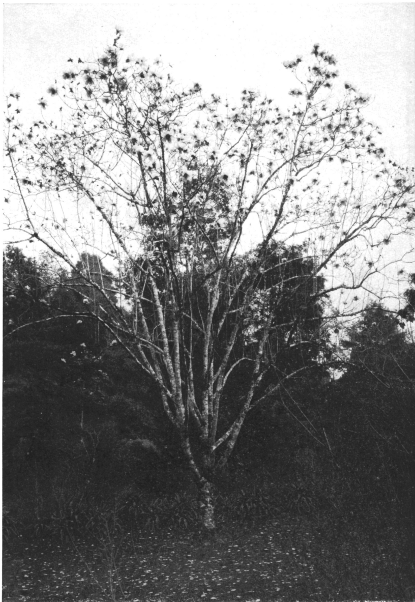
THE QUEEN OF MAGNOLIAS AS IT GROWS AT DARJILING, INDIA. (MAGNOLIA CAMPBELLII HOOK. F. AND THOMS., S. P. I. No. 47714.)

Campbell's magnolia, considered the handsomest of that whole genus of beautiful trees, grows 80 feet or more in height and makes, as this picture shows, a wonderful display with its mammoth flowers just before the leaves appear. It is native to the Himalayas, where it ascends to an altitude of 8,000 feet. It has been grown successfully in the milder sections of England and will probably prove hardy only in our Southern States. (Photographed by Joseph F. Rock, Darjiling, India, March 4, 1921; P22743FS.)