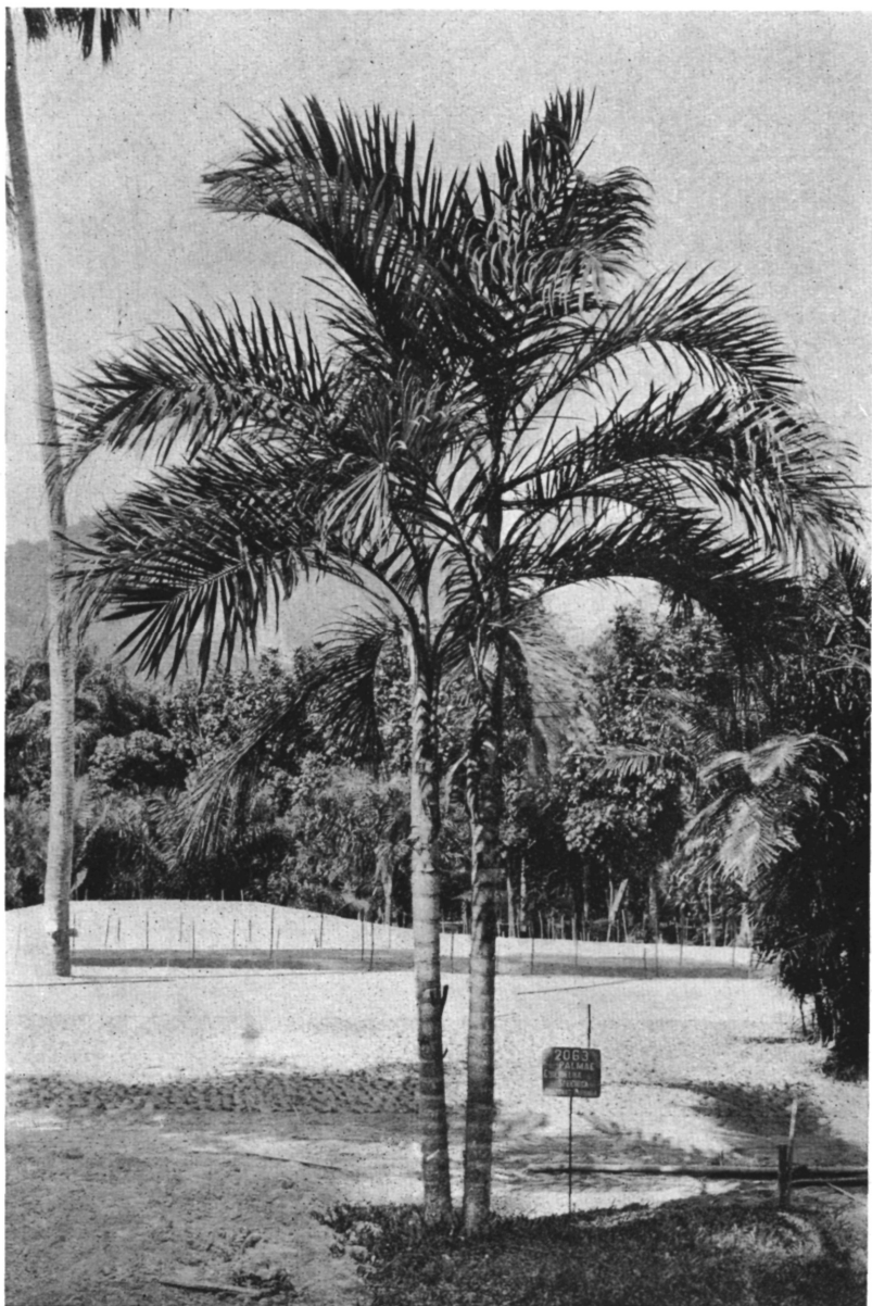
A PALM WHICH RIVALS THE BANANA AS A FOOD PRODUCER. (GUILIELMA SPECIOSA MART., S. P. I. No. 47868.)

The pupunha, which grows wild in the Amazon Valley of Brazil, produces large bunches of yellow fruits the size of an apricot. When boiled, these fruits have somewhat the texture and flavor of the chestnut and are of high food value. The plant, which is perhaps not specifically distinct from the pejobaye of Costa Rica (though the latter is usually considered to be G. utilis, not G. speciosa), should be cultivated throughout the Tropics.