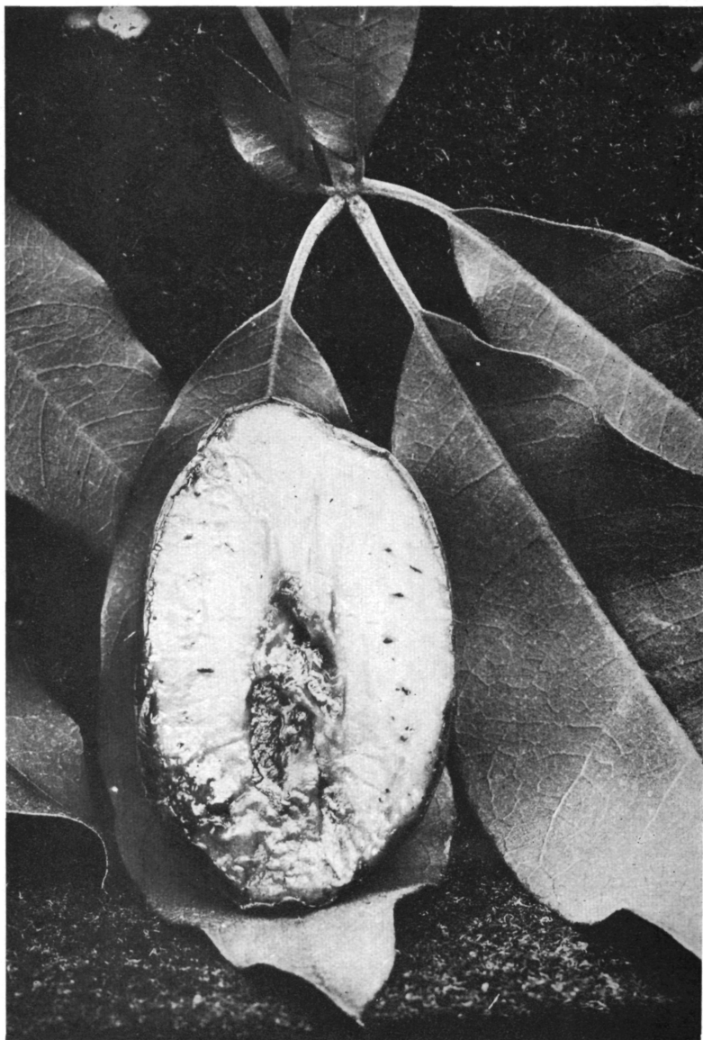
A SEEDLESS WHITE SAPOTE. (CASIMIROA SP., S. P. I. NO. 47957.)