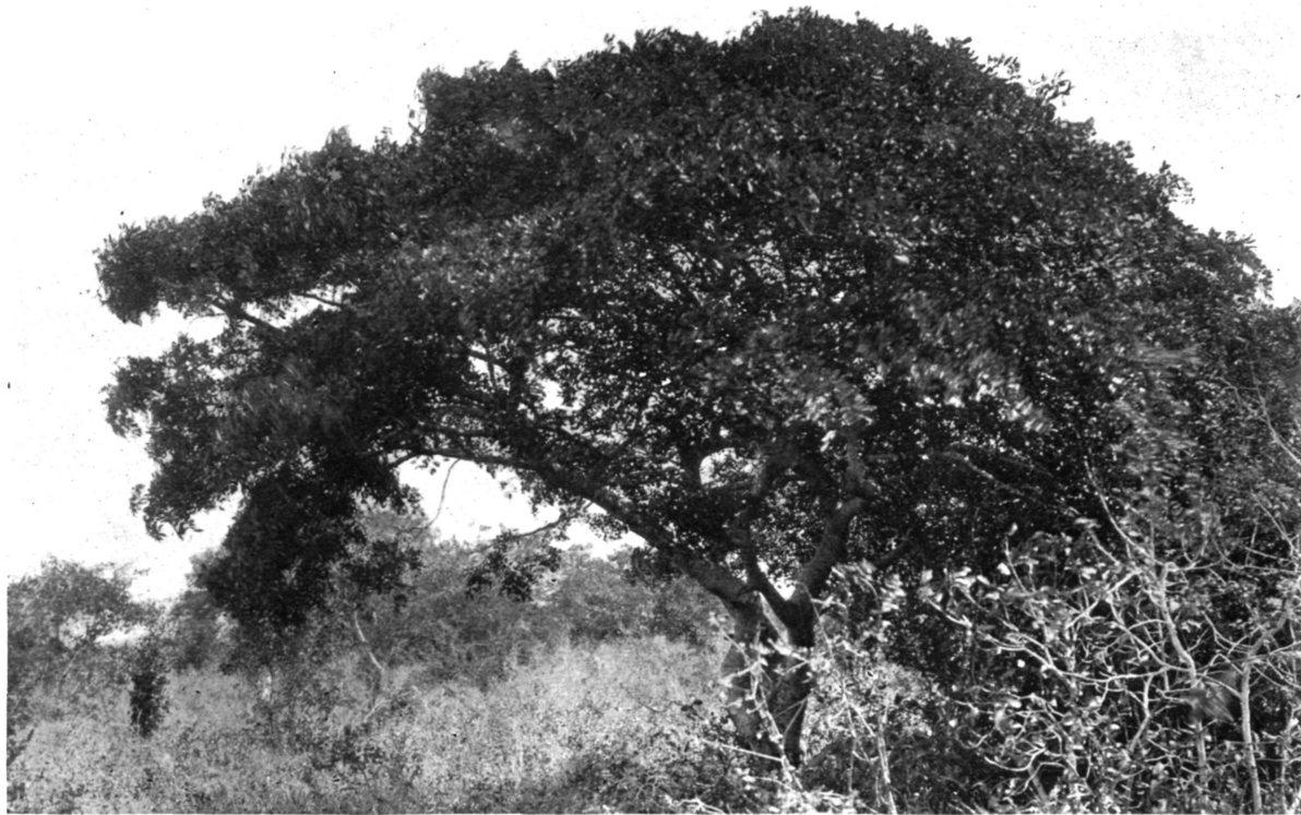
THE MAHOGANY BEAN, A VALUABLE AFRICAN TIMBER TREE. ( PAHUDIA QUANZENSIS (WELW.) PRIN, S. P. I. NO. 48253.)

This tree, sometimes called "Rhodesian mahogany" or "pod mahogany," occurs in southeastern Africa. Its wood very much resembles that of true mahogany ( Swietenia mahagoni ), but is of coarser grain. As an ornamental tree it may have value for shade, its large pealike flowers are very attractive in appearance, and the handsomely marked beans are used for necklaces. The species is probably somewhat drought resistant, not particular as to soil, and may stand a little frost after it has attained a growth of a few years. (Photographed by Dr. H. L. Shantz, Lourenco Marques, Mozambique, October 25, 1919; P36567FS.)