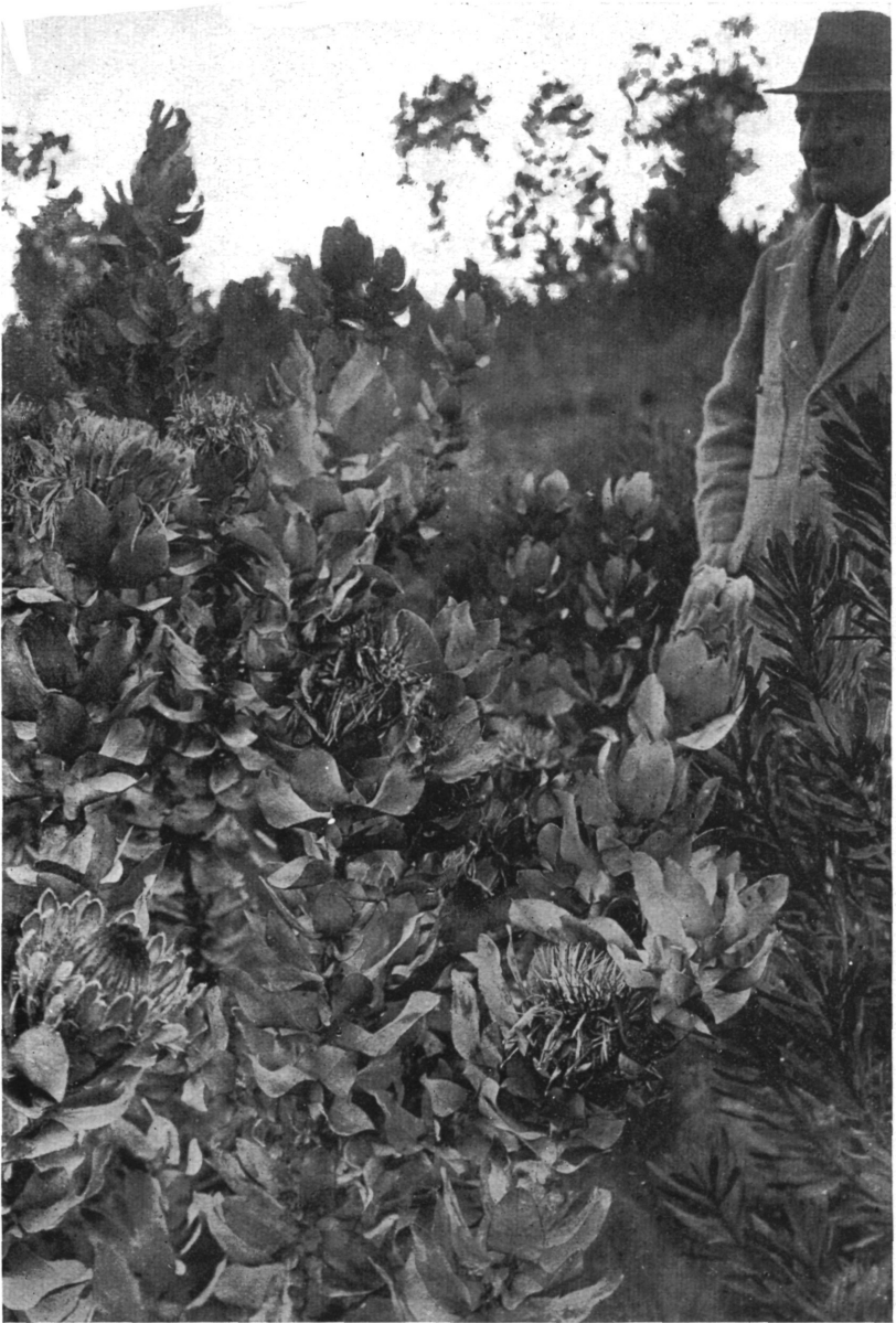
A FAVORITE PROTEA OF CAPE PROVINCE. ( PROTEA LATIFOLIA R. BR., S. P. I. No. 48183.)

Owing to lack of understanding of the methods of handling plants of this genus, they have been neglected by American horticulturists. As they are among the most beautiful and popular of the many handsome ornamental plants of South Africa, we should make an effort to learn the secrets of their successful culture. The species here shown, which has purple-tinted flower heads 4 inches broad, should be given a careful trial in California and Florida. It probably will not do well on soils which contain much lime.