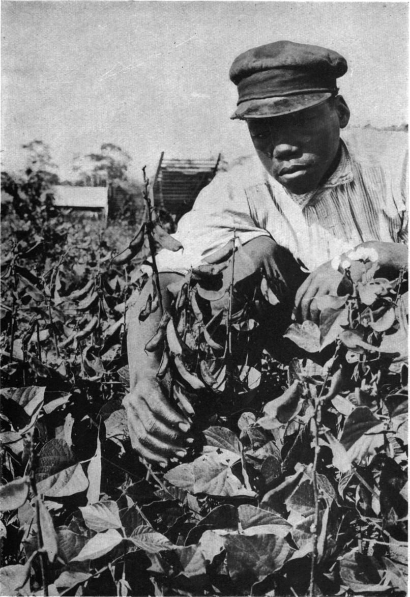
GATHERING BONAIVIST BEANS IN SOUTHERN FLORIDA. (DOLICHOS LABLAB L., S. P. I. NO. 47977.)

The bonavist bean is a perennial rank-growing species which forms a satisfactory ground cover in orchards. It produces its pods clustered on short erect stalks which project above the foliage, making them easy to gather. Its beans, both when young and green and when dried, are an excellent vegetable which deserves to be known in all frostless regions where the plant will grow.