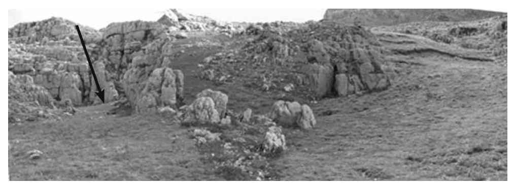
Fig. 2. Vathia Lakka, Mount Giona. The site on the left part of the photo (arrow) would be suited to establish a genetic reserve.

engagement and funding of a reserve manager, and the monitoring of the location to assess the impact of the site management on the target species. The distribution area on Mount Olympos would be most suited for the establishment of a genetic reserve because the sites are already located within or close to the Nature Park. Two further sites, one on Mount Parnassos and a second on Mount Giona, would also be possible choices. Fig. 2 shows the Vathia Lakka site located on Mount Giona. In the background of the left part of the photo, rocks formed a U-like structure, which could easily be fenced by a shepherd and grazed by sheep or goats in a controlled manner favouring reproduction of the species.