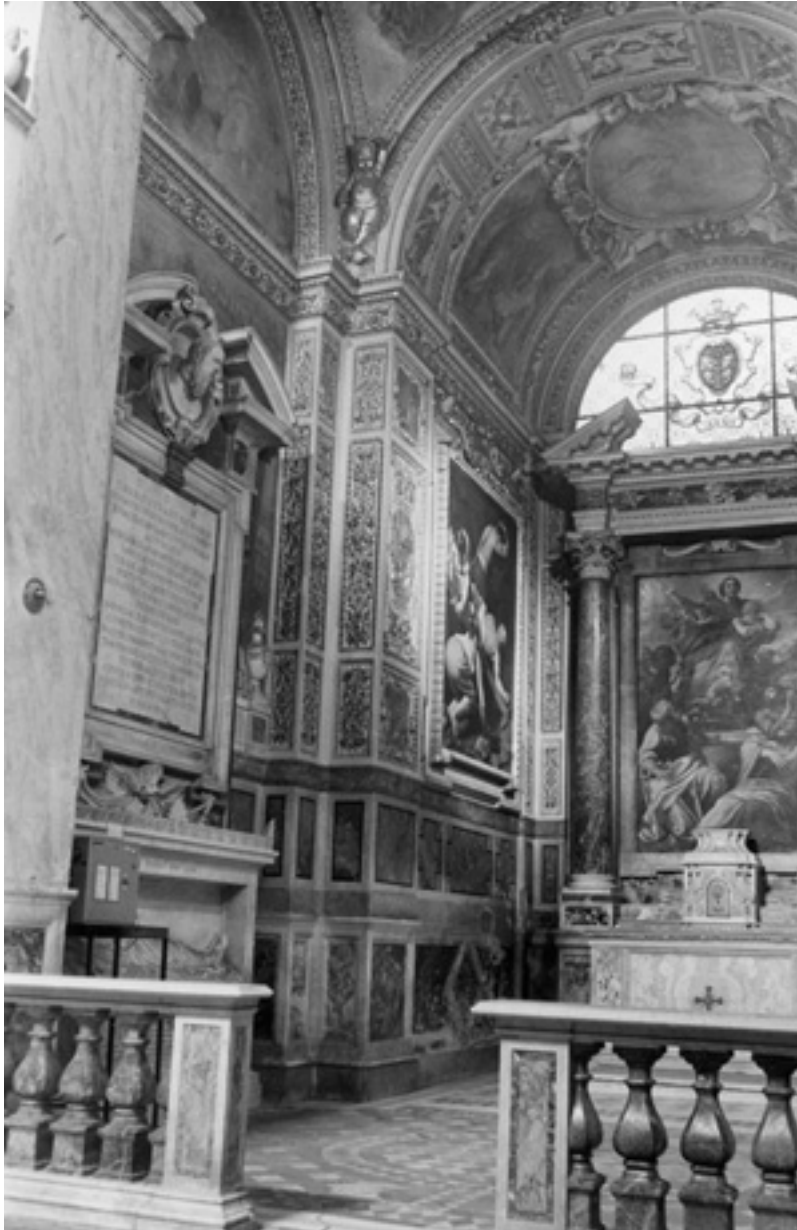
(Fig. 1) Cerasi Chapel, Santa Maria del Popolo (1601). Left wall, Caravaggio's Crucifixion of St. Peter ; center, Annibale Carracci's Assumption .