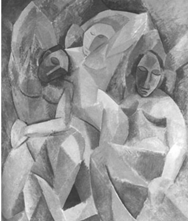
(Fig. 3) Pablo Picasso, Three Women , 1908. St. Petersburg, State Hermitage Museum.

Now let me cite an observation of the kind that heads not for banality, but for oblivion. In 1978, I published a long piece, called “Resisting Cézanne,” about Picasso’s Three Women of 1908 (fig. 3). 6 It dealt with Picasso’s ambivalent relation to the dead master—Cézanne’s series of bathers especially; and with the onset of Cubism; and with what I perceived as this painting’s true subject.