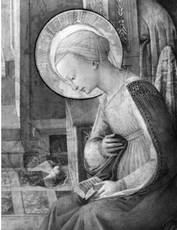
(Fig.2) Filippo Lippi, Annunciation , 1450s (detail). London, National Gallery.

London, National Gallery, August 1984, facing Lippi's Annunciation . A round-topped panel, 60 inches across, dense as all Lippis are and lovely to look at. Suddenly, I noticed something I knew I'd not seen before: the Dove of the Holy Ghost down from its usual altitude to level with Mary's belly, and so near, it seemed half-caught in the bend of her acquiescence (fig. 2). Closing in on the panel, I saw what was happening: a spray of tiny gold particles proceeding from the dove's head and beak toward the Virgin's womb, from which, through a slit in her dress, issued a responsive burst of golden dots. What on earth was the painter thinking?