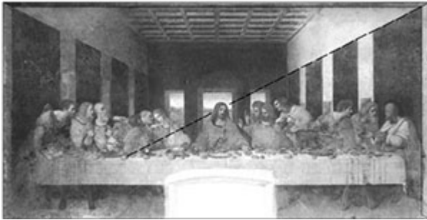
(Fig. 4) Leonardo, Last Supper , 1498, with diagonal aimed at Judas' elbow.