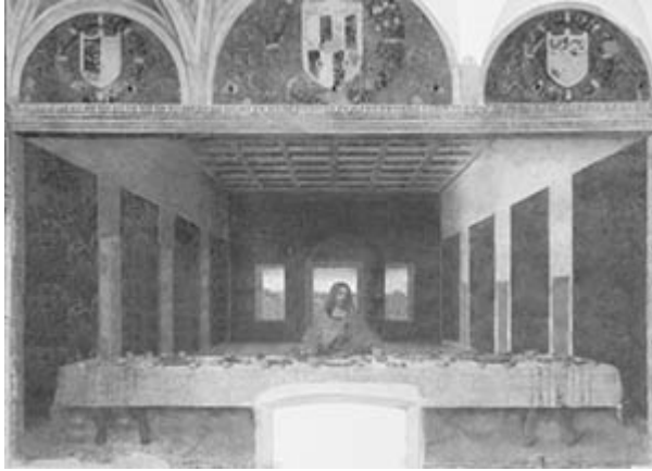
(Fig. 5) Last Supper with Christ alone . Computer manipulation by Don Quaintance.

Think of the picture as consistently two in one. On the one hand, a climactic dramatic moment: twelve men reacting to an utterance from the Master. What they see of him is his profile, the right or the left. But to the viewer this side of the mural, more is apparent. The frontality blatant to us shows us Christ's upper body as an equilateral triangle, sign of the Trinity; shows that sign backed by triune fenestration, like a church apse; shows the segment gable over the central light forming an incipient halo. And only the viewer outside the picture sees the Protagonist irradiating his ambience and bestowing the elements of the Eucharist in one forwarding gesture. (See fig. 5, Don Quaintance's startling epitome.) This is the other theme of the picture—its aspect on the longitudinal axis. It intersects with the dramatic, which unfolds laterally on the picture plane. As Leonardo enacts the events of this Supper in unison, they coincide, inhere in each other.