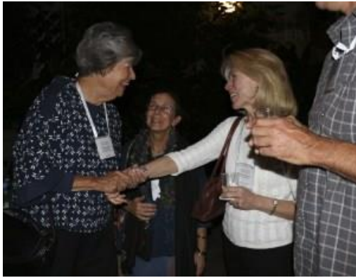
TSA 2012 Symposium in Washington, D.C. Opening reception.