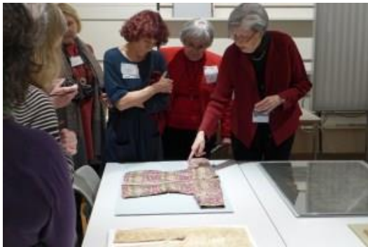
TCU at Cleveland Museum of Art 2014