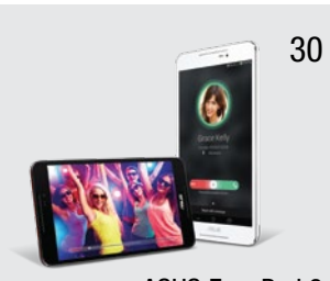
ASUS FonePad 8 Fonepad is Calling