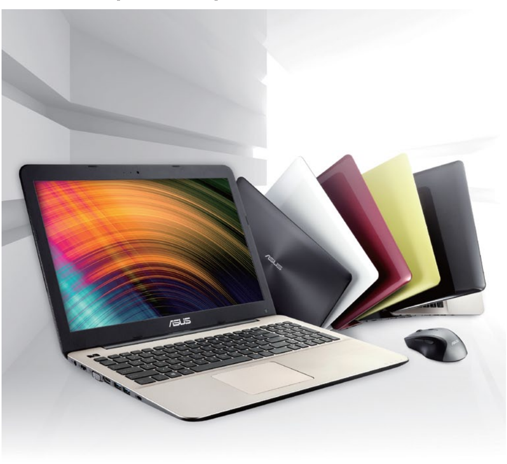
ASUS A Series ships with Windows 8.1, so you can browse the web faster and utilize more powerful computing to do more wherever you are.