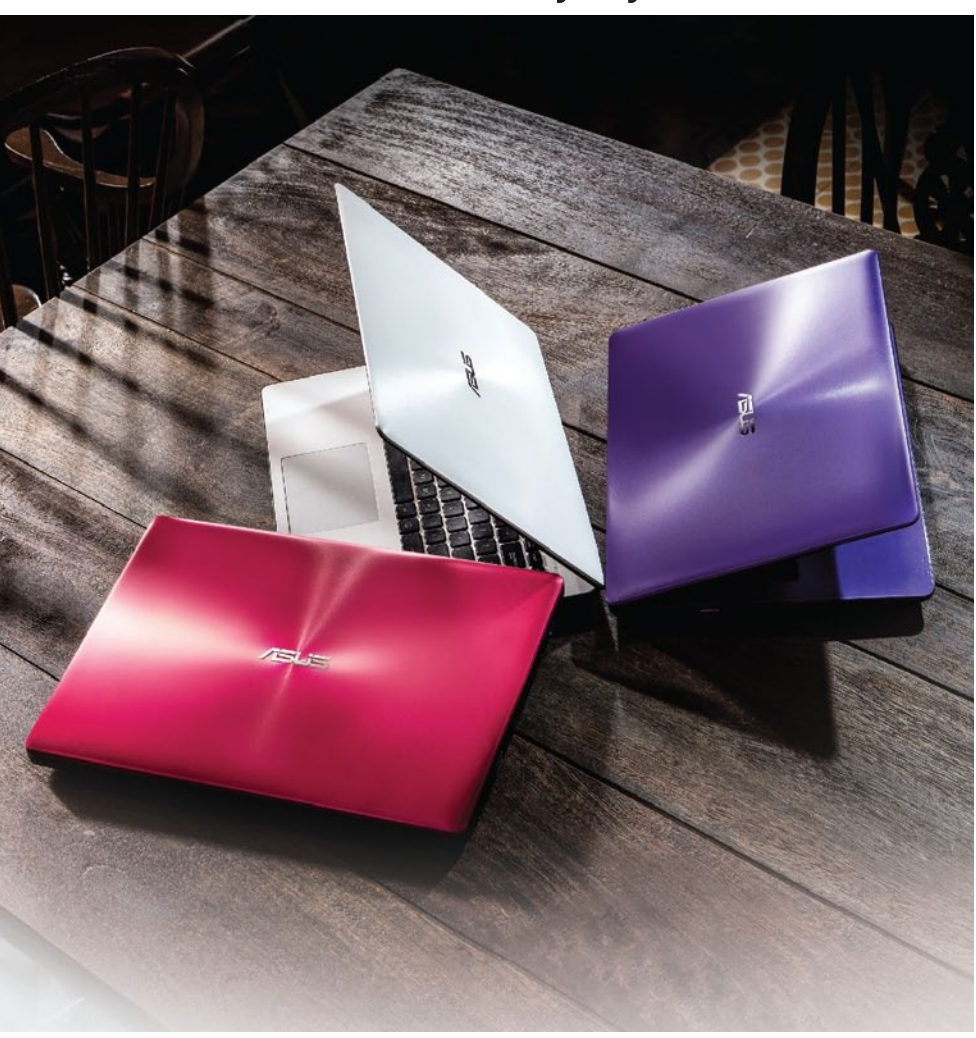
ASUS X Series ships with Windows 8.1, so you can browse the web faster and utilize more powerful computing to do more wherever you are.