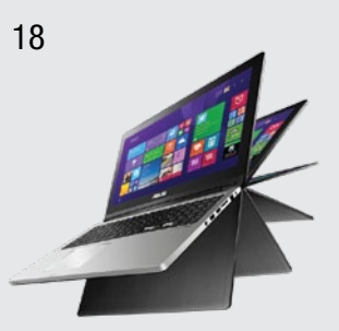
ASUS Transformer Book Flip Laptop with 360° rotating touchscreen