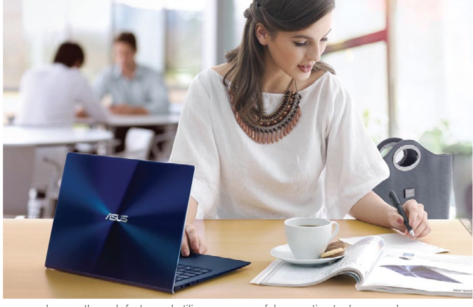
ASUS Taichi™ ships with Windows 8, so you can browse the web faster and utilize more powerful computing to do more wherever you are