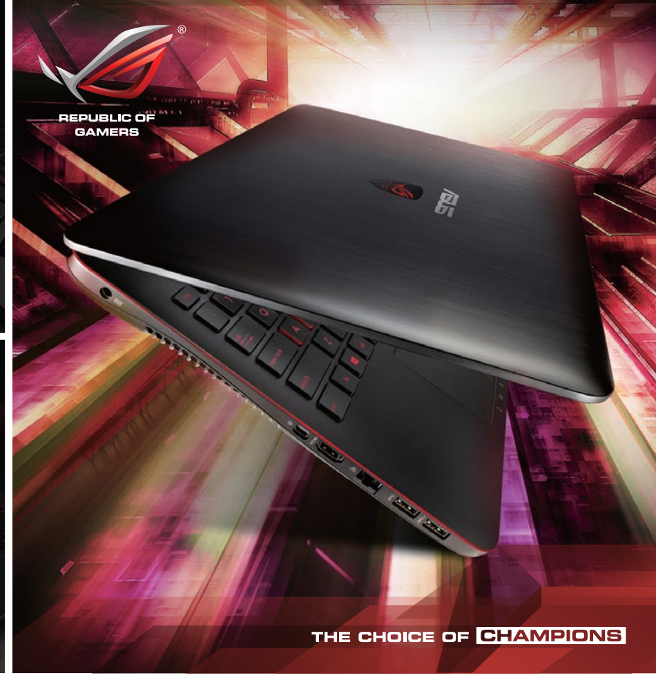
ASUS G Series ships with Windows 8.1, so you can browse the web faster and utilize more powerful computing to do more wherever you are.