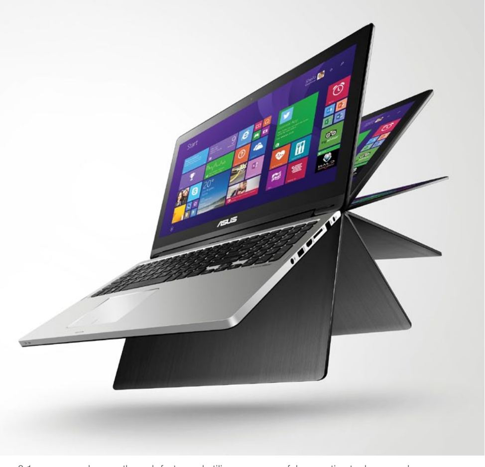
ASUS Transformer Book Flip ships with Windows 8.1, so you can browse the web faster and utilize more powerful computing to do more wherever you are.