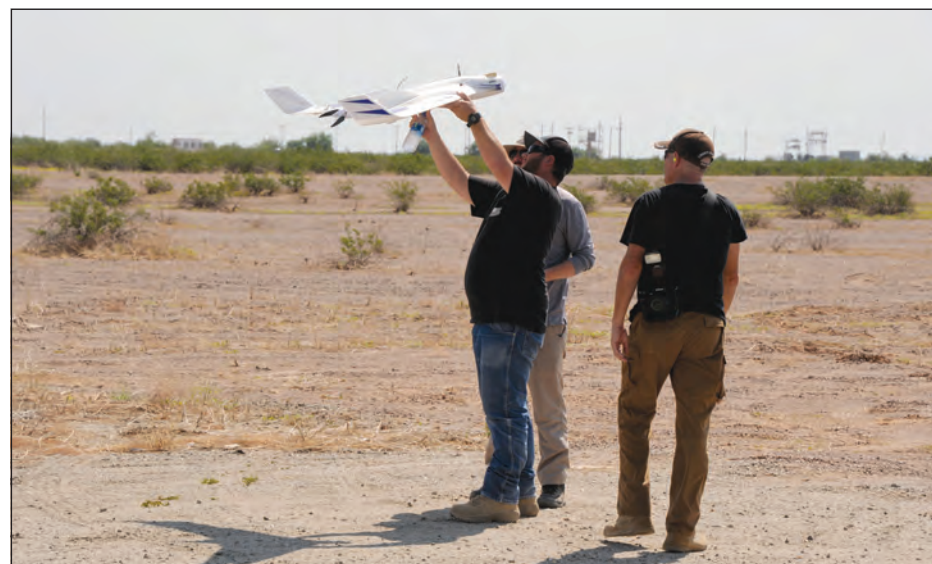
The Joint Counter- Small Unmanned Aircraft (C-sUAS) Office has hosted industry demonstrations of the latest C-sUAS technology at U.S. Army Yuma Proving Ground for the past two years. Their most recent event took place across four weeks in May and June.