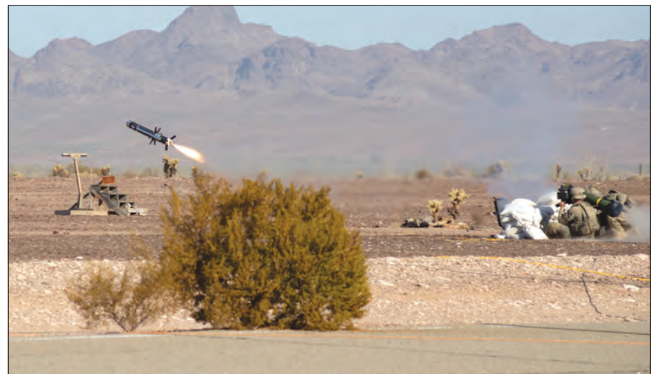
Yuma Proving Ground hosted large operational tests of an upgraded version of the FGM-148 Javelin missile at Yuma Test Center this summer, and at Cold Regions Test Center at Fort Greely, Alaska earlier in the year.

The updated Javelin is lighter, smaller, and boasts better target-acquiring optics that the legacy version. Though live fire of the systems only occurred on the last event of the testing schedule, evaluators used a laser system to detect hits achieved by inert Javelin trainers throughout the scenarios. YPG vehicle operators drove the realistic target vehicles in multiple work shifts across the weeks the testing took place. Placing the threat targets in advance of the live fire took careful work from a variety of YPG support elements, from the Ammunition Recovery group that ensured the paths to the target emplacement sites were cleared of all unexploded ordnance to the Threat Target Systems section who removed