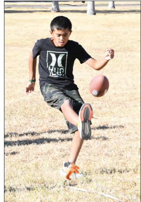
Several dozen boys and girls participated in outdoor activities on a day that made for an ideal setting for the Yuma Proving Ground's Sports and Fitness Youth Field Day. Held on Nov. 21 at Cox Field, the children participated in several events including Punt, Pass and Kick contests, a three-legged race, a baton relay, and more. Activities ran from 2 to 4 p.m. and the event was free to children between the ages of five to 18.