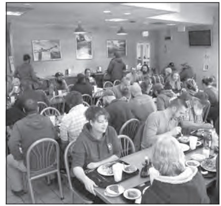
On Nov. 16, the Cold Regions Test Center (CRTC) family gathered for its quarterly all-hands update which was followed by CRTC's annual Thanksgiving lunch. Prior to lunch, the CRTC Command Team briefed CRTC on current events including the results of its most recent climate survey – results that clearly illustrate CRTC's positive work environment.