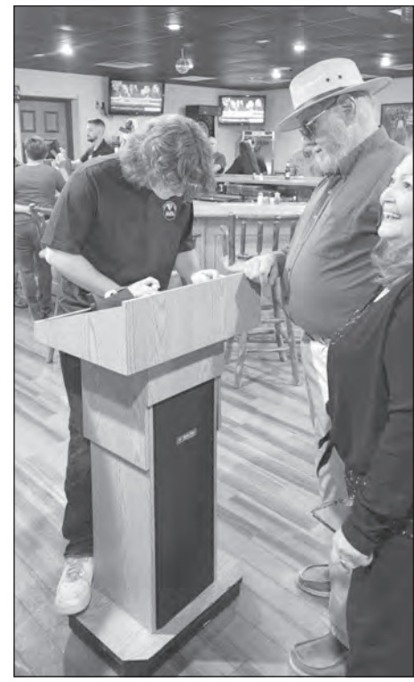
The Family, Morale, Welfare and Recreation team joined efforts to serve Thanksgiving dinner at the Cactus Café. The team served over 300 meals, with 30 of those being takeout. Many families look to the YPG team for their annual Thanksgiving dinner, and the team did not disappoint.