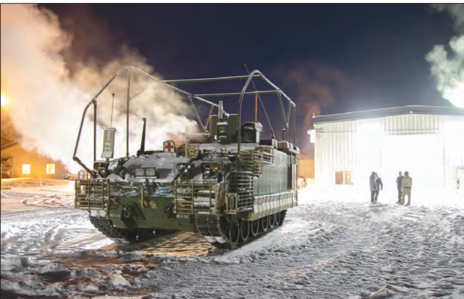
The Armored Multi-Purpose Vehicle, which entered full-rate production in September, was previously subjected to intense developmental testing at all three of U.S. Army Yuma Proving Ground's natural environment test centers—Yuma Test Center, Cold Regions Test Center (CRTC), and at Tropic Regions Test Center (TRTC) in the Panamanian jungle.