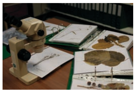
The ATH Public Reference Collection.

The ATH website (www.ath.org.au) received 171,181 hits and 27,517 visits in 2011. These numbers are 85% and 106% higher than those for 2010, indicating a strong increase in interest in the website.