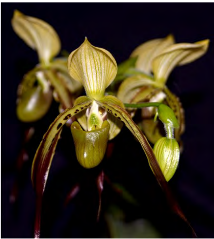
Paphiopedilum parishii – Carson Barnes

from the mountains of Burma and western and northern Thailand, in areas with heavy summer rainfall, but a distinct dry season in winter. The plants grow either epiphytically fairly low on trees, or on moss covered rocks in relatively shady locations. In nature, the heavy inflorescences, with seven or eight closely spaced and rather large flowers, arch downward from the plants. In cultivation they may require the help of staking to both bear the weight of the blooms and hold them at the best angle for maximum impact. Even with this multifloral trait, the robust foliage can somewhat overwhelm the effect when in bloom.