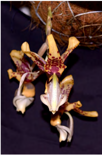
Stanhopea Bird of Prey – Nancy Newton & in memory of David Glass

between Stan. jenischiana and Stan. nigroviolacea registered in 2003 by Rolf Wilhelm of Woodland Orchids in Charlotte. Results vary quite a bit from seedling to seedling in this cross, with a few exceptional plants exhibiting a good pattern of strong purple markings on a yellow background. In others the markings are less pronounced. The exhibited plant is one of those with good color. Culture is the same as for the following description of the Stan. jenischiana parent.