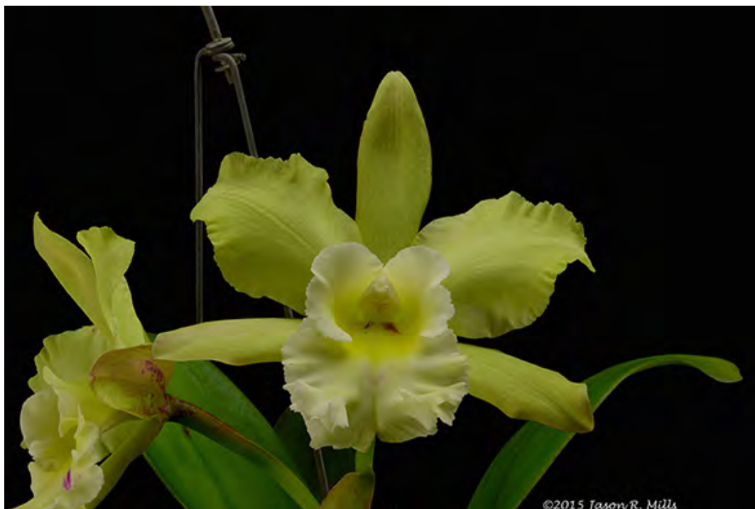
Rhyncholaeliocattleya Mystic Isles 'Justin' , HCC/AOS, 78 pts.