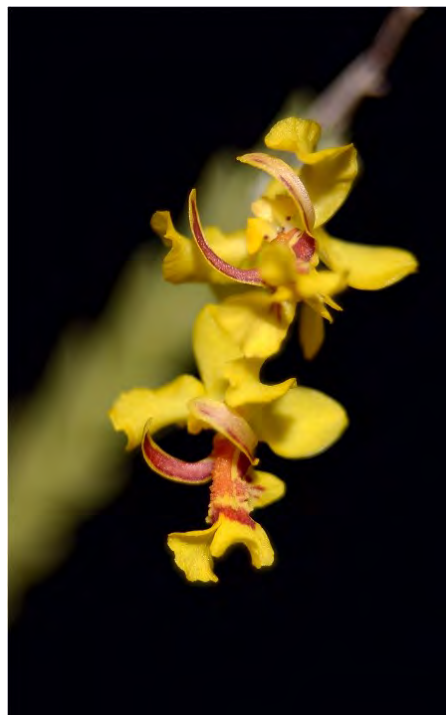
Lockhartia amoena – Jason Mills & Ed Shoulta

While the flowers of the various Lockhartia species reveal their relation to the Oncidinae family, the plants are altogether different and usual in appearance. They lack pseudobulbs, and instead bear arching stems clad in closely spaced, overlapping leaves that give a flat braided appearance to the plants. Flowers emerge off an on throughout the year from leaf axils near the tip of the stem, and often several inflorescences, each bearing a few blooms, emerge