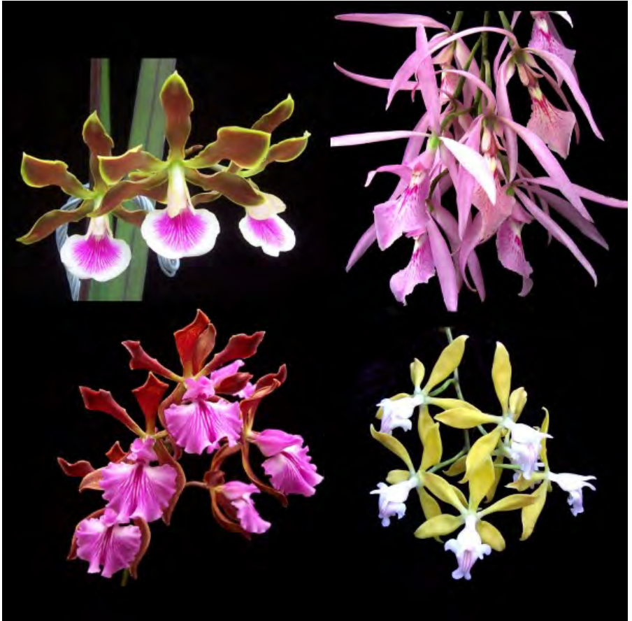
Clockwise from top left: Encyclia randii , Encyclia adenocaula , Encyclia phoenicea , Encyclia plicata variety alba .