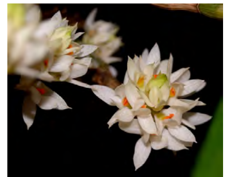
Dendrobium bracteosum – Nancy Newton and in memory of David Glass

This great Dendrobium species is a real treat, with masses of flowers that last in perfect condition 4 to 6 months, starting in late spring to summer when blooming orchids are needed! The color is variable and may be white or pink or various shades in between. A rare few are deep reddish purple. The one constant is that they always have a bright orange lip. Each flower is borne encased in a bract that persists and becomes the same color as the flowers, thus the species name. Flowering tends to start at the base of the plant because even small seedling growths less than an inch tall can bloom, and only growths about two years old or older tend to flower. Once the taller growths are a couple years old, they will also sprout flowers up and down the canes in future