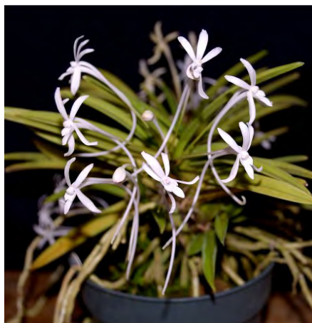
Vanda falcata 'Big Bluto,' AM/AOS

While merged into Vanda in 2012, this species does not