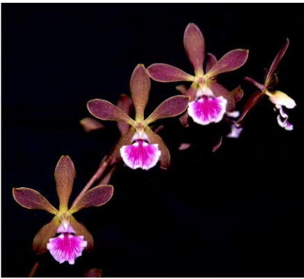
Encyclia Lorraine Smith – Carson Barnes

species, and what they lack in flower size, they more than make up for with quantity, variety, and in many cases fantastic fragrance. Their hard round to pear shaped pseudobulbs and stiff, heavy textured leaves are well suited to the high light conditions they prefer. Perfect drainage is essential for this group and most do best in baskets or on mounts. If potted, then clay is preferred, with large, open and fast draining medium. Encyclia tampensis ranges as far north as central Florida, and is therefore one of the most temperature tolerant species. At the other end of the vast range of the genus are species such as E. steinbachii from eastern Bolivia. In between these two, at least 180 additional species can be found, with enough variety to satisfy any serious collector. While most are quite adaptable to a range of conditions, the species found within the Amazon Basin, such as the magnificent E. randii , do better when kept above 60 degrees F, a temperature that would be equivalent to the record low for the region.