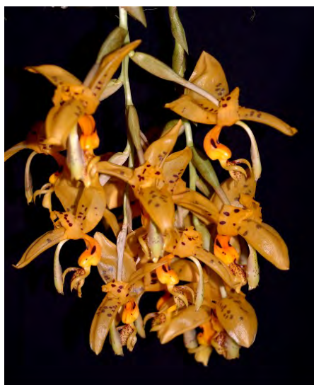
Stanhopea jenishiana

Several attractive hybrids have been made using this species,