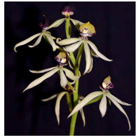
Prosthechea Green Hornet – Nancy Newton and in memory of David Glass

that are partially or fully leafless. Plants sometimes make more growth then blooms in one year, and then more blooms than growth in the next. The shiny leaves on the newer growths make a wonderful backdrop for the sparkling flowers.