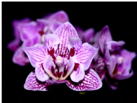
Phalaenopsis Bravo – Jason Mills & Ed Shoulta

This charming species with generous sized leaves and graceful spikes of not large, but colorful flowers comes from very shady and humid environments in Borneo and southern portions of the Philippines. Growing very