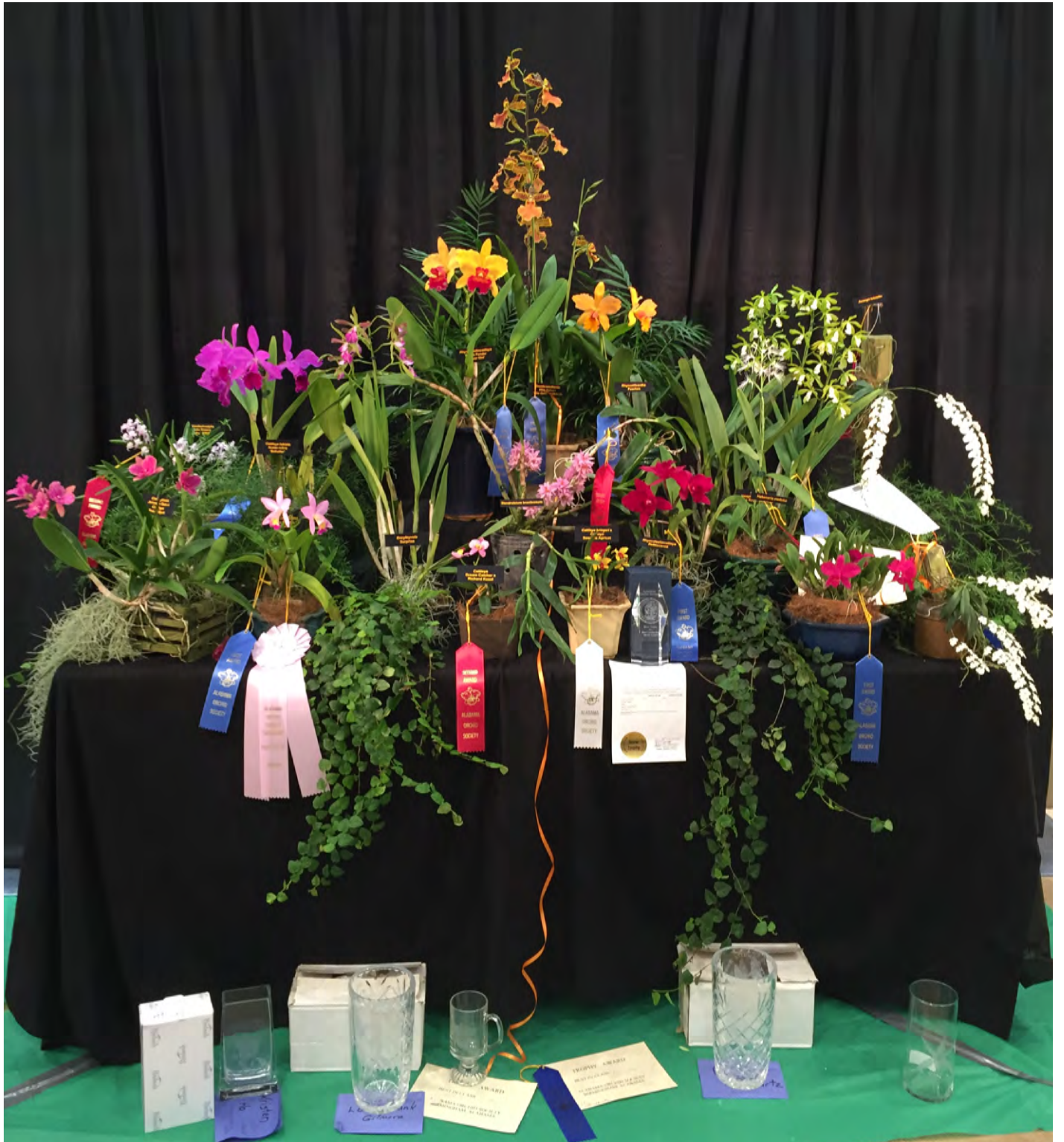
Marble Branch Farms' exhibit at the Birmingham Orchid Show