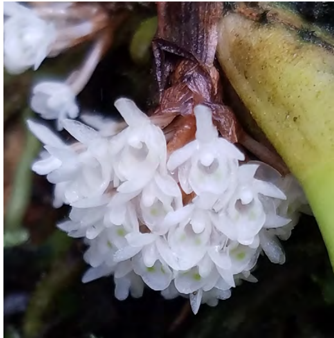
Close up view of Ancistrohynchus sp.