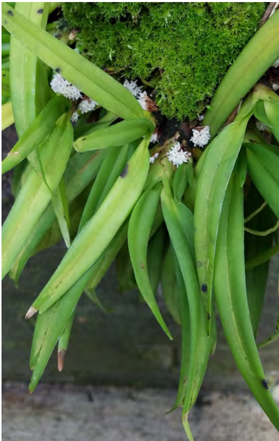
Ancistrohynchus sp., with view of the leaves