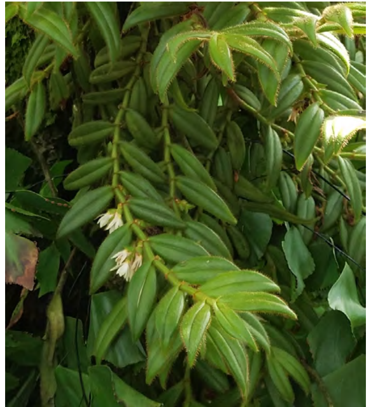
Eria sp., showing the leaves