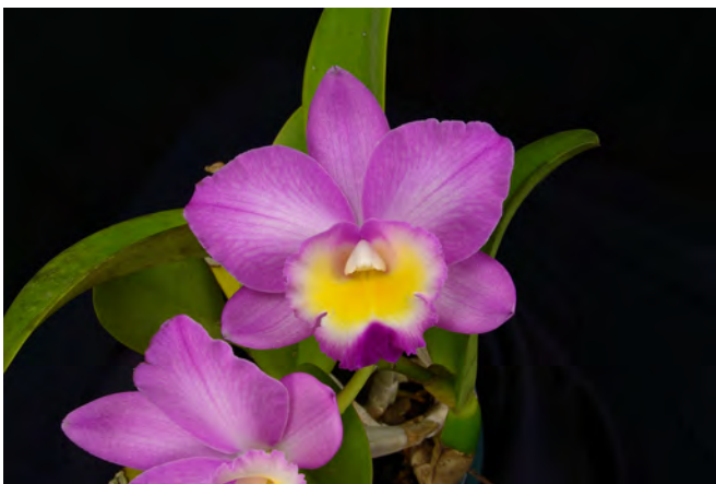
Rhyncatlaelia Rainbow White 'Yellow Bird', HCC/AOS, 77 pts. Exhibited by Fred Missbach