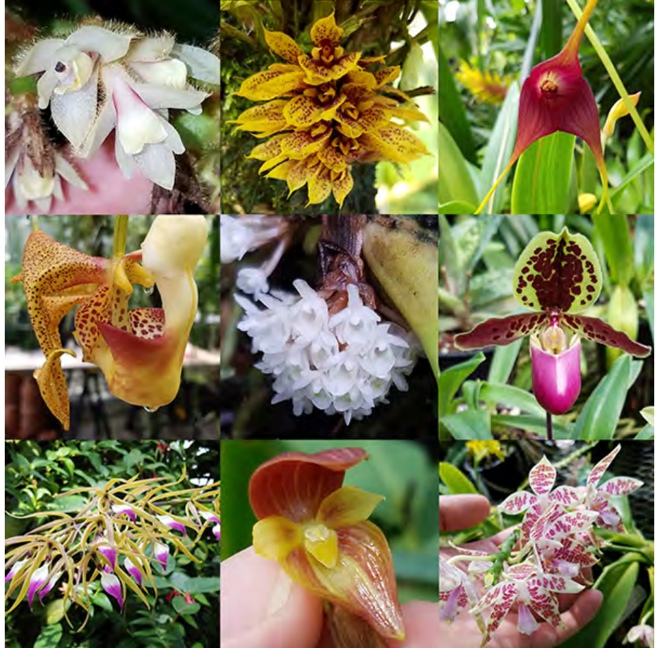
Just a sampling of some of the interesting orchid photos we have to share this month!