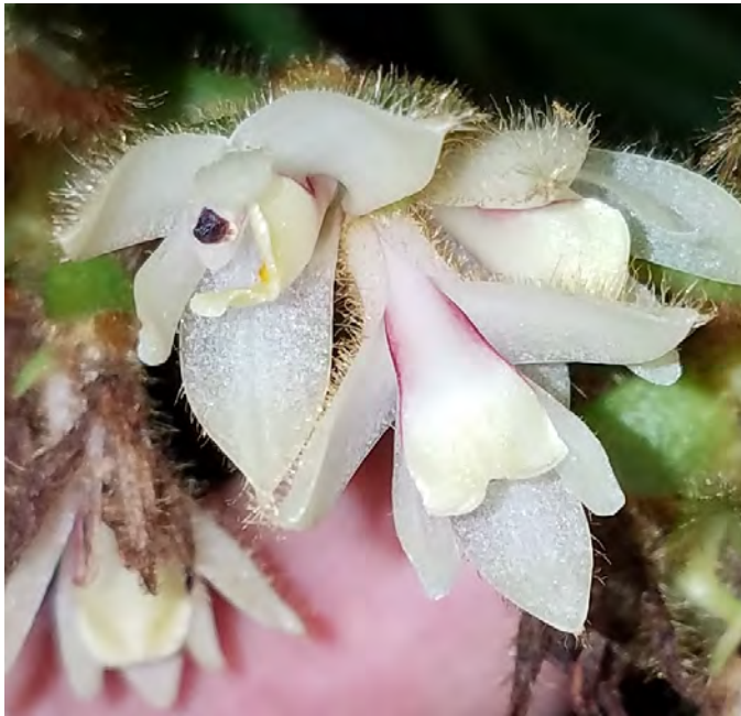
Close up view of Eria sp.