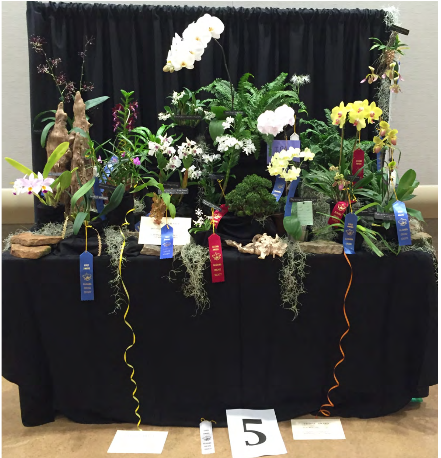
The Atlanta Orchid Society's exhibit at the Birmingham Orchid Show