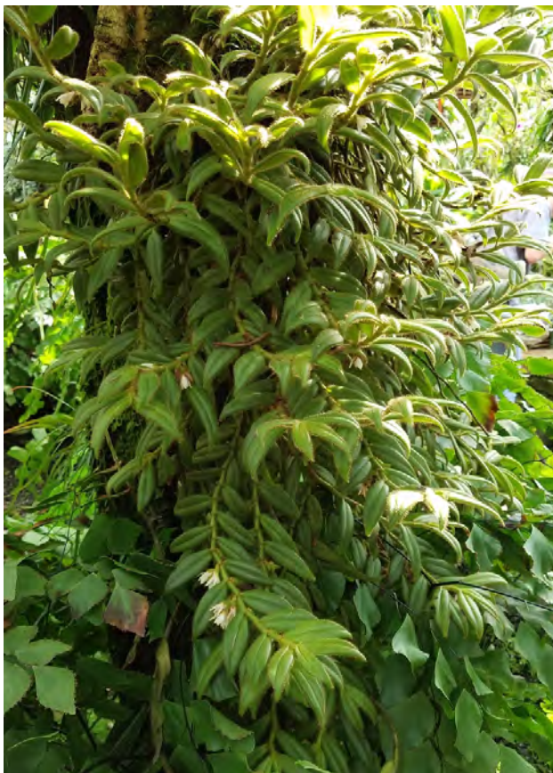
Eria sp., showing a larger view of the whole plant