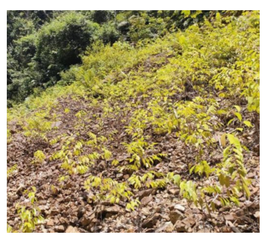
Fig. 2. A bed of Camphor Sapling Seedlings Under stands