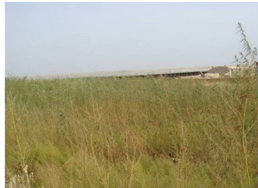
Fig.2 Successional Pioneer Species - Artemisia Scoparia in Jarud Banner