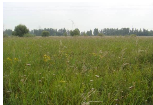
Fig.4 Enclosed Meadow in Horqin Left Back Banner