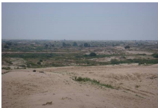
Fig.3 Desert Shrub Ground in Naiman Banner