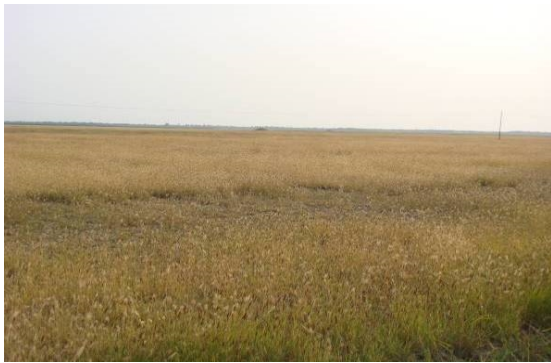
Fig.1 Chloris Virgata Community in Horqin Left Middle Banner

This study was made by taking comprehensive consideration into the soil texture, spatial layout, water condition and other factors, and 14 investigation points were selected from Xiliaohe Plain to conduct the investigation on the vegetation and underground depth. The investigation contents include the community type, community coverage, species composition, species richness, root depth, etc, with details shown in the table 1.