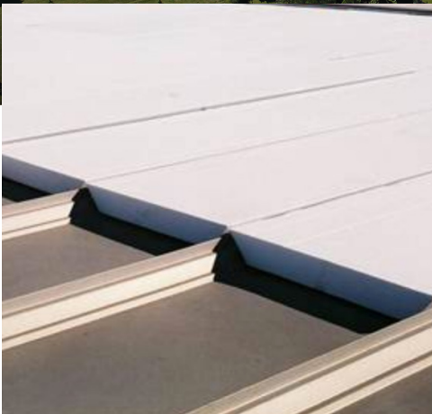
ThermalStar Flute Fill

Insulation is a vital component of a building's envelope. For building designers requiring the highest quality rigid insulation, ThermalStar ® Rigid Insulation provides unmatched quality, with a stable long term R-value that will last the lifetime of your structure. Manufactured under an industry leading quality control program monitored by UL and ICC-ES, ThermalStar Rigid Insulation meets or exceeds ASTM C578 standards, providing an HFC free, recyclable rigid insulation with a low Global Warming Potential (GWP).