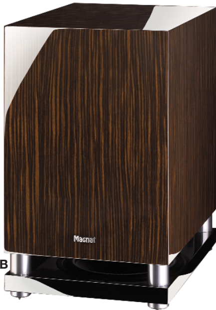
Omega SUB 250 LTD