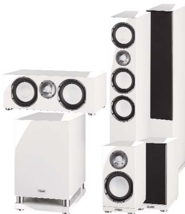
Quantum 800 Set white