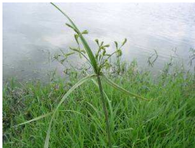
Fig. 2. Cyperus alopecuroides