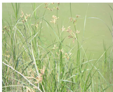
Fig. 11. Scirpus maritimus L.