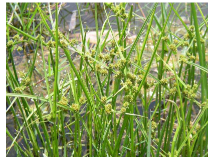
Fig. 3. Cyperus difformis