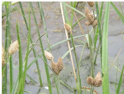
Fig. 1. Bolboschoenus affinis