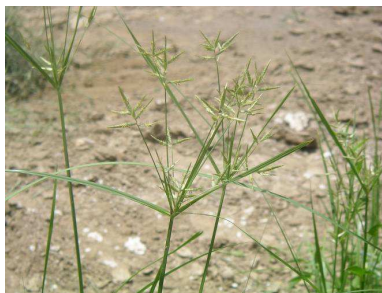
Fig. 5. Cyperus pygmaeus