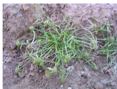
Fig. 6. Cyperus rotundus