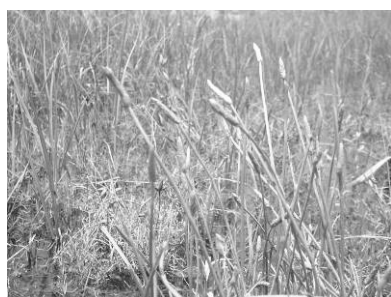
Fig. 7. Eleocharis palustris