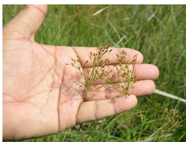
Fig. 8. Fimbristylis bisumbellata