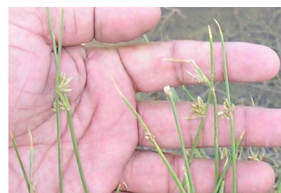
Fig. 9. Juncellus laevigatus