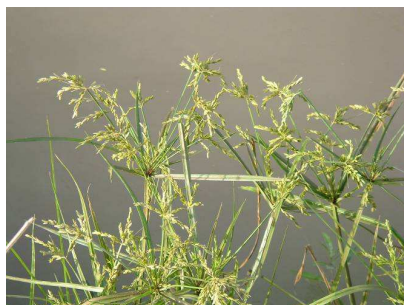
Fig. 4. Cyperus iria