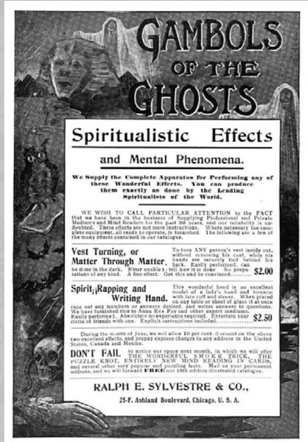
Photo: Ad for 'Gambols with the Ghosts' in a 1902 issue of "Suggestion"

Although there were people who genuinely believed they could communicate with spirits, there were also many frauds looking to make money off of the grief-stricken. On October 21, 1888, Maggie Fox – who, along with her sister, had ushered in the age of Spiritualism – confessed that they had faked the rappings and knockings by cracking their knuckles and the joints in their feet. A 1901 secret catalog called Gambols With The Ghosts was available to mediums and offered ghost figures, fake ectoplasm, self-playing guitars, and self-writing slates.