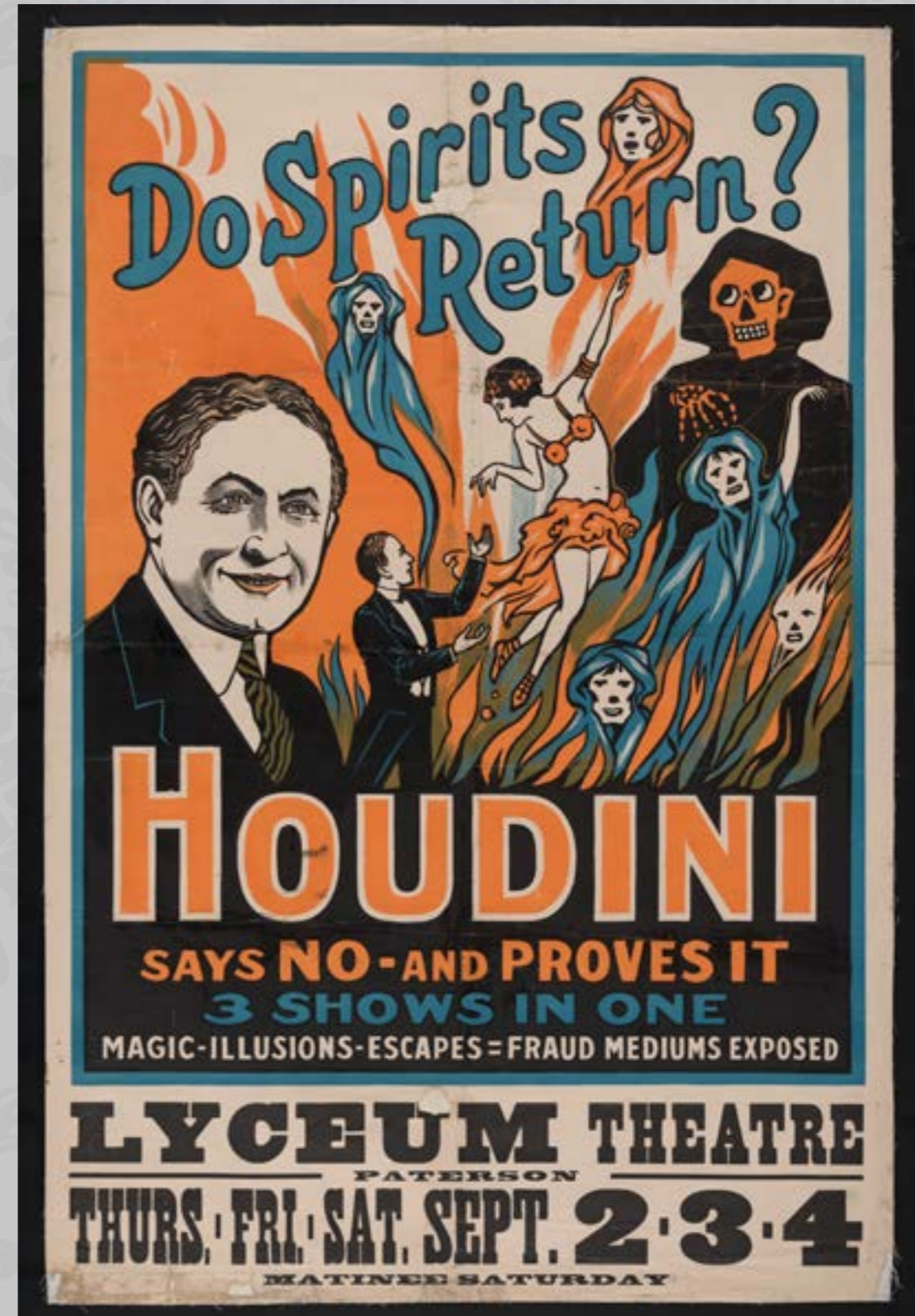
Photo: 'Do spirits return? Houdini says no – and proves it 3 shows in one: magic, illusions, escapes, fraud mediums exposed'

Spiritualism skeptics attempted to expose fake mediums. The world-famous magician, Harry Houdini, made it his life's work to expose the perpetrators of "this most monstrous fiction." Even though he always entered a séance with an open mind, Houdini declared, "after twenty-five years of ardent research and endeavor I declare that nothing has been revealed to convince me that intercommunication has been established between the Spirits of the departed and those still in the flesh."