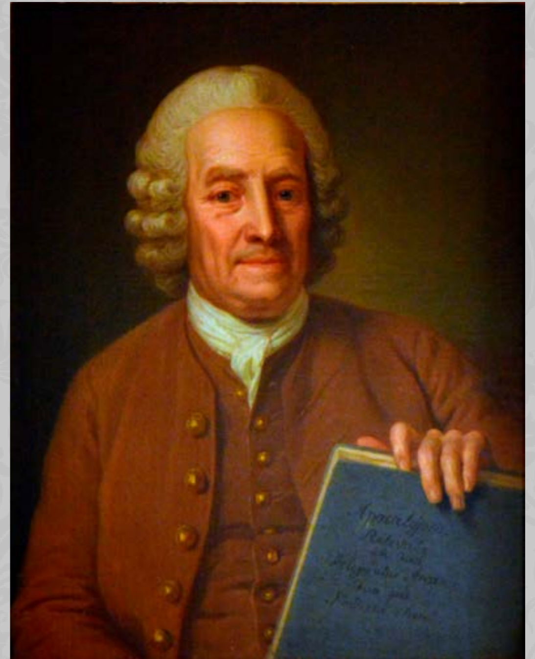
Photo: Emanuel Swedenborg portrait

Many gravitated towards Spiritualism because, like traditional religions, it believed in the immortality of the soul. Unlike traditional religions, it did not call for blind faith; skeptics could see concrete "proof" of an afterlife by attending a séance. Spiritualism also rebelled against traditional religious authority and, instead, emphasized "radical individualism". This individualistic outlook meant that Spiritualism was the sole religion of its time that saw women as equals.