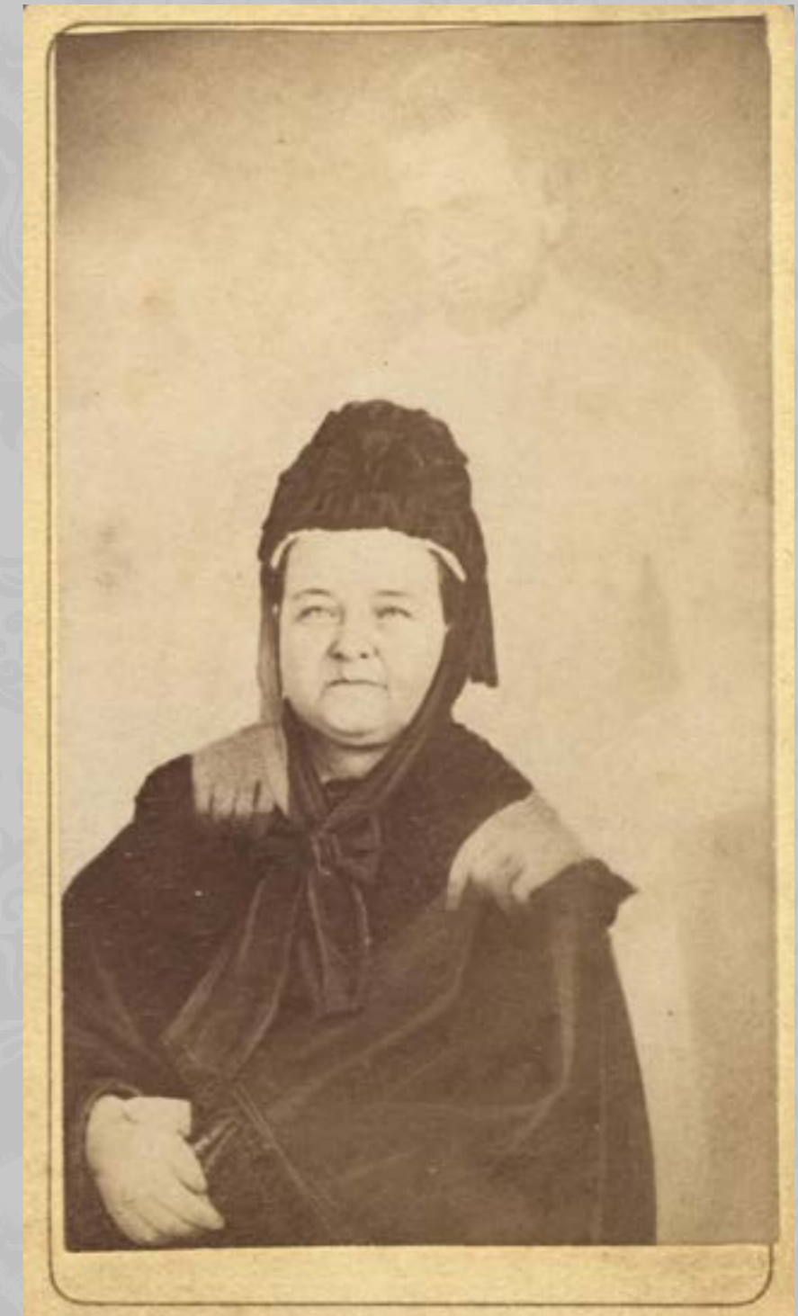
Photo: Mary Todd Lincoln with Abraham Lincoln's "spirit" by William H. Mumler, Lincoln Financial Foundation Collection

Mumler's most famous spirit photograph is of Mary Todd Lincoln. America's grieving First Lady had become heavily involved in Spiritualism after the deaths of her son and her husband. She regularly attended séances, hoping to receive a message from them. In 1872, Mrs. Lincoln visited Mumler's studio in Boston. In the resulting photograph, the ghostly specter of Abraham Lincoln appears behind his wife, resting his hands on her shoulders. It was the last photograph ever taken of Mrs. Lincoln.