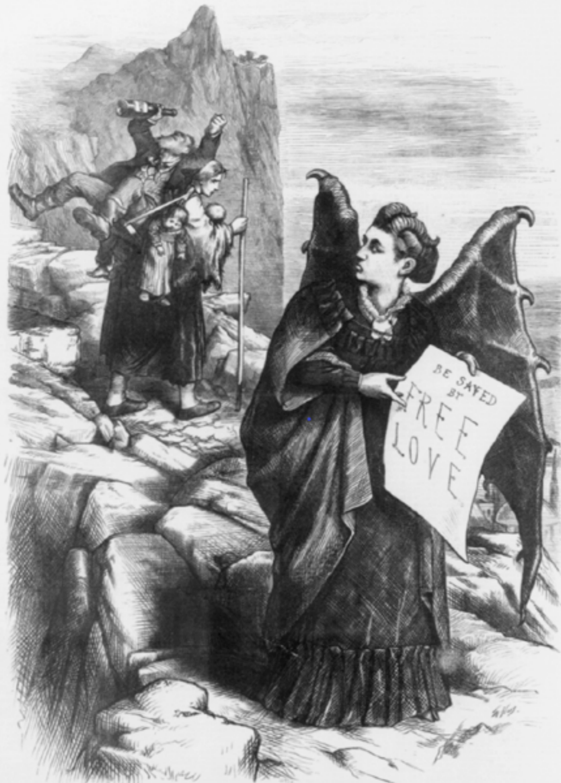
"GET THEE BEHIND ME, (MRS.) SATAN!"—[See Page 145.] Wife (with heavy burden), "I'D RATHER TRAVEL THE HARDEST PATH OF MATRIMONY THAN FOLLOW YOUR FOOTSTEPS."

For a time, Spiritualism was the only way women were allowed to speak in public. Female mediums used this as a way to champion the ideas of women's suffrage, equal rights, and the abolition of slavery, claiming that these weren't their ideas, but rather messages from the "spirit realm." This did not, however, stop the criticism and condemnation of female spiritualists. One such example was Victoria Woodhull, a vocal spiritualist and the first woman to run for president. She was dubbed "Mrs. Satan" for her belief in Spiritualism, suffrage, and the ideas of free love, all of which were seen as a threat to traditional morals.