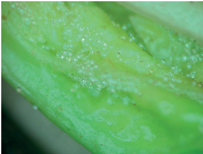
Figure 4: Spinach mite eggs inside folded young leaves, USA