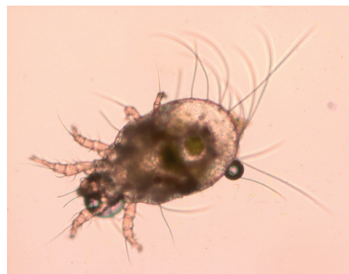
Figure 3: Adult spinach crown mite showing setae on the posterior end, USA.