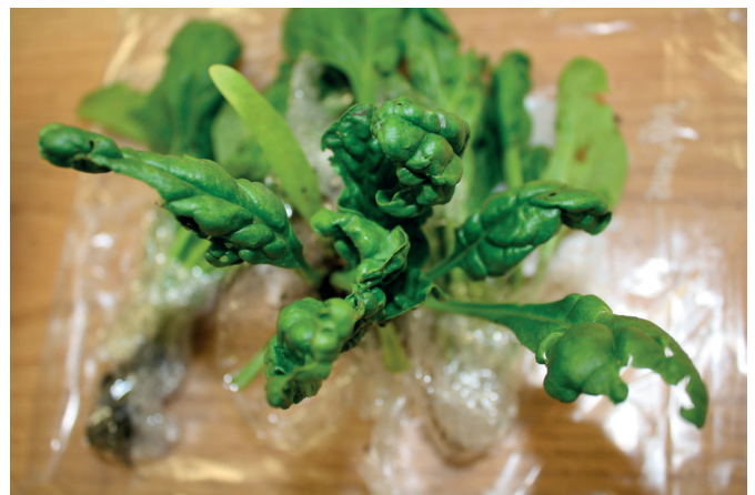
Figure 6: Spinach leaves damaged by crown mite feeding

Bio-mitocides may provide some preventative control, but this has not been confirmed. A bio-miticide based on Beauveria bassiana (strain ATCC 74040) has been trialled on spinach in Italy, and was applied to the soil (Sannino et. al., 2016, Abstract). This type of product requires consideration of the stage of pest (e.g. it may be only effective on early life stages of mites), compatibility with fungicides and of humidity (humidity may influence effectiveness).