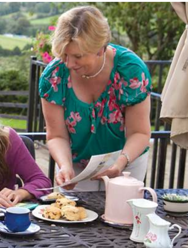
Where stays become memories.

As well as the cosy vibe in each B&B, services such as Wi-Fi connections are also available. Every B&B is classified according to a star rating system, from approved to three-star, four-star and five-star. As the ratings go up you'll be treated to larger rooms, more facilities and a wider range of