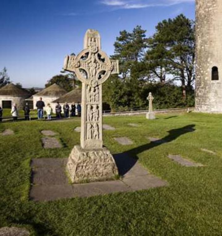
Clonmacnoise, Co. Offaly