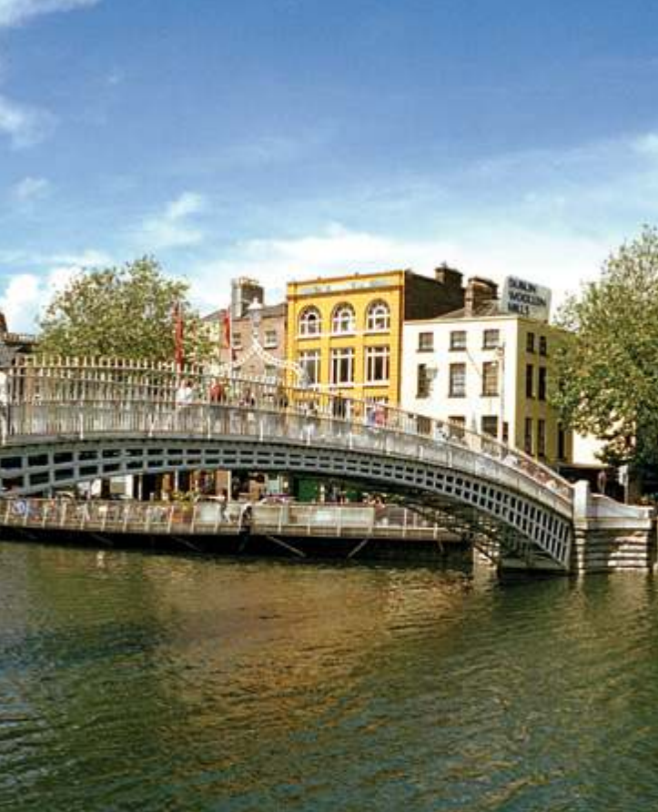
Ha'penny Bridge, Dublin