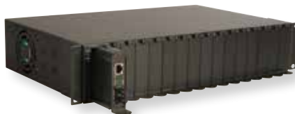
Media Converter 19" 2U Rack Chassis, 6 Slots Model# EIS-RACK-16

Desk or wall mount as stand-alone products or install into available 19-inch rack chassis system. The chassis system supports hot-swap installation of media converters, Ethernet extenders, and redundant power supplies to power up to 16 media converters and extenders.