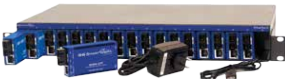
18-slot chassis, -20°C to +70°C, AC power Model# IE-POWERTRAY/18-AC

The IE-PowerTray/18-AC can be rack-mounted into standard 19" equipment racks and features extended temperature operation and an internal AC power supply (included).