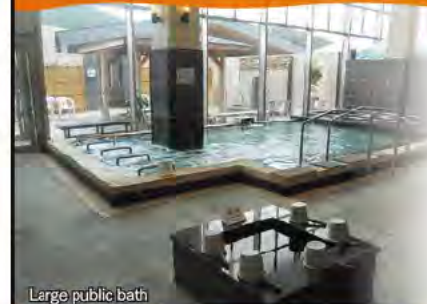
Large public bath