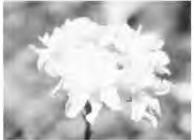
R. canescens 'White Flakes'.