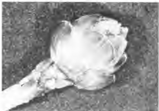
R. vaseyi .

The main thing troubling garden folks is that we are hard to identify. Right? Well, some folks have special features of anatomy they like to observe. With Natives, you've got to take in our complete morphological features, such as: floral buds, color and shape of flowers, season of bloom, length of tubes, and the presence or absence of pubescense—glandular setae, bristles, hairs (botanists use a formal term trichome)—on our leaves, flower tubes, lobes, and stems. And if that is not enough, you need to know whether we are