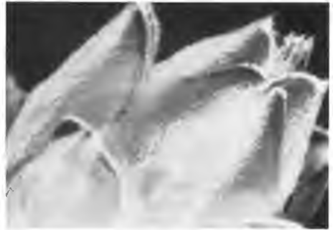
R. canescens .

fragrant or not. We species can be identified by using some of those fancy keys that folks make. They are tricky to use, and by golly, our beautiful natural hybrids will give you fits, 'cause we don't follow the keys with all our different features.