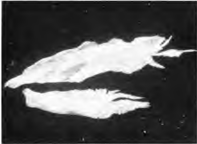
Seed of R. calendulaceum .

It's true, you must remember all of these special and neat features for the species and cast them to the wind when you meet some of our beautiful natural hybrids. Oh, we know there are some folks, who on spotting a hybrid will try to give our parentage. Do they really know or are they just guessing? With some study, one can often guess if only two species are involved. However, remember we have been integrating for many years, and when three or four of us are in the same woodland flowering at the same time we can have great fun in swapping genes. Then, when you come in and hand pollinate us—Wow! All rules are broken.