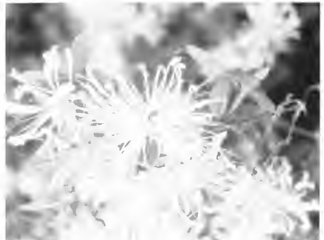
R. flammeum 'Chattahoochee'.

Now—the luck of the collector. In 1965, over a 1,000 acres of land were clear cut and bulldozed west of Atlanta, Georgia, near the Chattahoochee River for a new Southwest Industrial Park. Callaway Gardens was alerted and collected over 500 dormant plants from the area. Unfortunately the site had never been explored in the flowering season. Mrs. Norma Seiferle, an active botanist from Atlanta, later collected 12 dormant plants at random from the same area and planted them at her home. Three plants planted together (and again collected at random) had pink flowers with thin narrow split petals. The other nine plants were planted in other sections of the garden and had typical tubular pink to yellowish pink flowers of hybrid origin. One of the split