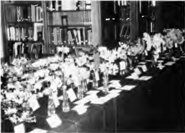
The ninth Brookside Gardens Chapter azalea flower show, "Azaleas—A Capital Idea" at the Landon School Buchanan library.