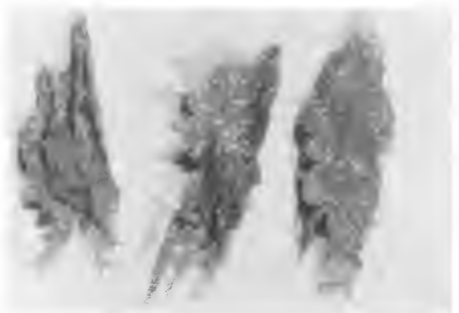
Seeds of R. bakeri .