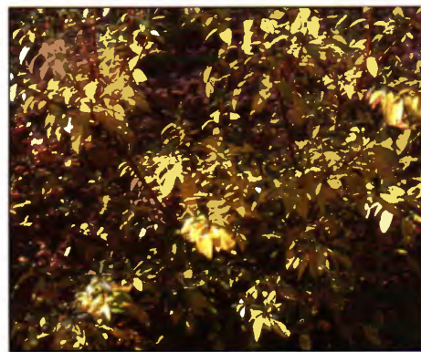
‘Oriflamme’ turns a warm yellow in the fall.

I will end with the 1980 ASA “eye-catcher/good-doer” poll of the Glenn Dale hybrids from 100 growers in 20 states that was printed in the April