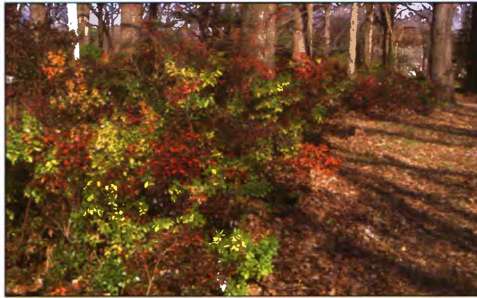
Part of Boxlee's azalea garden's fall color show.

So, with the Glenn Dales acquired from Frank White and the Ten Oaks, plus others, I was off to a good start in collecting and growing Glenn Dales. I confess I am a soft touch for almost any interesting azaleas. For example, strap-shaped flower forms such as the purple 'Seigai'; or the red 'Kin-no-sai' (syn. 'Polypetalum', a