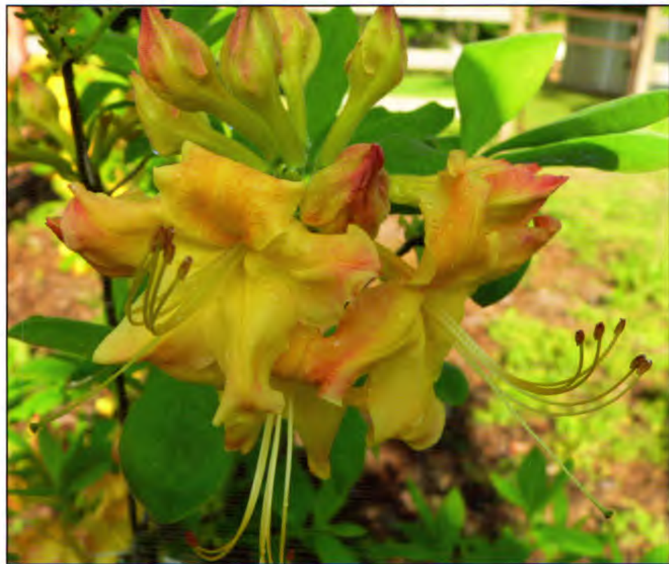
▼ SW 51—'Ilam Persian Melon' x 167S x 'Seashell'