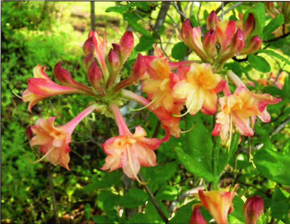
▲ SW 54— R. speciosum HIH