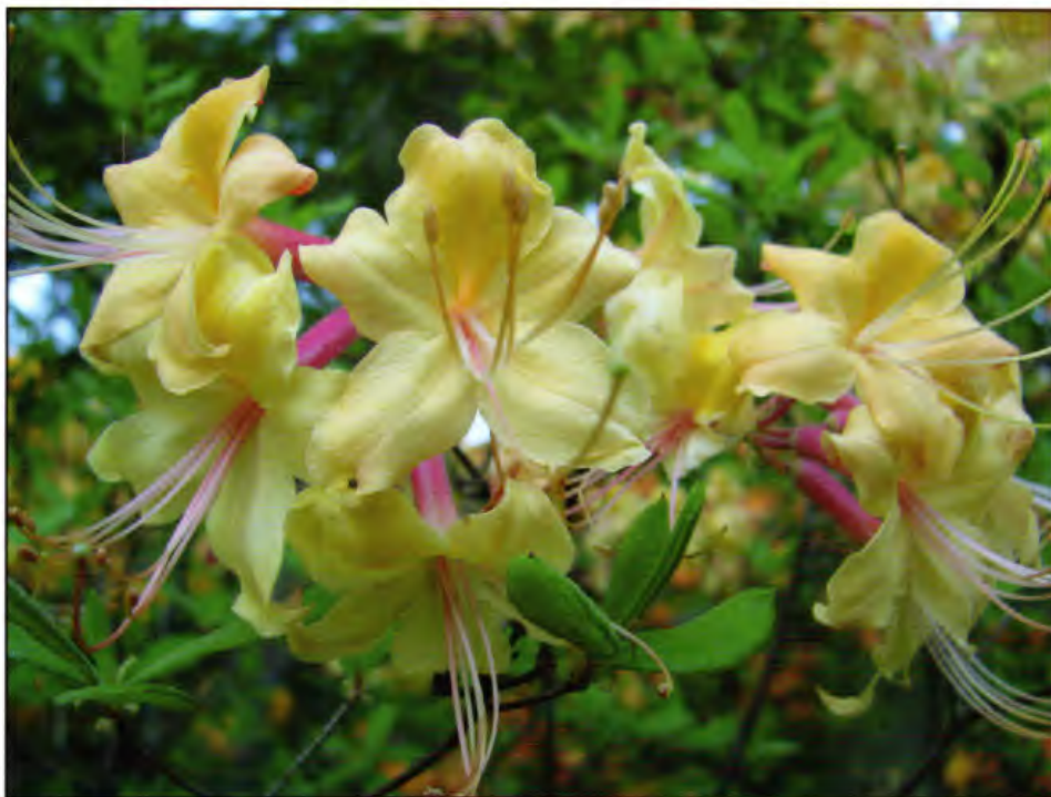
▲ R. austrinum x R. atlanticum x R. austrinum