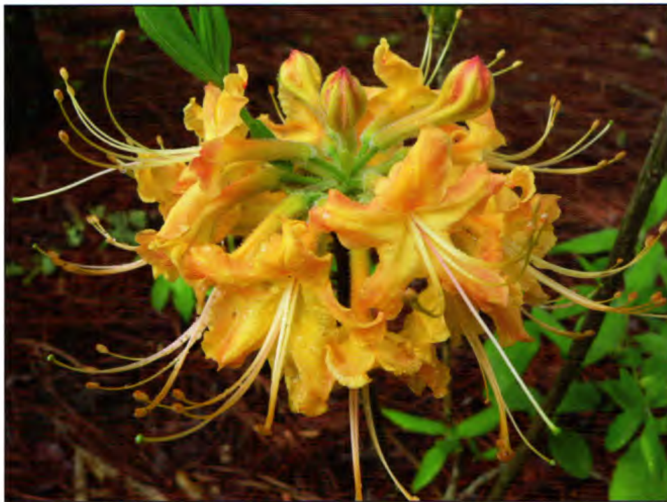
▲ Yellow seedling growing in the woods.

To appreciate the collection, one must understand Kelly Strickland.