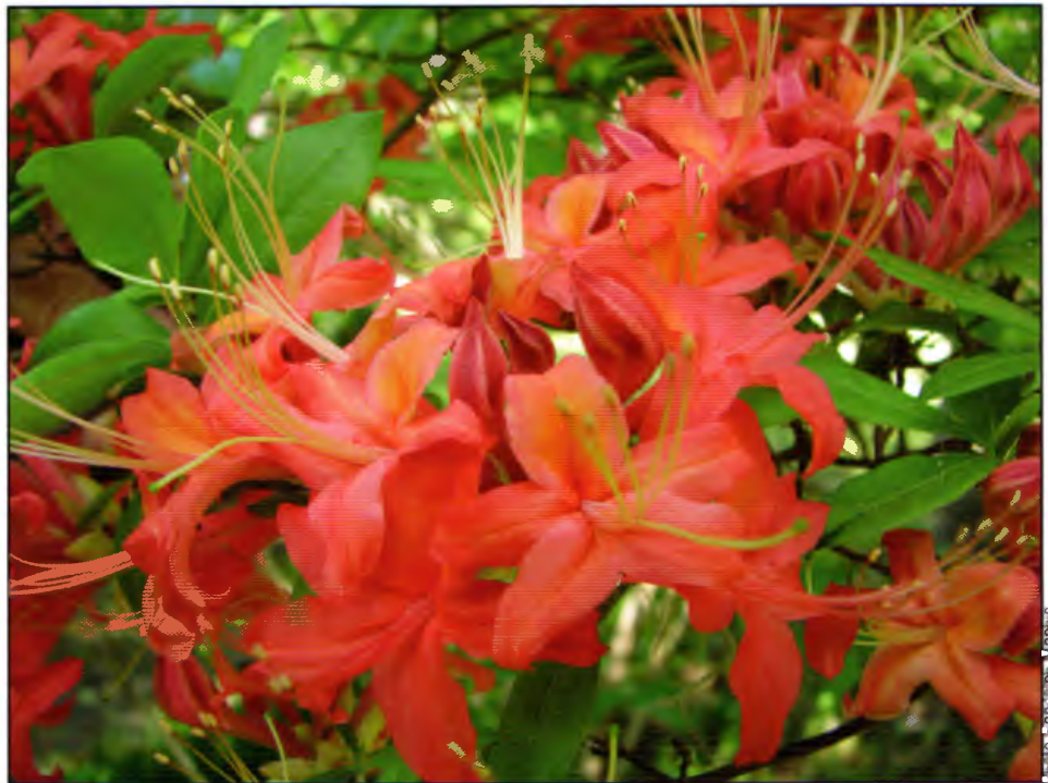
▼ Speciosum Pinkish Red