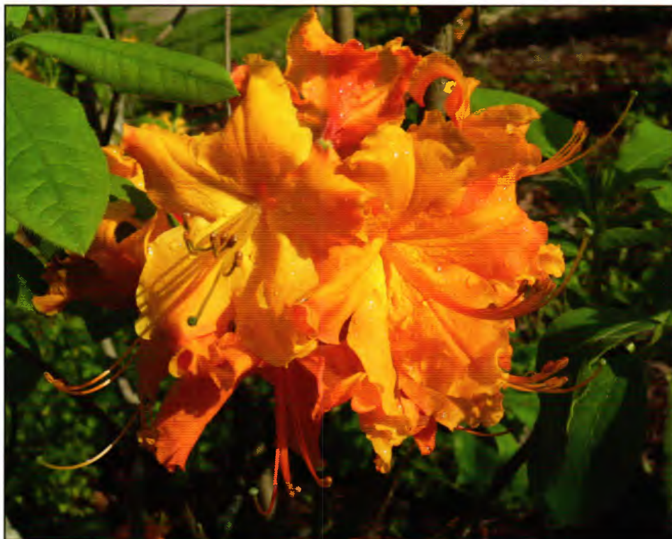
▼ SW 41—'Ilam Persian Melon' x 167S x 'Old Gold'