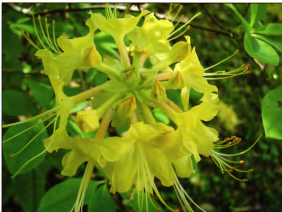
▼ R. austrinum 'Yellow River Alabama'

planted with the result of these first-generation crosses, and Kelly wanted to continue to make more crosses to expand the range, flower size, color, and hardiness of deciduous azaleas for the Deep South.