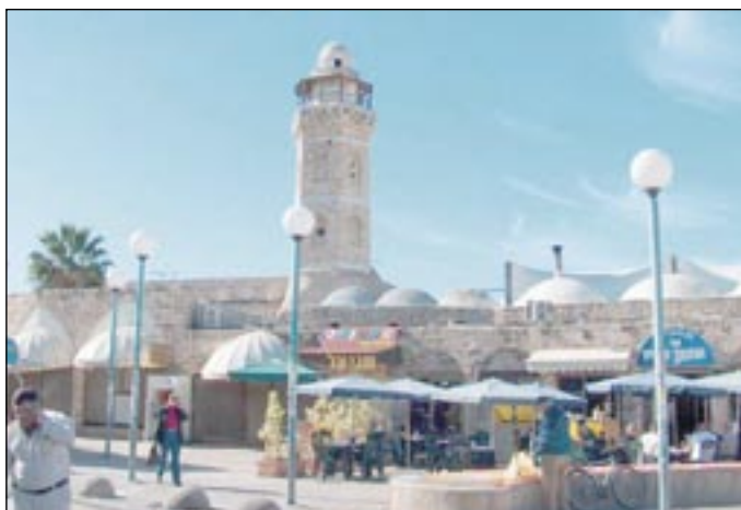
Great mosque in the depopulated town of Al-Majdal