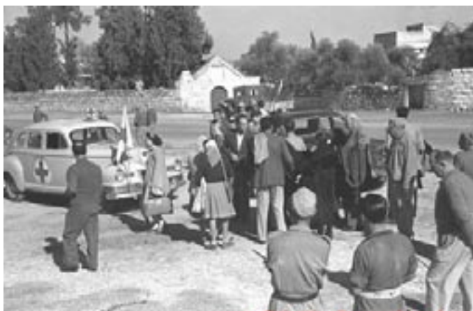
Al-Ramleh: A Palestinian Arab gathering in Al-Ramleh, before being forcibly displaced in 1948

On 11 november 1963 an old airplane landed on Schiphol Airport in Amsterdam. On board the plane that arrived from Amman were 65 young Palestinians from Nablus. The young men were contracted by Romi, a Dutch company specialised in refining vegetable oils. Most of the men were working at The Jordan Vegetable Oil Industries in Nablus. With the help of Dutch experts the company made a restart and in order to educate the young workers, they would work in the Netherlands for two years and then go back to Palestine. The Netherlands was experiencing a shortage of workers at the time. Two years later, in a letter to the Dutch Ministry of Foreign Affairs asking permission to extend their work permits, the CEO of Romi said that the company would go bankrupt if the Palestinians would not be allowed to stay for another two years. In 1965 their contract was extended for another two years until November 1967.