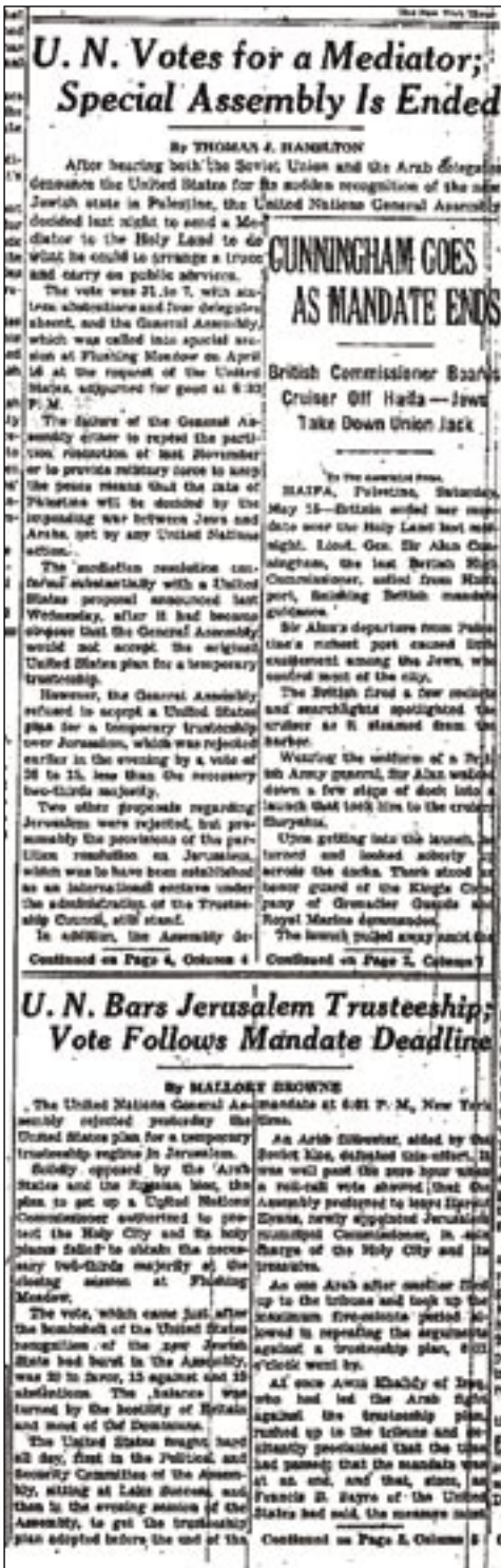
From the front page of The New York Times, 15 May 1948.

In September 1947, the UN Special Committee on Palestine (UNSCOP) presented its final report which included a majority proposal and a minority proposal, because Committee members had been unable to reach a consensus on the future status of the country. 20 The majority of the Committee members supported the partition of Palestine into two states, one Arab and the other Jewish, although they conceded that “[w]ith regard to the principle of self-determination, although international recognition was extended to this principle at the end of the First World War and it was adhered to with regard to the other Arab territories, at the time of the creation of the “A” Mandates, it was not applied to Palestine, obviously because of the intention to make possible the creation of a Jewish National Home there. Actually, it may well be said that the Jewish National Home and the sui generis Mandate for Palestine run counter to that principle.” 20