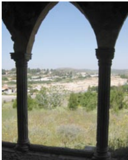
Depopulated village of Beit Nattif, 2007.