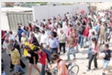
Land Day demonstration in Jaffa, March 29, 2008

Over 500 Arab Palestinian families of Jaffa currently face eviction at the hands of Israeli authorities who also plan to confiscate half the land of Jaffa's historic Tasso Cemetery. A major campaign to defend these families' right to stay in their homes and against the Judaization of Jaffa is underway. You can learn more at: http://yaffastruggle.wordpress.com