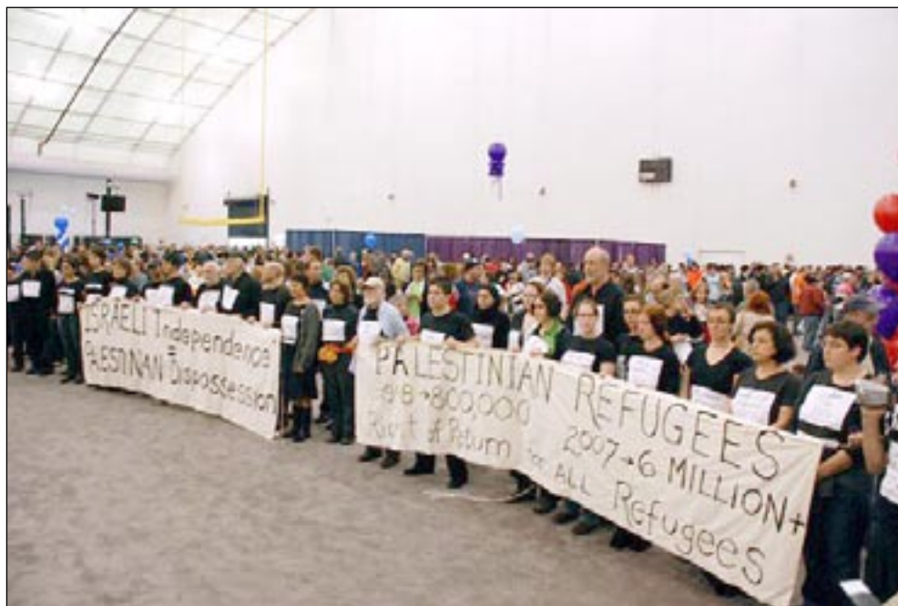
Washington DC rally - 10 June 2007. (@al-awda.org)

When the first news came from Tunis and Tel-Aviv in early September 1993 about the secret talks between the PLO and the Israeli government, the people of Palestine inside and in the exile were torn between enthusiasm and optimism on the one hand, and doubt and skepticism on the other. “Let’s wait and see”, said many then.