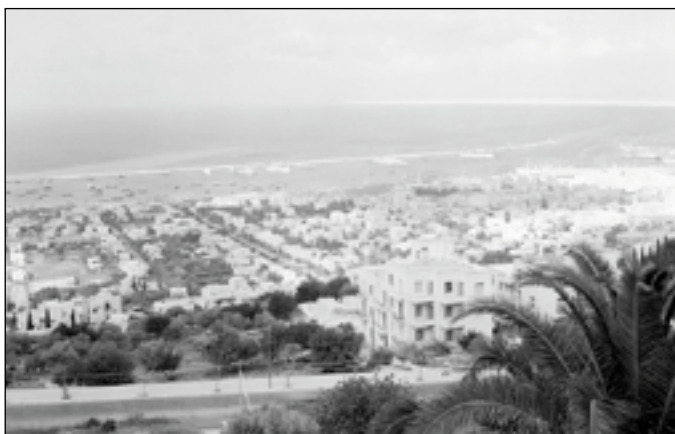
General view of Haifa in 1935.