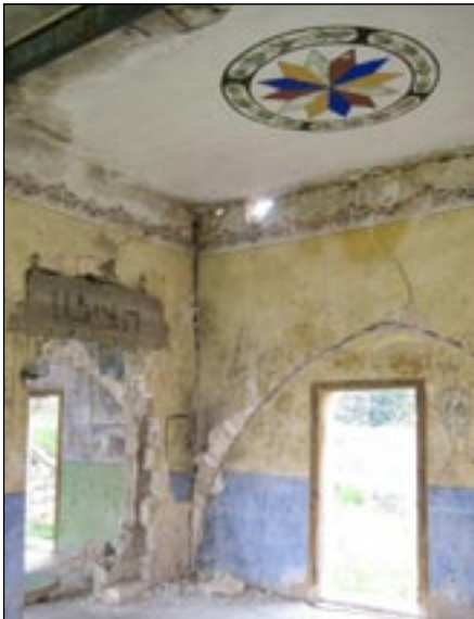
Colours of wall paintings still remain on the one house left partially standing in the village, Beit Afifi.

visiting, let alone returning, to their lands and villages. One Nakba Day visit, internally displaced villagers of al-Nahr found a locked gate and soldiers barring their way.