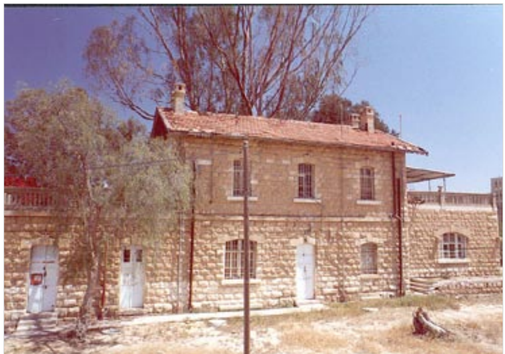
Train station in Bir Saba.

Socially, one of the main impacts of the Nakba is that the differences between people from different villages and towns melted away. In many places, marriage used to take place only within the same clan or village. Nowadays people marry their daughters to people from distant places and clans. The Nakba also changed our professions. We were land owners and farmers. We were less educated then. Now we work as teachers, doctors, engineers, mechanics, nurses, social workers, and builders. We changed our professions because we were forced to, in order to adapt to the new living conditions associated with our situation as refugees in Gaza.