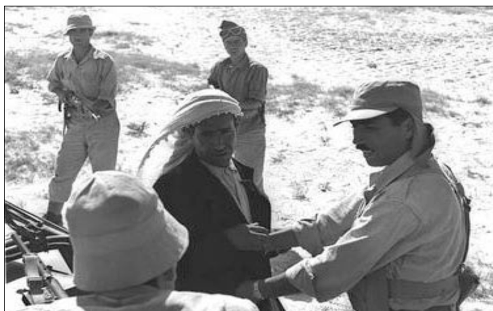
"Infiltrator" Refugee returning home, but arrested and searched by Israeli forces, 1954.

Note: there is no single authoritative source for the exact number of Palestinian forcibly displaced since 1948, or for the exact amount of land expropriated from Palestinians by Israel since 1948. The figures above are based on available data and estimates. For a more detailed analysis of these figures and comprehensive references, see: Survey of Palestinian Refugees and Internally Displaced Persons 2006-7, BADIL Resource Center.