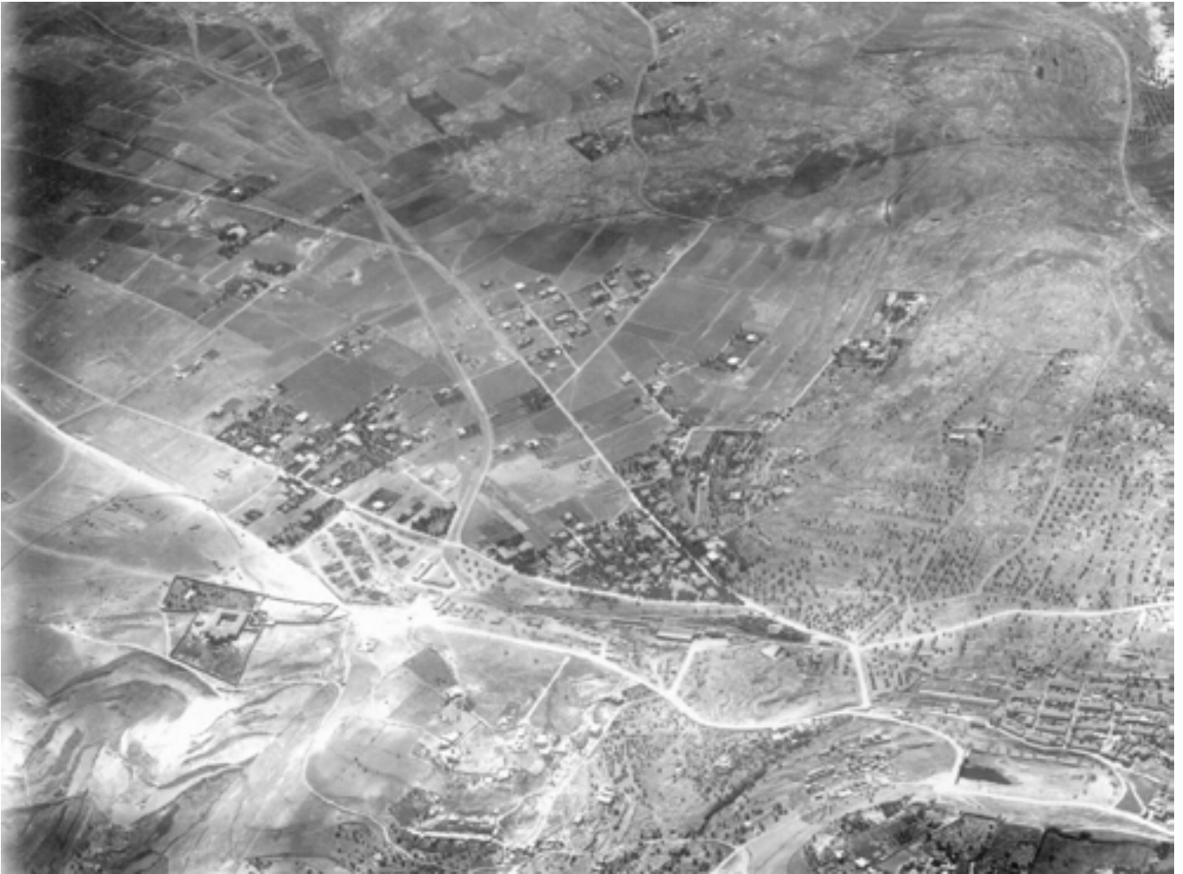
Aerial view of Al-Bakaa neighborhood in Jerusalem.