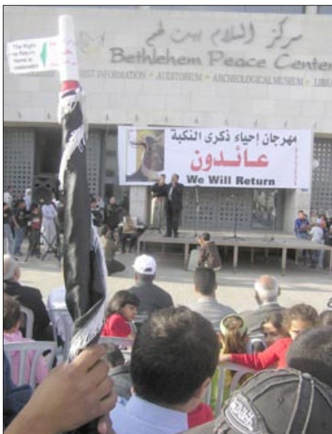
Nakba 59 th Commemoration, Bethlehem 14 May 2007.

the conflict, and that the future of the large majority of the Palestinian people who are refugees was uncertain.