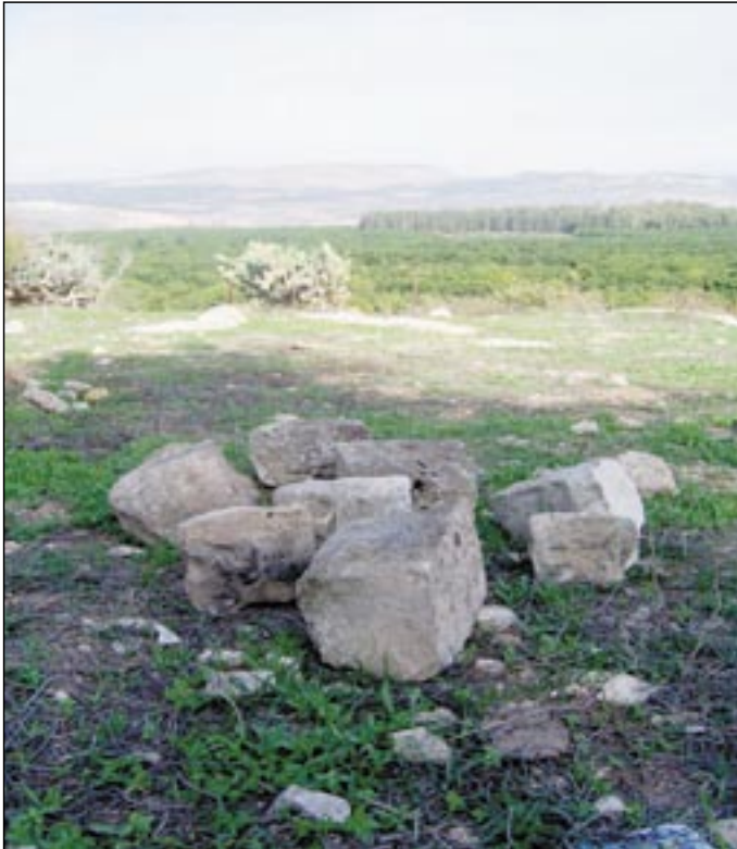
Land of Al-Damoun in 2005.

Al-Damoun Demoralized by the fall of the nearby city of Akka, many of Al-Damoun's villagers fled their homes when the Sheva' (Seventh) Brigade of the Israeli army began its artillery assault on the village. The assault came as part of Operation Dekel in mid-July 1948. The village was completely razed to the ground after its occupation, and while its lands have not been used for any significant Israeli settlement, part of the village's lands are used for agriculture by the nearby settlement of Yas'ur (built on the lands of the neighboring destroyed village of Al-Birwa).