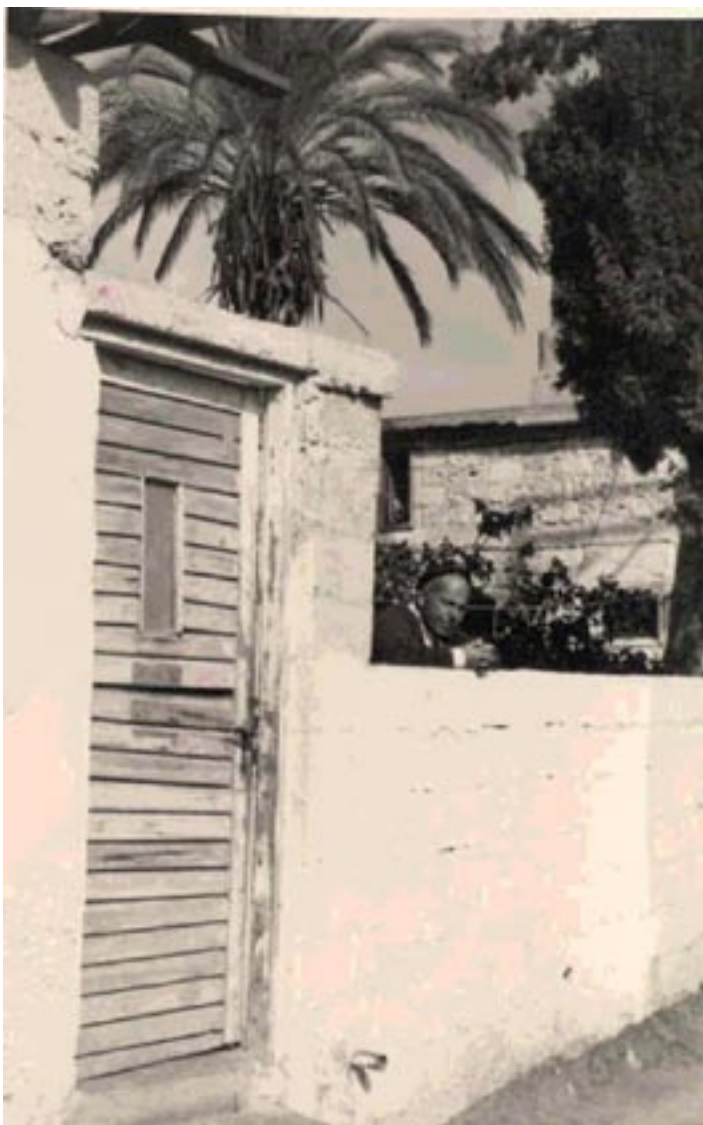
Remnants of al-Majdal