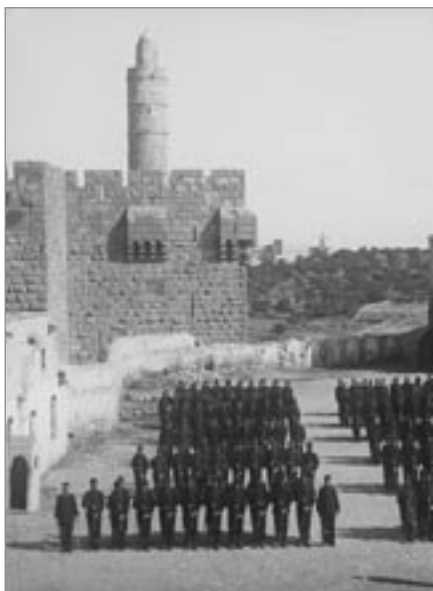
British military ceremony marking the conquest of Jerusalem, 15 December 1917.

Contrary to conventional wisdom, the Palestinian refugee question is not primarily a result of armed conflicts, but rather the outcome of a protracted and ongoing process of colonization and forced population transfer (ethnic cleansing). The latter is defined by the United Nations as the “ systematic, coercive and deliberate ... movement of population into or out of an area ... with the effect or purpose of altering the demographic composition of a territory, particularly when that ideology or policy asserts the dominance of a certain group over another ” [emphasis added]. Forced population transfer constitutes a war crime and a crime against humanity under modern international law. 2