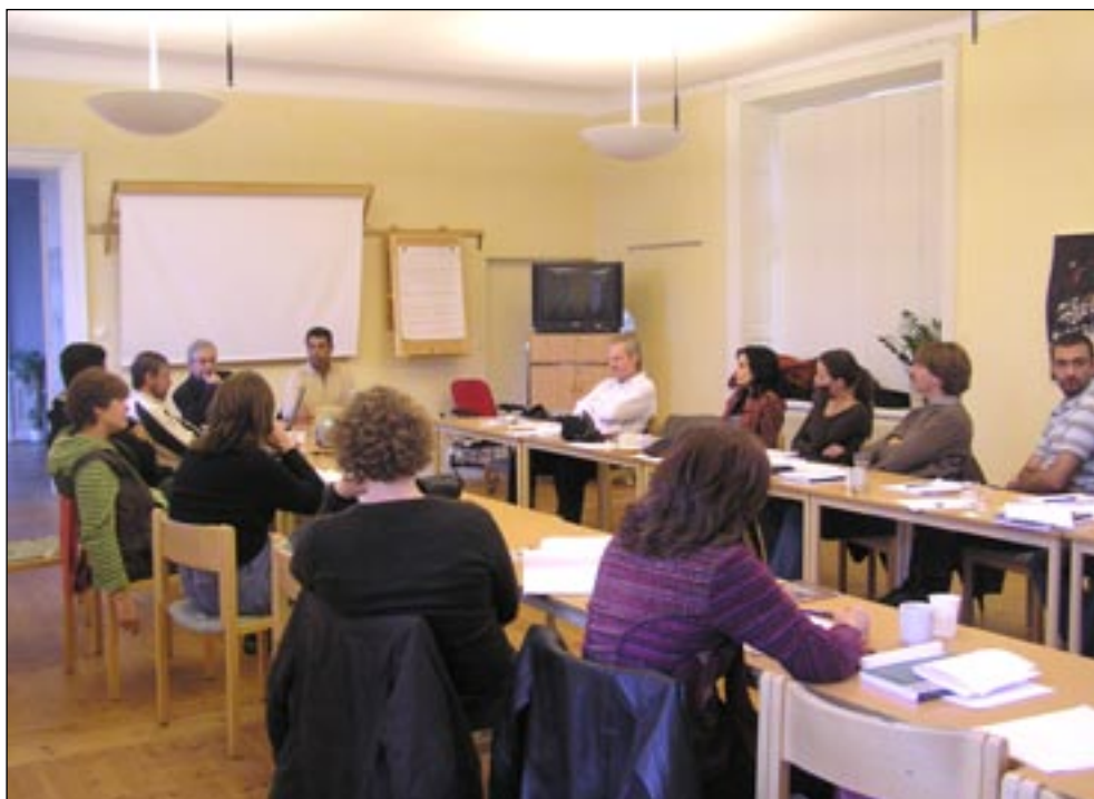
Badil Legal Support Network Conference – Uppsala, Sweden, November 2007.