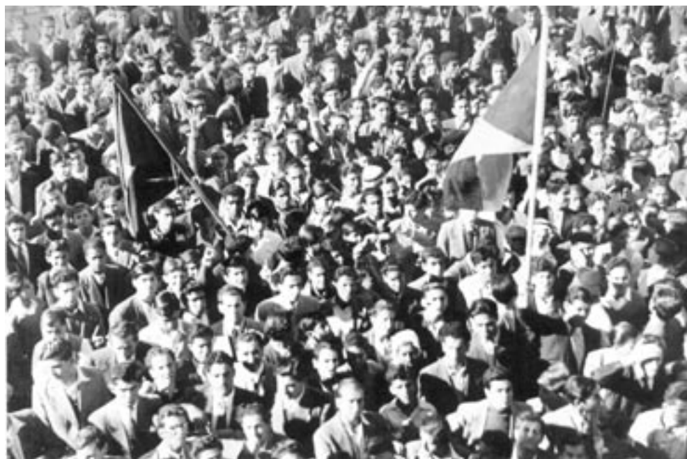
Palestinian students protesting UN partition plan, 12 March 1947.

The United Nations took up the “Question of Palestine” in 1947, when the atrocities of the Nazi regime and World War II had given rise to new international legal norms that were binding for states. The UN Charter, for example, prohibits the use of force in inter-state relations 18 , including the aquisition of territory by force, and provides for the right of nations to self-determination. The United Nations, however, sidelined the right to self-determination of the Arab majority and prevented de-colonization of Palestine, in clear knowledge of the likely disastrous consequences for the Arab people of Palestine, the people of the region, and international peace and security.