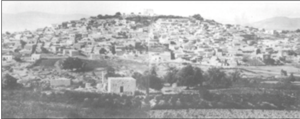
Saffuriyya in the 1940s.