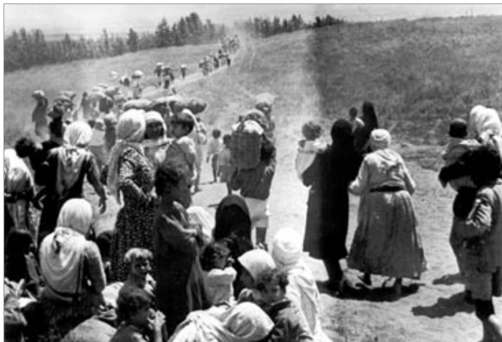
Palestinians fleeing the the war near Tulkarem in 1948.

including UN General Assembly Resolution 194 (11 December 1948), which affirmed Palestinian refugees’ right of return to their homes and properties and established the UN Conciliation Commission for Palestine (UNCCP). The latter was mandated to ensure protection, including durable solutions, for Palestinian refugees in accordance with UNGAR 194 and facilitate a peace agreement between Arab states and Israel. None of these measures, however, were able to prevent or reverse Palestinian displacement.