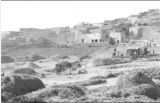
Depopulated village of Al-Nahr.

Al-Nahr. Fourteen kilometers north-east of Akka stands a tall palm tree on the site of what was once the small village of Al-Nahr. Nearby one can see the remains of two of the village houses, a grave that was part of the village cemetery, and the cactus and fig trees that remind the passerby that Palestinians lived here. Al-Nahr ( the river ), together with its twin village Al-Tall ( the hill ) and several other villages in the area were destroyed and depopulated on 20-21 May 1948 in the second phase of Operation Ben-Ami. According to Israeli historian Benny Morris, the commander of the Carmeli Brigade that executed this operation ordered his battalion commanders to "attack in order to conquer, to kill among the men, to destroy and burn the villages of Al-Kabri, Umm al-Faraj and Al-Nahr". According to Morris, this razing of the villages was done "both to punish the villagers... and to make sure the villagers could and would never return." [Morris (1987), The Birth of the Palestinian Refugee Problem, 1947-1949 . Cambridge Univ. Press, p.125]