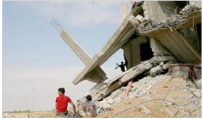
Mass house demolition in Rafah, Gaza 2004.

I studied English in India. I chose this profession because of the job market. There has been a need for English teachers in Gaza. I worked for the armed forces for a while as a translator but I did not like it. I felt that teaching at university is better and more rewarding in terms of academic status and professional development. Currently I am working at Al-Aqsa University as a full time lecturer. I live in Shabara refugee camp in Rafah. I live there because it is the place my parents came as refugees 60 years ago.