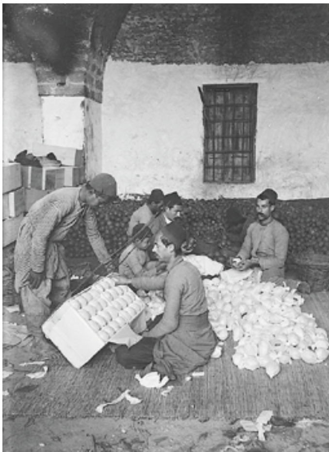
Orange harvest being prepared for sale in Yaffa.