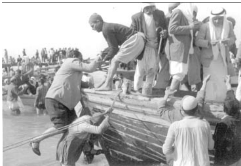
Palestinians fleeing the Gaza Strip in small fishing boats in the 1950s. Refugees from all over Palestine gathered in the Gaza Strip in 1948; many tried to continue their journey via two routes: a 200 mile desert track through the Sinai to Cairo, and the Mediterranean Sea. Both routes were cut off as a result of the 1967 Israeli occupation.

Rather than holding Israel to account, the international community led by the Quartet (United States, EU, Russia and the United Nations) has imposed sanctions against the occupied Palestinians since 2006.