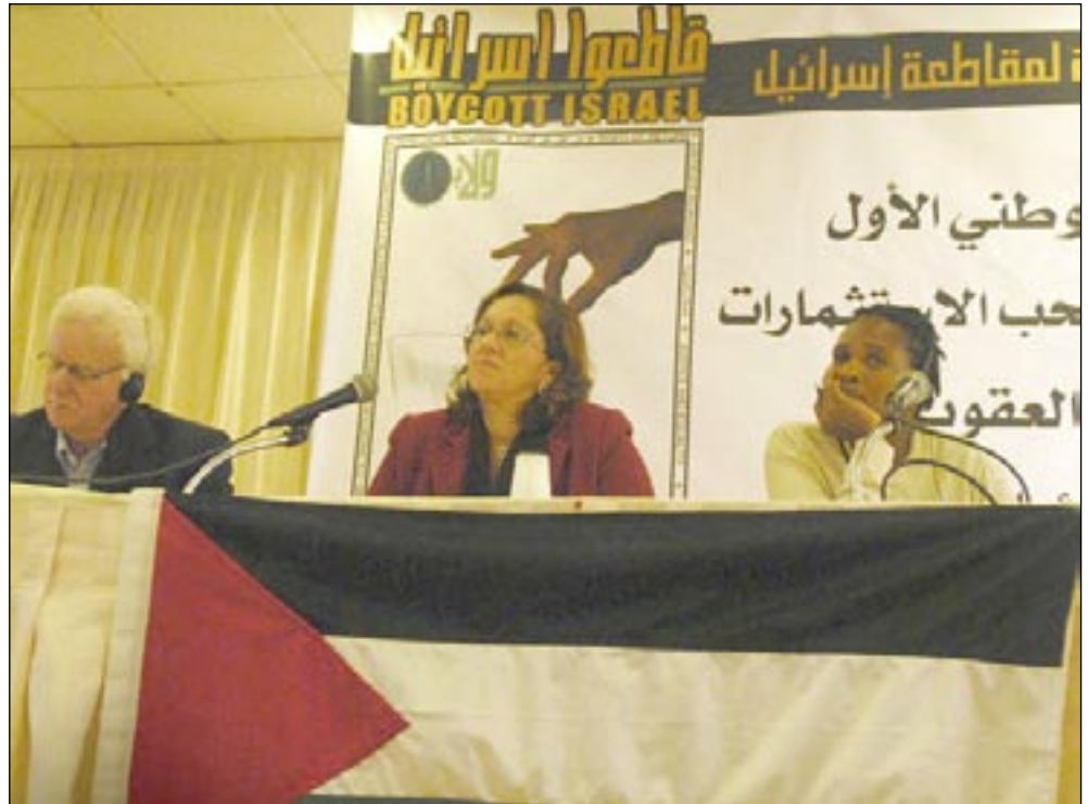
A Panel at the First Palestinian BDS Conference, Ramallah, Palestine

End of November 2007 to End of March 2008