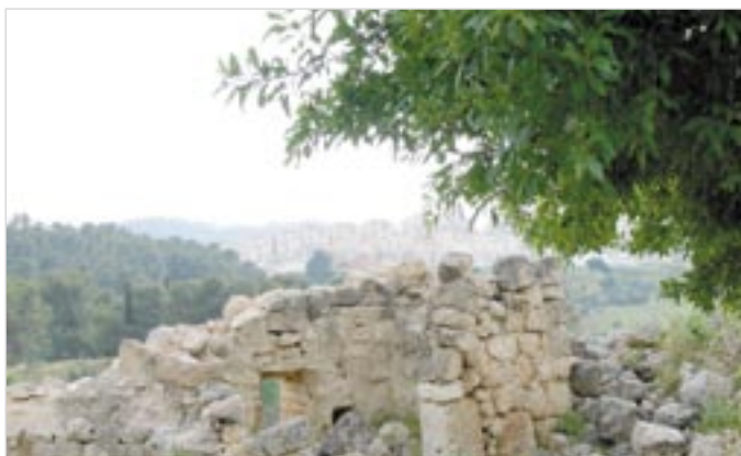
Depopulated village of Deir Aban, 2007.

I was around 17-18 years old when we were expelled from our village, Deir Aban. This was 18 October 1948. We had heard that the Zionists had occupied Akka, Jaffa, and many villages and that massacres occurred, such as in Deir Yassin. We heard that the Zionists had put the dead and injured people into a hole and buried them alive in Deir Yassin, the same day that we heard that Abdelqader Husseini was killed. A street was later built on top of them. We were very afraid and when we heard about the story of Deir Yassin, all the civilians in the village went to hide in the mountains. Only the fighters remained, we had one gun per fifteen persons in the village. We stayed in the mountains for four months, until the Zionists attacked the village. Eighteen fighters were killed during the clashes and we had no choice but to leave in search of a safer place. I remember the names of all the fighters who died as well as the names of the two women who were killed by a bomb while picking fruits, some were members of her family. We all left on foot to al Khadr while the fighters went to Hebron. We lived under the trees in al Khadr, in the rain and cold.