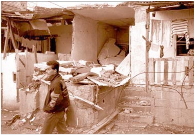
Destruction of Dbayeh camp, Lebanon.

States and Turkey; my parents sent them away because they did not want to lose another son.