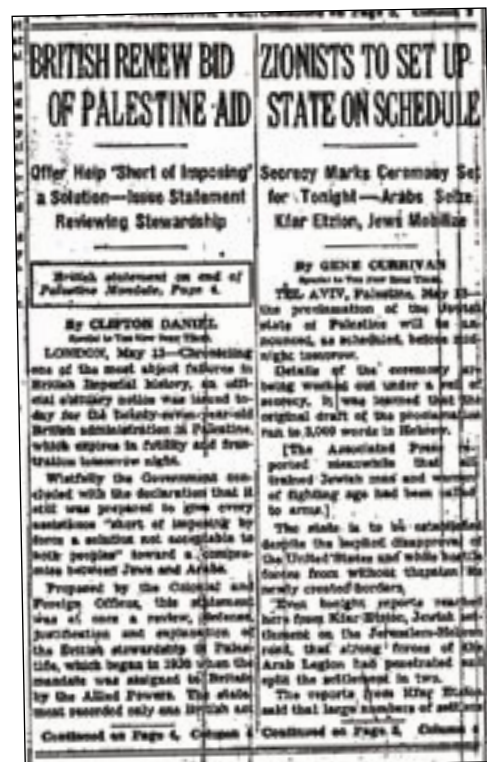
From the front page of The New York Times, 14 May 1948.

Due to the above, Arabs, including the indigenous population of Palestine, were strongly opposed to a British Mandate over Palestine. Britain, however, insisted that, “ in the case of the ‘independent