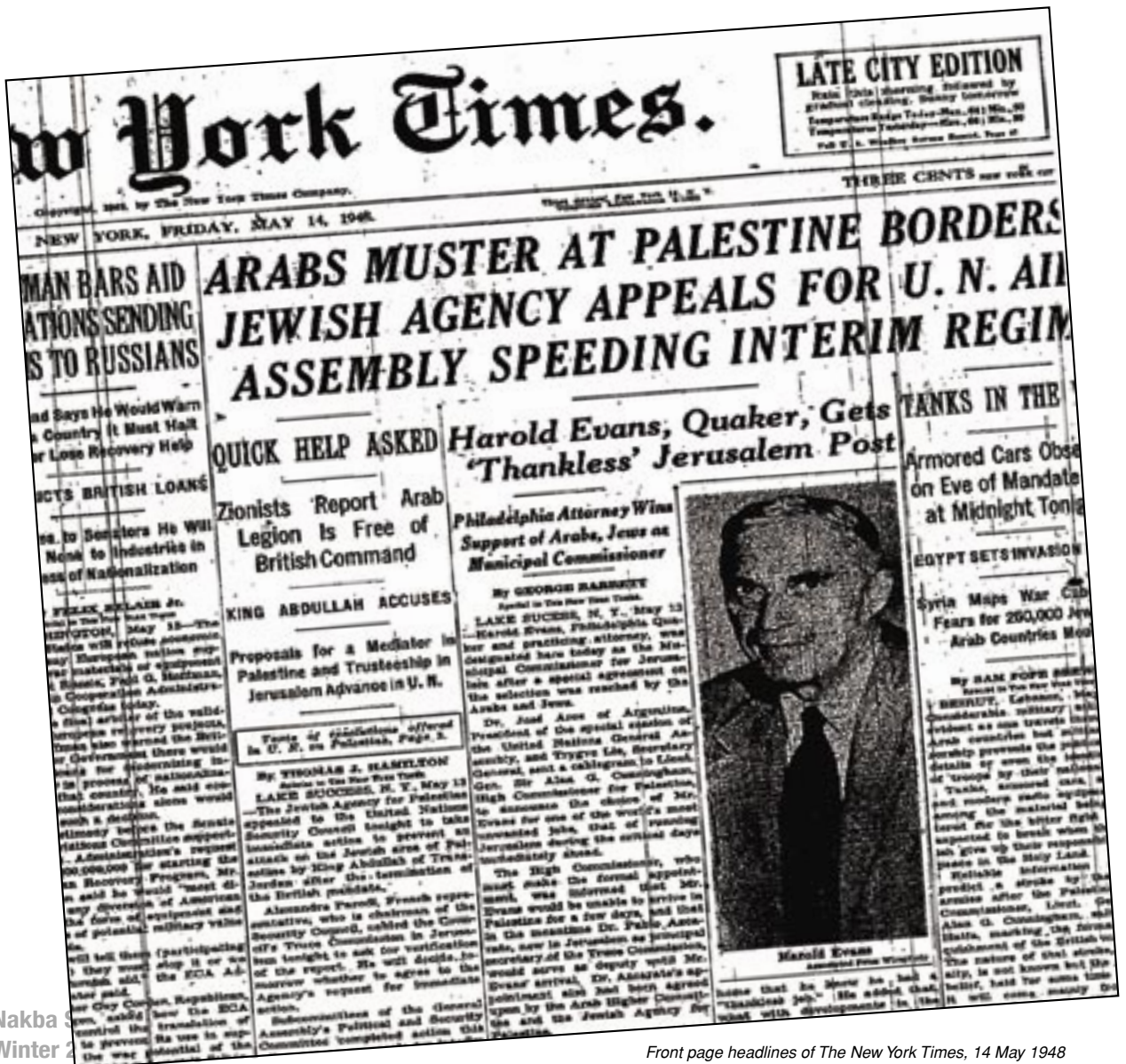
Front page headlines of The New York Times, 14 May 1948

The United Nations, its bodies, including the Permanent Forum on Indigenous Issues, and specialized agencies, including at the country level, and States shall promote respect for and full application of the provisions of this Declaration and follow up the effectiveness of this Declaration.