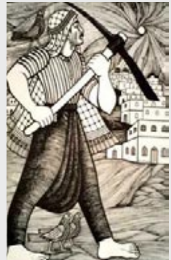
Land Day Poster (1984), by Abdel Rahman Al-Muzain.

(Excerpt adapted from Nadeem Muaddi, "The Significance of Land Day")