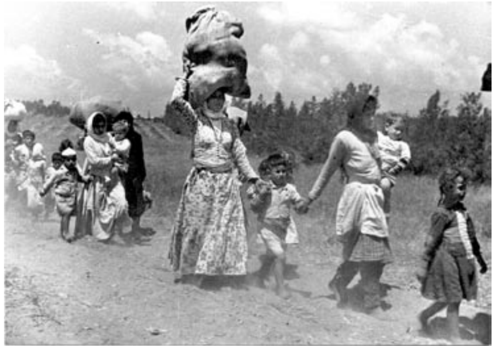
Palestinian refugees fleeing the war near Tulkarem in 1948.