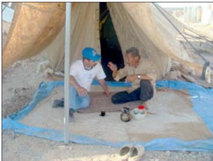
Palestinian refugee talking to a UN aid worker in Al-Tanf camp, Iraq.