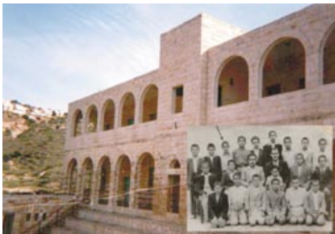
Village school (1993) – last school graduates (1947)

After 10 years of exile, my grandfather died and left the responsibility of the family to his elder son "my father" who was only 14 years old. My father had to work while he was attending school, he collected plants and herbs from the lands of other people in return for a meager pay. His mother had to serve rich people in Aleppo to support her children. This situation was intolerable to my father, and in 1958 he decided to move the family from Aleppo to Damascus in search of a better life.