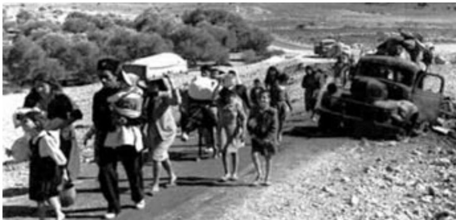
Palestinians fleeing the war near Tulkarem in 1948.

Many will agree that the past few months have posed many challenges to Palestinian unity; yet, when reading the stories of Palestinian refugees and internally displaced scattered around the world, one cannot but feel the symbiotic union of a people; something that transcends borders and politics, “something of the heart”, as a boy in the Al-Wihdat refugee camp puts it.