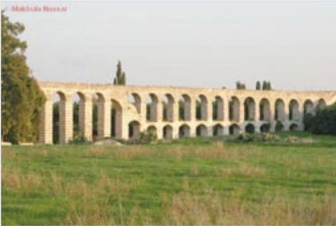
Arch still standing in Al-Sumariyya, 2008.

Al-Sumariyya. Knowing that they would soon come under attack, the villagers of Sumariyya had evacuated most of the women, children, and elderly to Akka and other neighboring villages before the Carmeli Brigade descended upon the village on 14 May 1948. Repeating the same tactic used for the ethnic cleansing of most Palestinian villages, the Brigade attacked from the South and Northwest, leaving a passage to the East for villagers to escape. The village's resistance fighters attempted to repel the attack from the northwest, but suffered very heavy casualties. The village was mostly destroyed. Only one of the rooms from the mosque, and few of the walls and arches from some of the village buildings remain standing. One month after the destruction of Sumariyya, the village was leveled by the Jewish National Fund with authorization from David Ben-Gurion, and in January 1949 the kibbutzes of Lochamey ha-Geta'ot and Shamrat were constructed on the village lands.