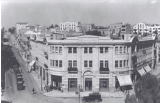
Cafe Europe on Zion Square, 1935.

Jerusalem, the Eternal Capital. A hub of political, social, cultural and economic life for the Arabs and Jews who lived in the city before 1948, Jerusalem has held a renowned deep religious significance for adherents of the three monotheistic religions of the world. It is for this reason that the UN Partition Plan (Resolution 181) of 1947 set this city aside as a corpus separatum to be administered by the international community. When news of the Partition Plan reached the Christians and Muslims of Jerusalem, they spontaneously broke out into riots across the city. The response from the Zionist Irgun and Stern gangs was to detonate bombs targeting these Arab civilians. The Jerusalem commander of the Haganah , commanding over 5000 troops, ordered the expulsion of the Arab inhabitants of Jerusalem's mixed and predominantly Jewish neighborhoods; a task which had been mostly completed by January 1948. The villages to the west of the holy city, including Romeima, Lifta, and Sheikh Badr, were also depopulated and occupied in the same period. On 7 February 1948, David Ben Gurion told the Mapai council: "From your entry into Jerusalem, through Lifta, Romeima... there are no Arabs. One hundred percent Jews... in many Arab neighborhoods in the west one sees not a single Arab. I do not assume that this will change... What has happened to Jerusalem... is likely to happen in many parts of the country." (continued on page 59)