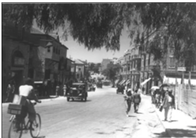
Jaffa Street, Jerusalem, 1935.

In Palestine, I worked as an engineer for four years, always with the pain of not being able to live in freedom - when one gets used to freedom, it is difficult to live without it. I also worked in Jordan but for political reasons I was forced to leave and return to Chile, where I succeeded professionally.