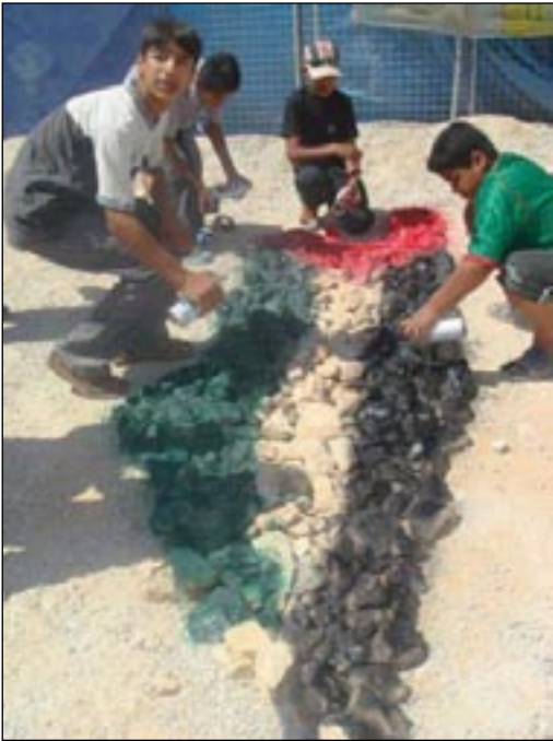
Palestinian refugee youth painting the colors of the Palestinian flag on a map of Palestine in Al-Tanf camp.