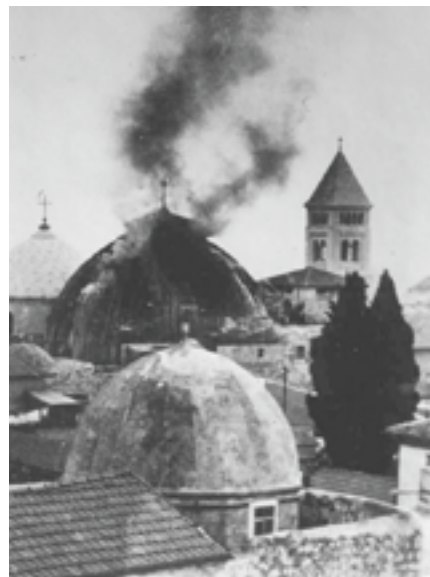
Fire in the Church of the Holy Sepulchre, Jerusalem, 1948.