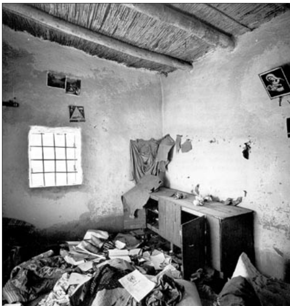
A destroyed Palestinian refugee shelter, Ein Al-Sultan destroyed camp, Jericho 1967.

discriminatory, apartheid-like legal regime over Palestinians in Israel for the same Zionist policy objectives: 47 in the course of 41 years, Israel's regime of occupation has prevented refugee return, facilitated confiscation of Palestinian land and Jewish colonization, and displaced more of the occupied Palestinian population. These policies have been implemented irrespective of the US-led peace efforts between Israel and the PLO (since 1991) and the presence in the OPT of the international community (since 1967) and the Palestinian Authority (since 1994). They have changed the demographic composition of the country and prevented self-determination of the Palestinian people: by 2007, the approximately 450,000 Jewish settlers in colonies in the occupied West Bank, including eastern Jerusalem, constituted 15% of the population in this area, Israel held at least 45% of the land, and the construction of the Wall annexed, de facto , over 10% of the land of the West Bank. 48