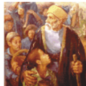
Ismail Shammout's "We Shall Return", 1954

Al-Lydd. A major Palestinian city before 1948, Al-Lydd’s 19,000 Palestinians were reduced to 1,052 after the Zionist assault that lasted several months due to Palestinian resistance. To overcome this resistance, the Zionist military forces used airborne fighter bombers for the first time to bomb the city and its nearby airport. Soon after the city’s occupation on 11 July 1948, the Israeli army committed its largest massacre in Palestine, which resulted in the murder of 426 men, women, and children. At least, 176 of these people were slaughtered in Dahmash mosque, the city’s main place of worship. Most of the city’s inhabitants were forced to flee to Ramallah, and many continued to Jordan. 350 Palestinians died en route due to exhaustion and dehydration. One of these refugees was Ismail Shammout (d.2007), considered the Dean of Palestinian artists, who depicted the exodus from Al-Lydd in his early paintings. Al-Lydd was renamed Lod by the Israeli government. Also on the lands of Al-Lydd lie the colonies of Zeitan in the north, Yagel nearby the airport, Ahi’Eser between them, and Ginnaton to the east.