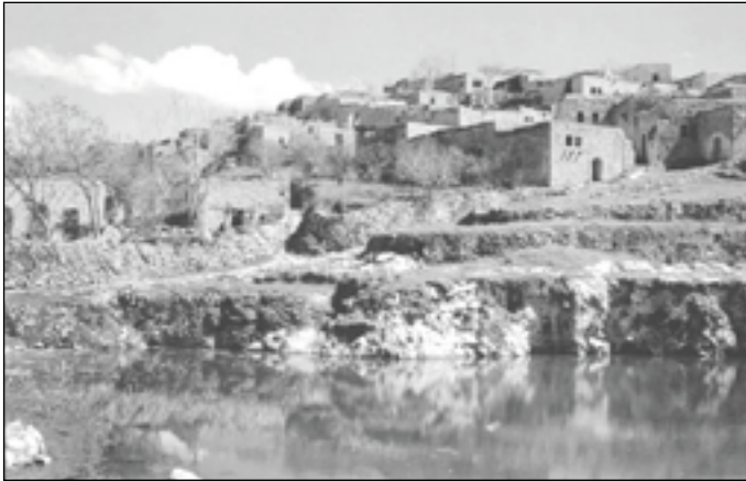
Depopulated village of Suhmata

Suhmata. The ethnic cleansing of Palestine was well under way when Israel's Golan brigade began its bombardment of the village of Suhmata in late October 1948. The over 1100 inhabitants of the village were expelled to Lebanon and Syria with only a tiny proportion of the villagers managing to stay in their country. Around 600 of the people of Suhmata are Israeli citizens today, with the colonies of Tzuri'el and Chosen, as well as part of the Israeli city Ma'alot built on the village lands. At the beginning of January 2008, the Israeli Northern District Planning and Building Committee announced new plans to construct yet another new neighborhood east of Ma'alot on Suhmata's confiscated lands. The neighborhood will consist of an estimated 3500 housing units, annexing what remains of Suhmata's lands. Internally displaced Suhmatans have set up a website for the people of the village, and have launched a campaign to prevent Ma'alot's expansion on what remains of their village lands. For more see http://www.suhmata.com