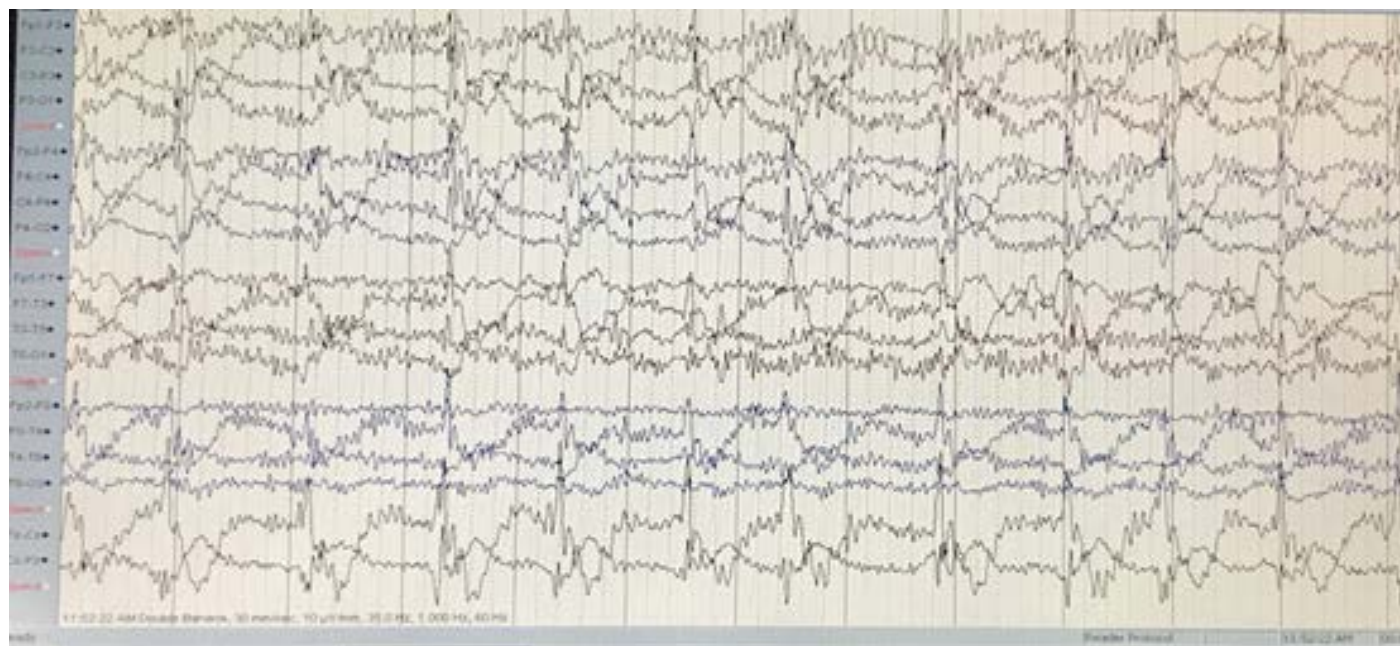
Figure 2: Slow background with High Amplitude Delta waves with superimposed poly Spikes (RHADS)

(Table 1) shows whole exome sequencing results conducted for her. Likely, pathogenic missense variant (c.3286C>T, p.Arg1096Cys) was identified in homozygous form in Polymerase, DNA, Gamma; POLG gene (OMIM#174763). This variant is known to cause Mitochondrial DNA depletion syndrome 4A (OMIM# 203700). Upon reviewing her brother's records, following findings were reported in (Figure 3A, 3B, and 3C). (Figure 4) shows EEG report for her brother.