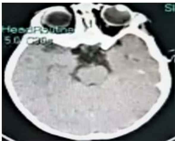
Figure 1: Normal axial view non contrasted CT brain

(she was under effect IV sedation and antiepileptic) did not show any signs of systemic disease or focal motor deficit. She had normal optic discs and macula exam, with no neurocutaneous stigmata. Her course in the hospital was less than 7 days, but she started to require maximum ventilator and hemodynamic support upon admission. She was covered initially with broad spectrum antibiotics and antiviral, screened for infections and her medications were adjusted accordingly. Following investigations were conducted: CBC, sugar, sodium, potassium, magnesium, renal profiles, hepatic profiles, ammonia, and lactate and blood gases. Toxicology screening was provided to measure the approximate amount of drug given, but showed negative findings. Her lab work values were normal for which she was planned for MRI. However, because of her general condition, only brain CT scan was done, which showed normal study (Figure 1). Moreover, her electroencephalography (EEG), showed slow background with high amplitude Delta waves with superimposed poly spikes (RHADS) as shown in figure 2.